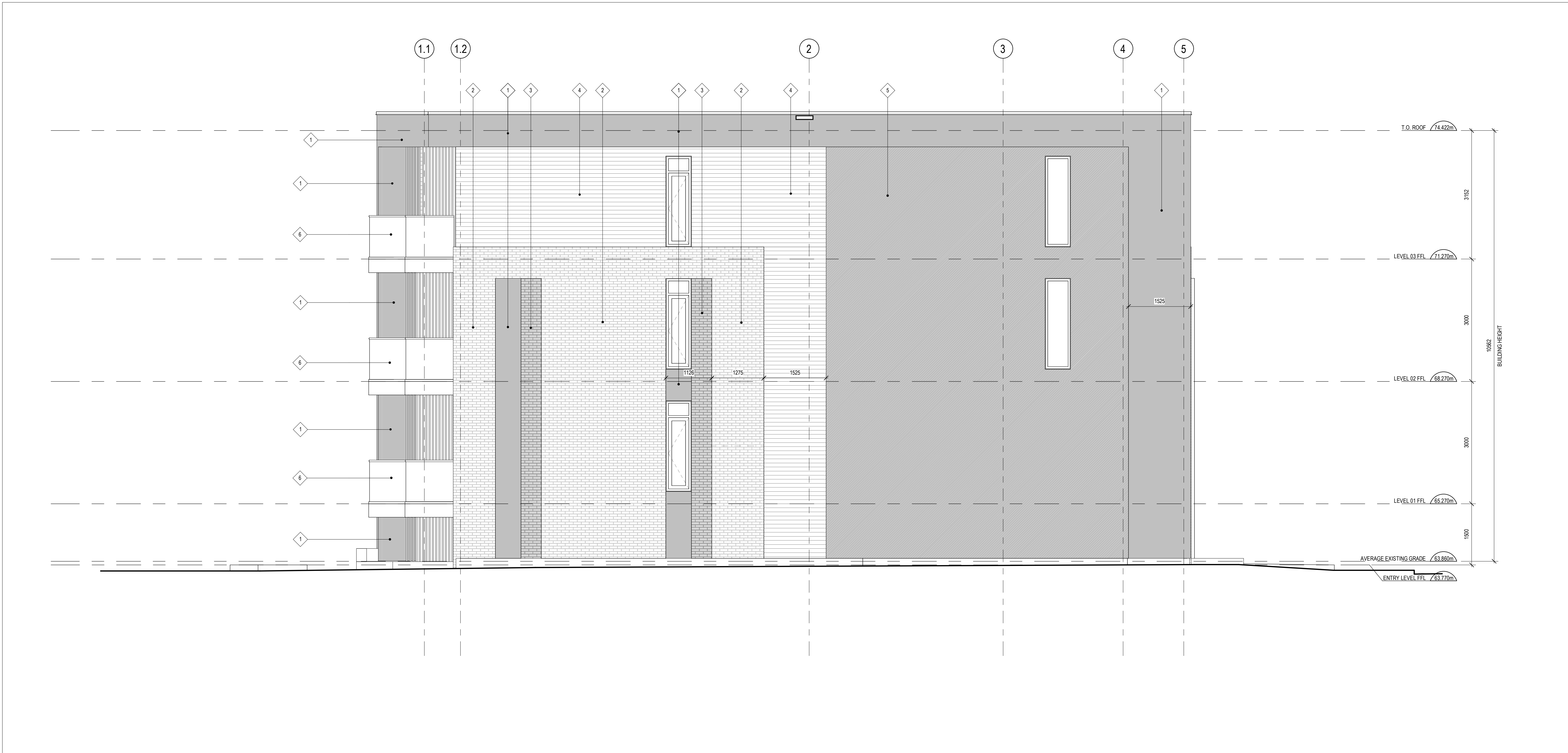
1 WEST ELEVATION A202 SCALE: 1 : 50