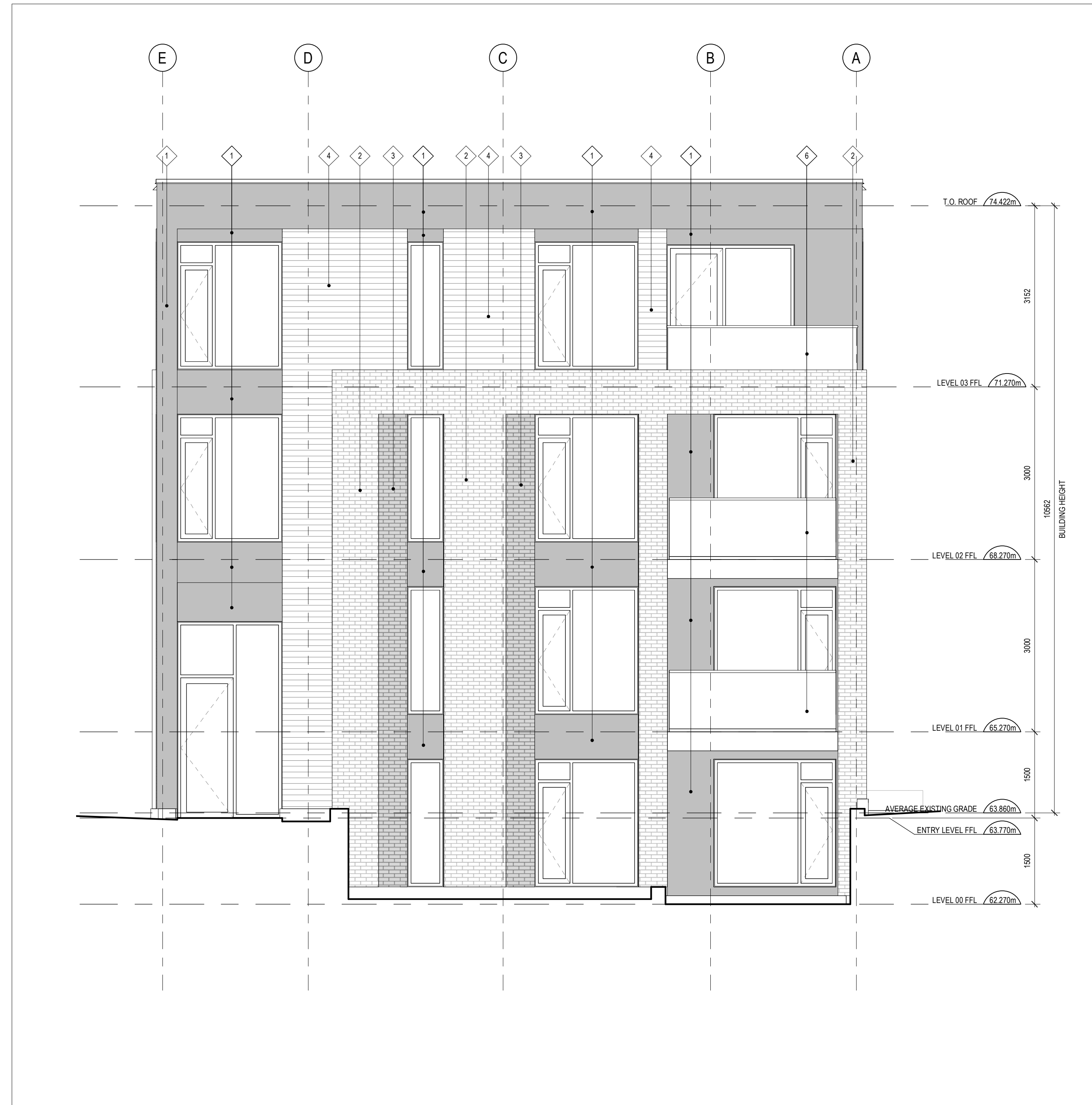
1 SOUTH ELEVATION A200 SCALE: 1 : 50