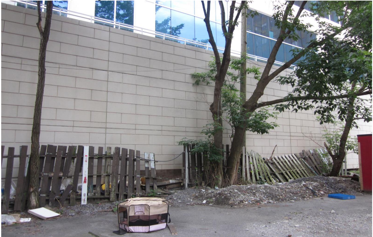
Picture 2. Boles of trees #1-4 (left to right) at 150 Laurier Avenue West (note snow clearing damage at base).