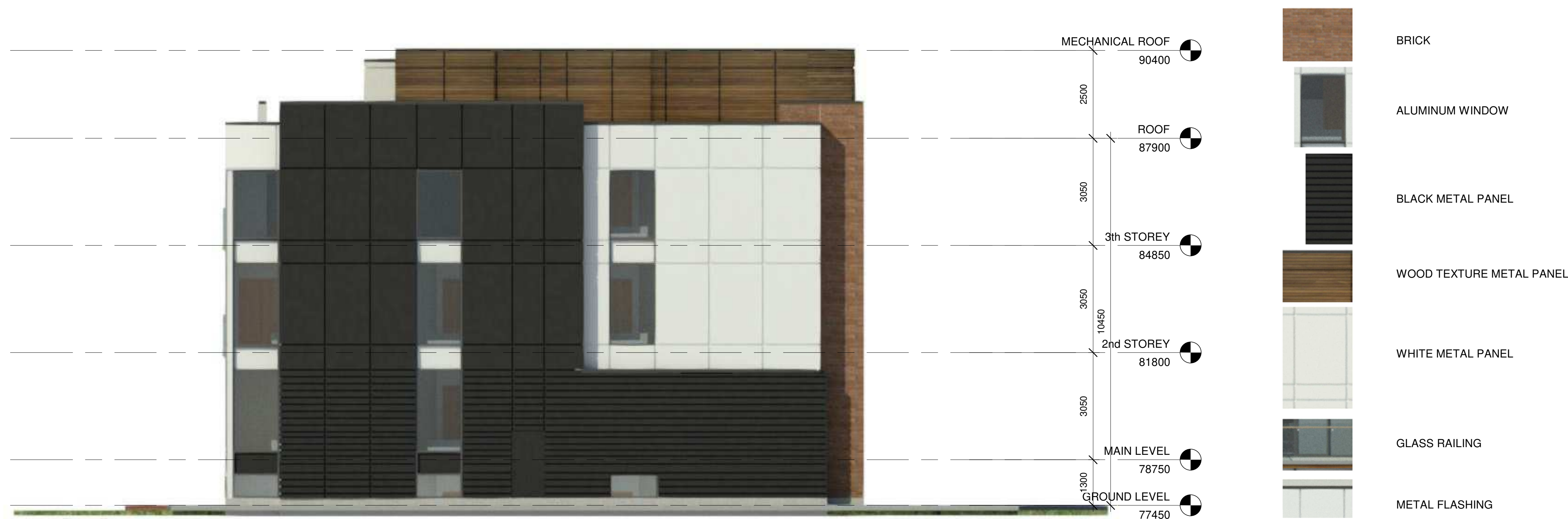
3 SOUTH ELEVATION -- A111B 1:50

ALL CONTRACTORS TO VERIFY ALL DIMENSIONS ON SITE AND TO REPORT ALL ERRORS AND/OR OMISSIONS TO THE ARCHITECT. ALL CONTRACTORS MUST COMPLY WITH ALL CODES AND BYLAWS AND OTHER AUTHORITIES HAVING JURISDICTION OVER THE WORK. DO NOT SCALE DRAWINGS. THIS DRAWING MAY NOT BE USED FOR CONSTRUCTION UNTIL SIGNED BY THE ARCHITECT. COPYRIGHT RESERVED.