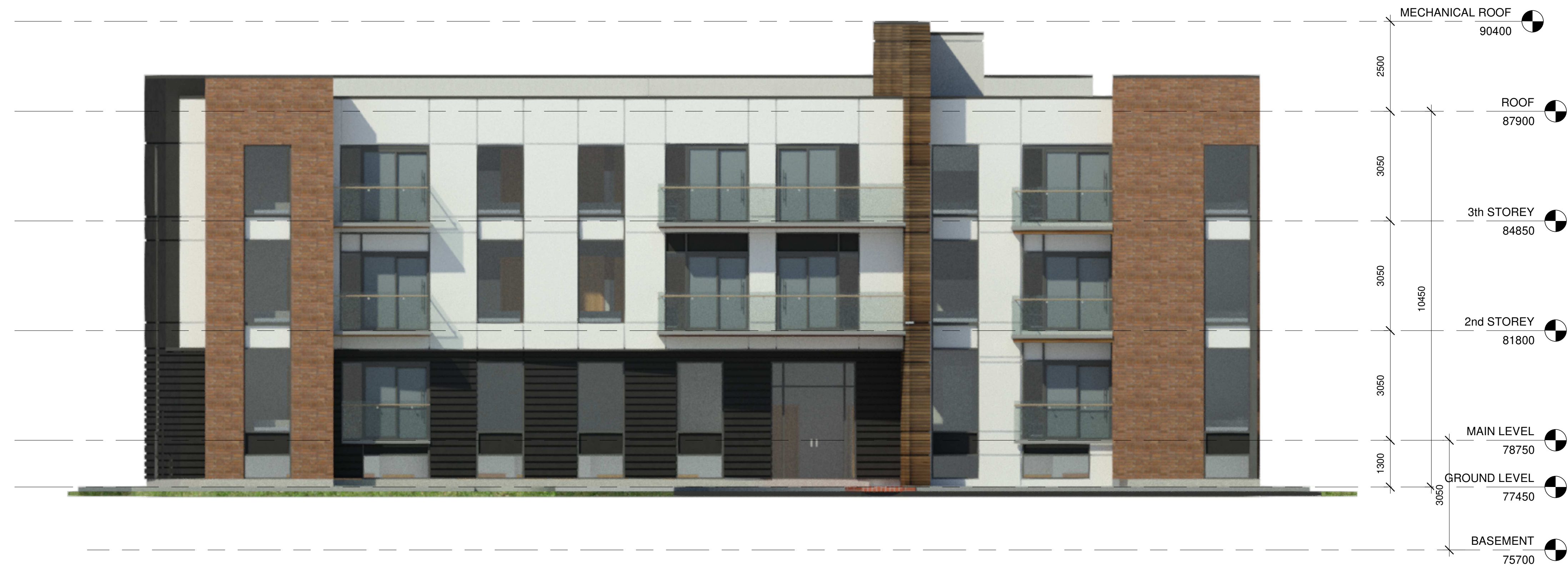
2 WEST ELEVATION - A110B 1:50