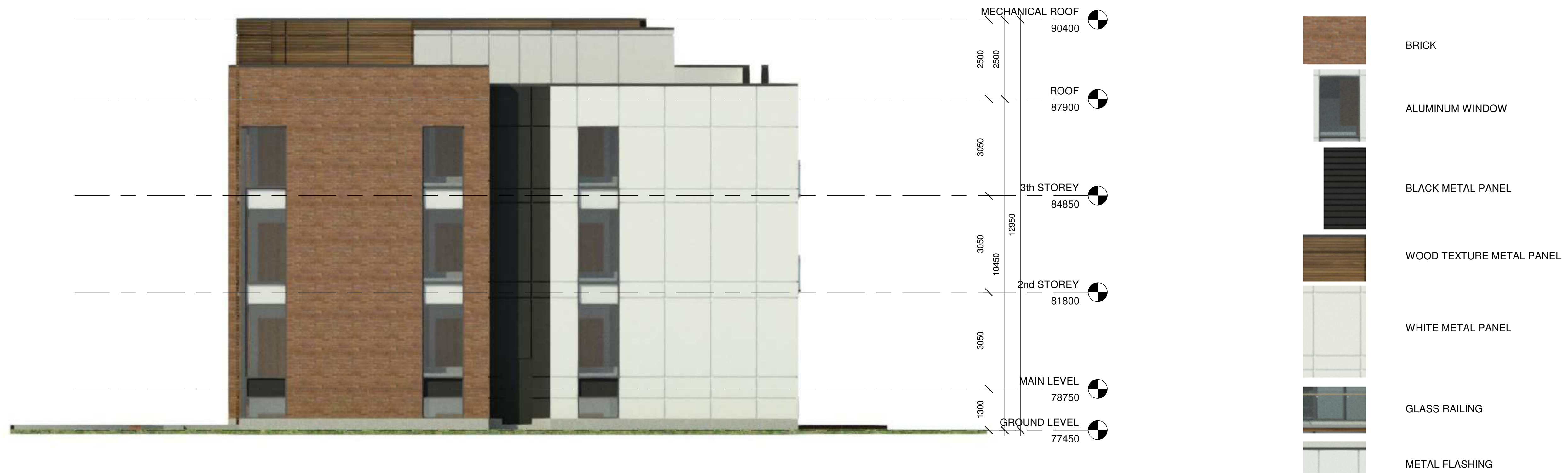
1 NORTH ELEVATION -- A110B 1:75