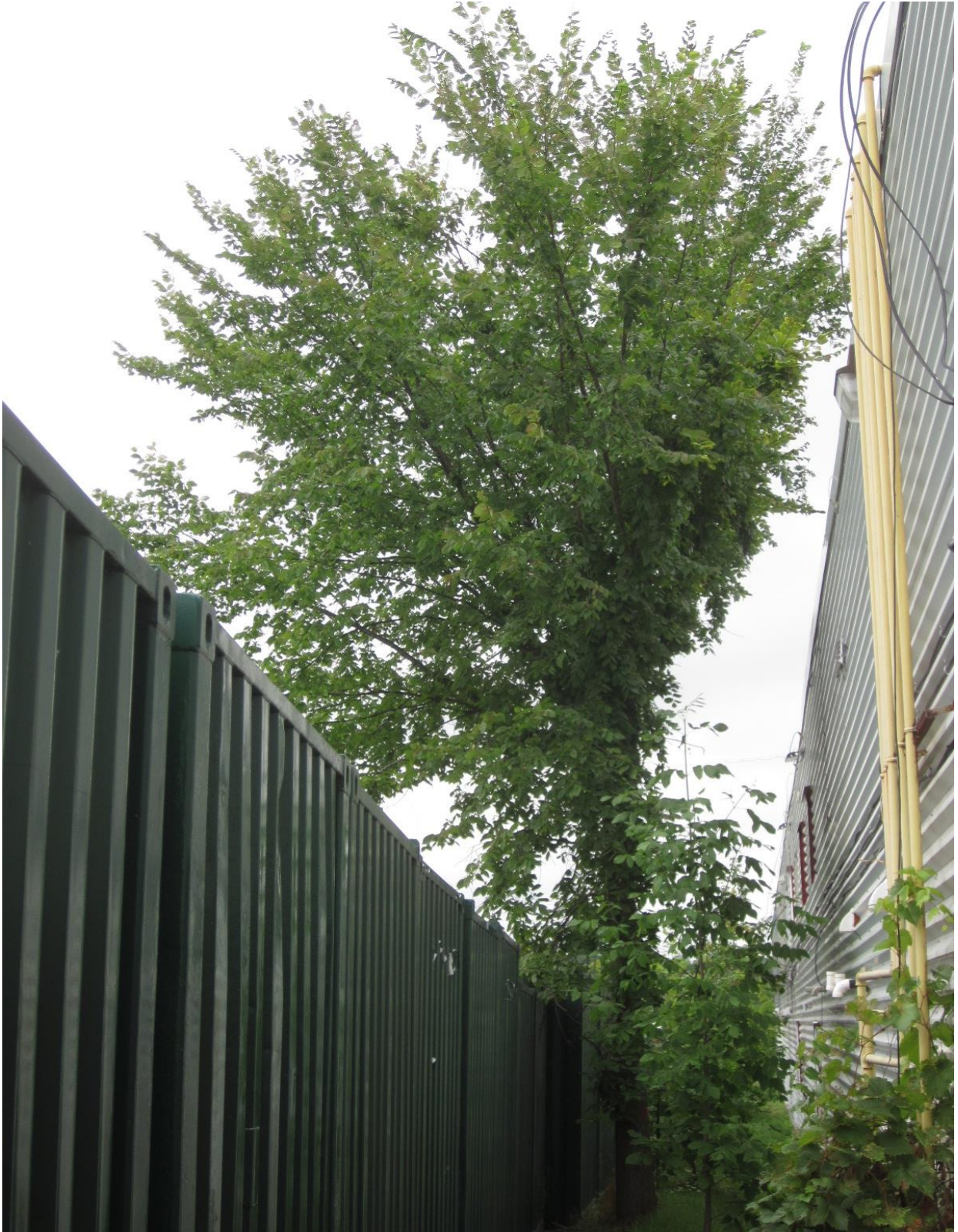
Picture 1. Tree #1, private white elm at 1400-1410 Youville Drive