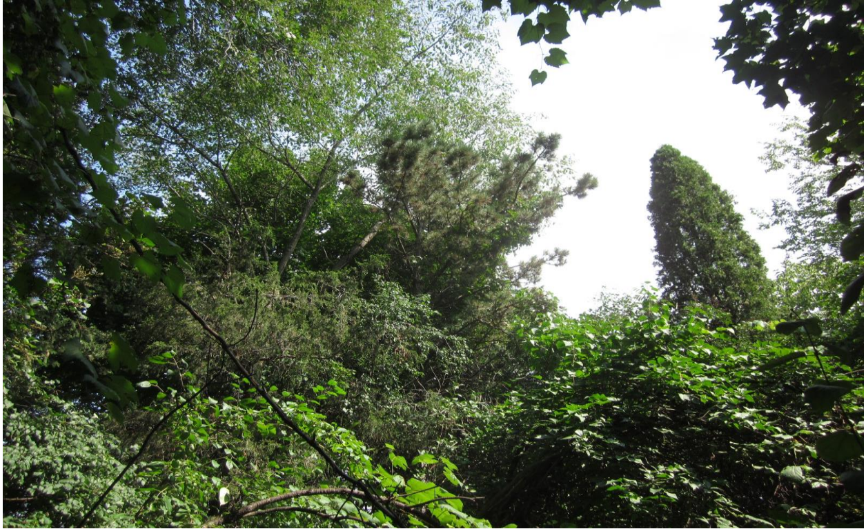
Picture 5. Trees #35, Austrian pine (centre) and #36, Emerald cedar (right) at 1649 Montreal Road/741 Blair Road