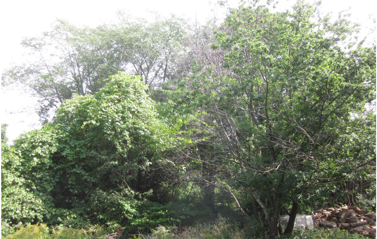
Picture 6. Trees #25, Siberian elm (left background), #24, white cedar covered in vines (left foreground) and #49 English oak (right) at 1649 Montreal Road/741 Blair Road