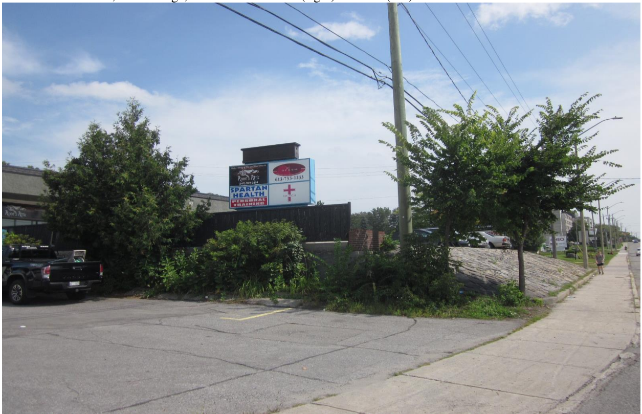
Picture 8. Trees #44, white cedar (left), and white elms #45 and 46 (right) at 1649 Montreal Road/741 Blair Road