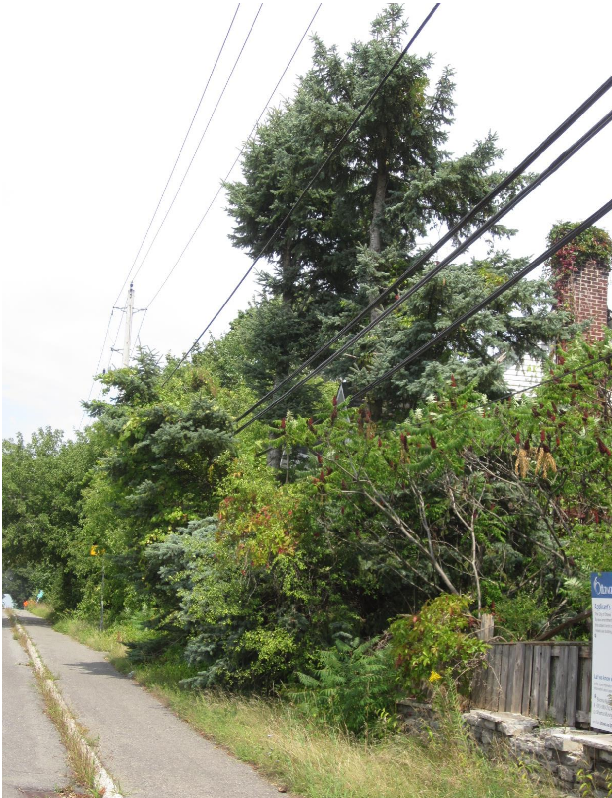
Picture 2. Trees #6 and #7, Colorado spruce at 1649 Montreal Road/741 Blair Road