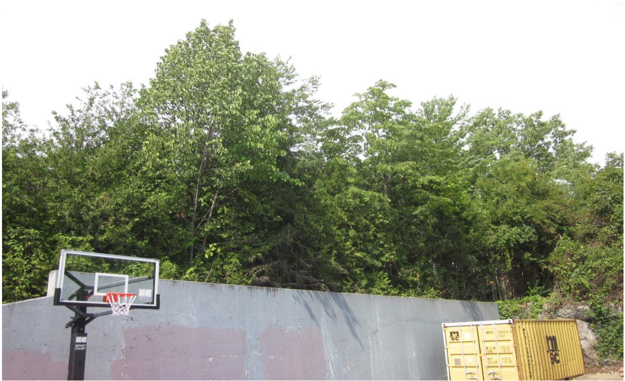
Picture 7. Trees #38, cedar hedge, and basswoods #39 (right) and #41 (left) at 1649 Montreal Road/741 Blair Road