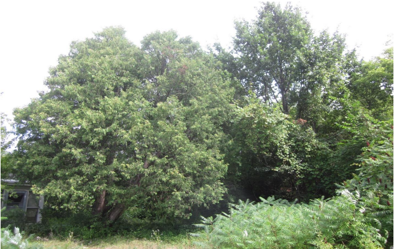
Picture 3. Trees #17, white cedar (left) and #18, English oak (right) at 1649 Montreal Road/741 Blair Road