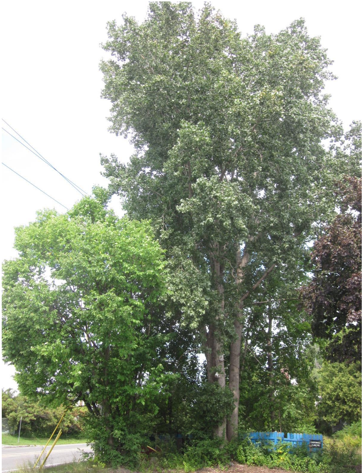
Picture 1. Trees #1 and #2, white elm (left) and cottonwood (right) at 1649 Montreal Road/741 Blair Road