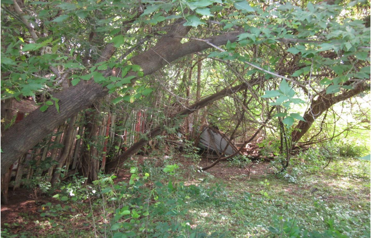
Picture 4. Trees #13 through #16, white cedars at 1649 Montreal Road/741 Blair Road