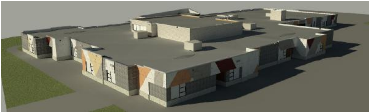
Massing model looking to the West from Bradwell Way(rear of building)