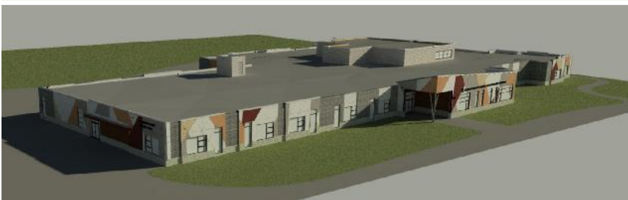
Massing model looking to the South-East from Kelly Farm Drive (Childcare Entrance and Main Entrance)