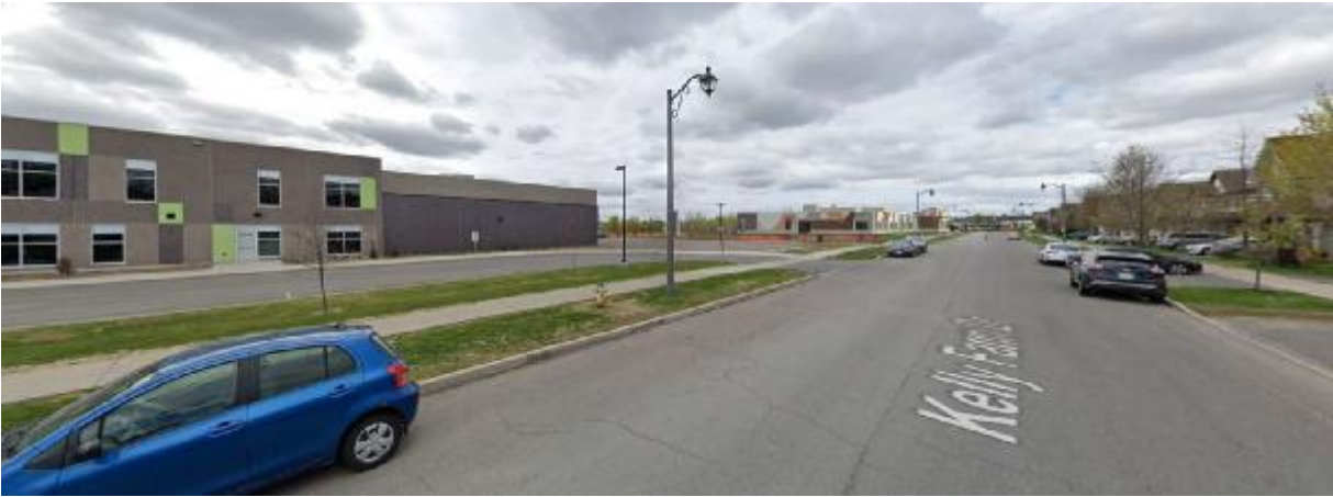
View along Kelly Farm Drive approaching site with context