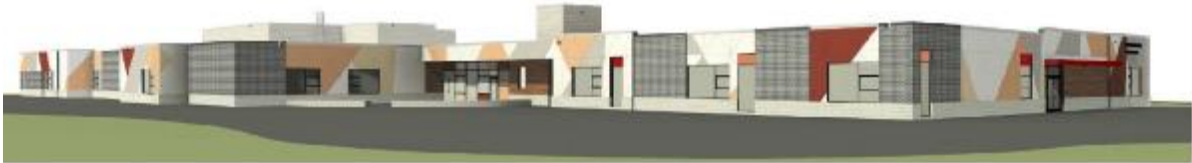
View from rear yard