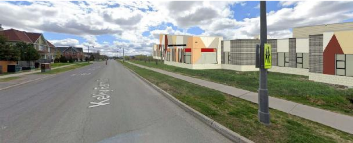
View from intersection of Kelly Farm Dr and Bradwell Way with context