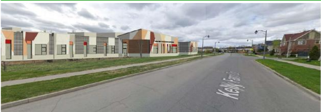
View along Kelly Farm Drive going West bound with context