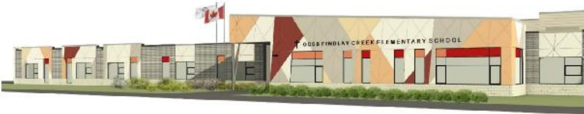
Close up of main entrance