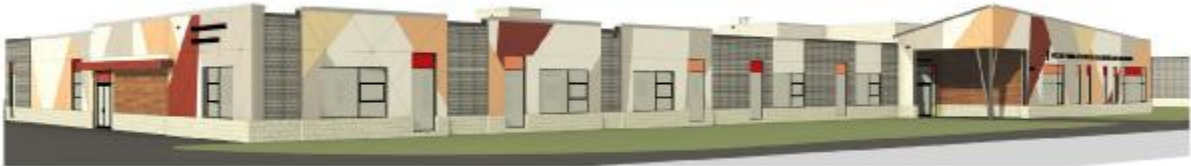
View from Kelly Farm Dr