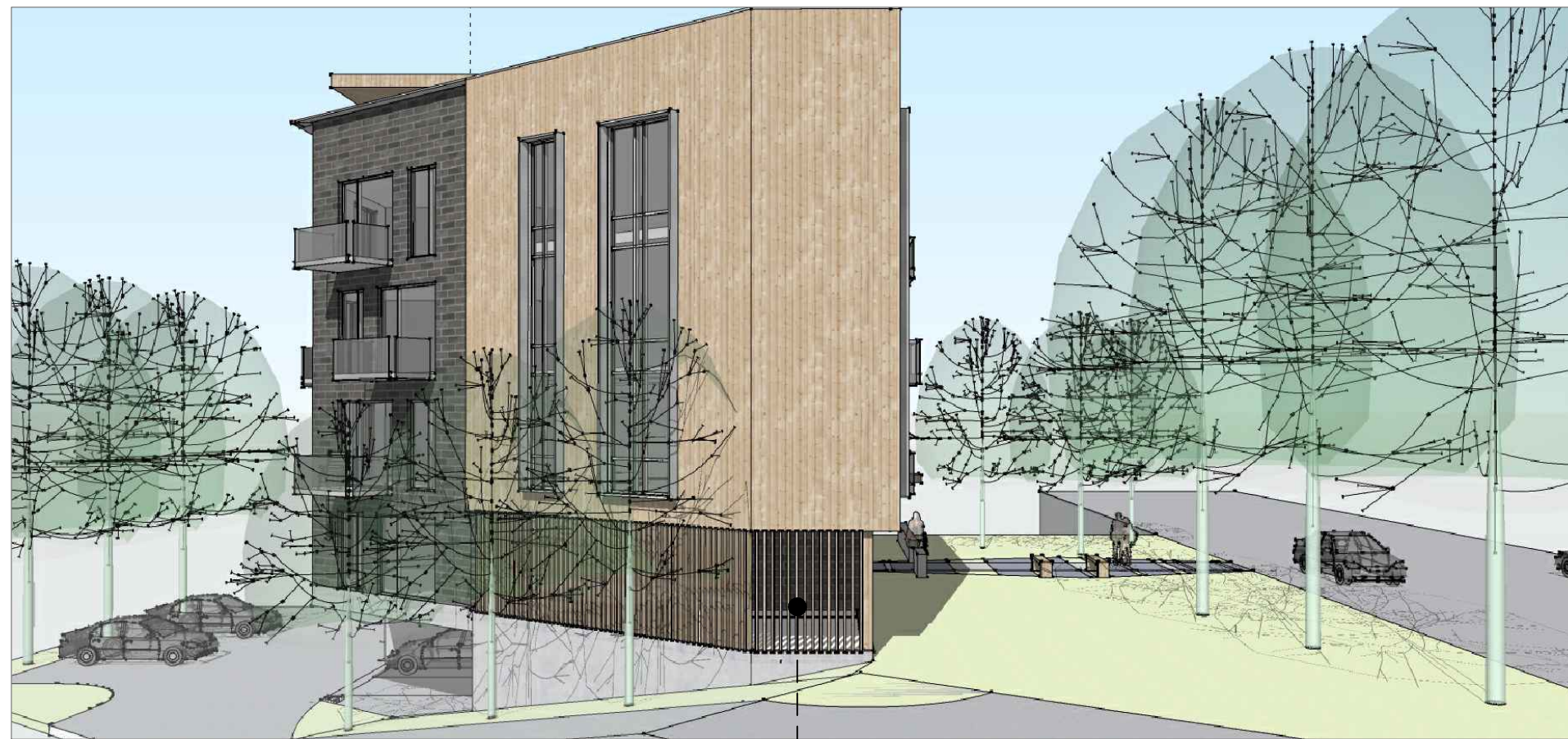
WOOD LATTICE - surrounding amenity space