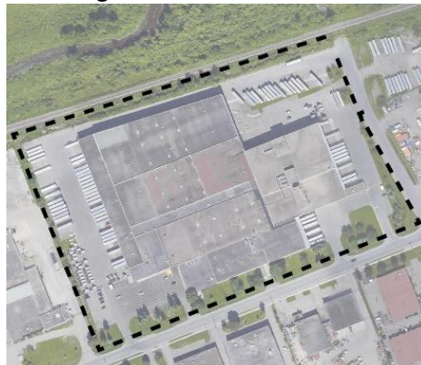
Figure 1: Existing Site Location and Bounding Streets

The subject property location is shown in Figure 1 .