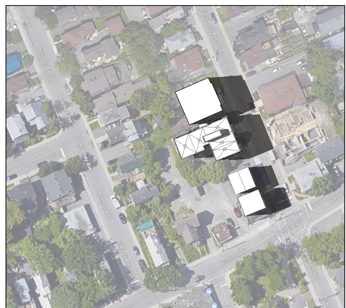
10 Summer Solstice 4pm SS-1 SCALE 1: 1000