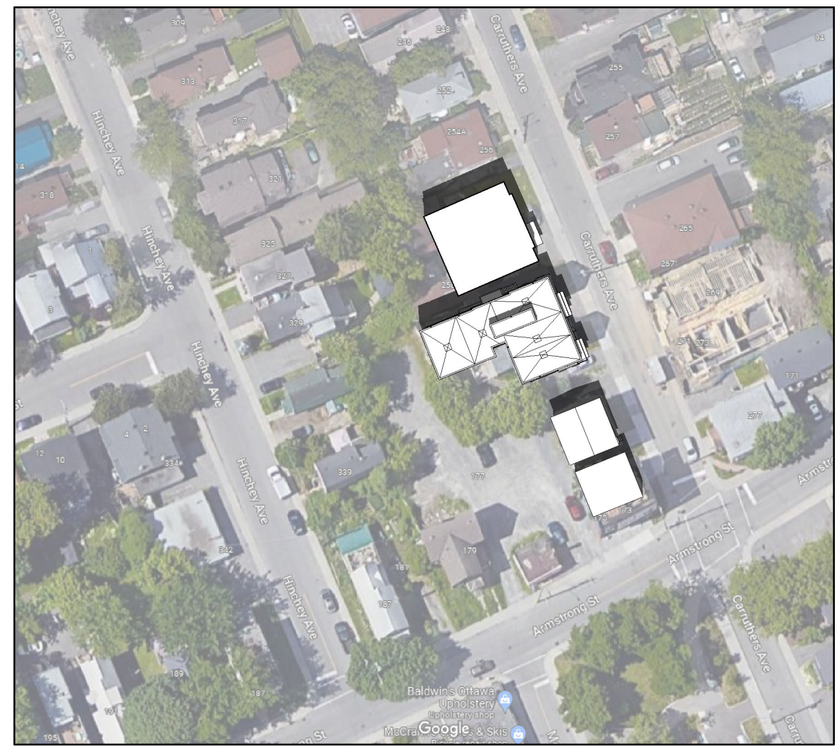
6 Summer Solstice 12pm SS-1 SCALE 1: 1000