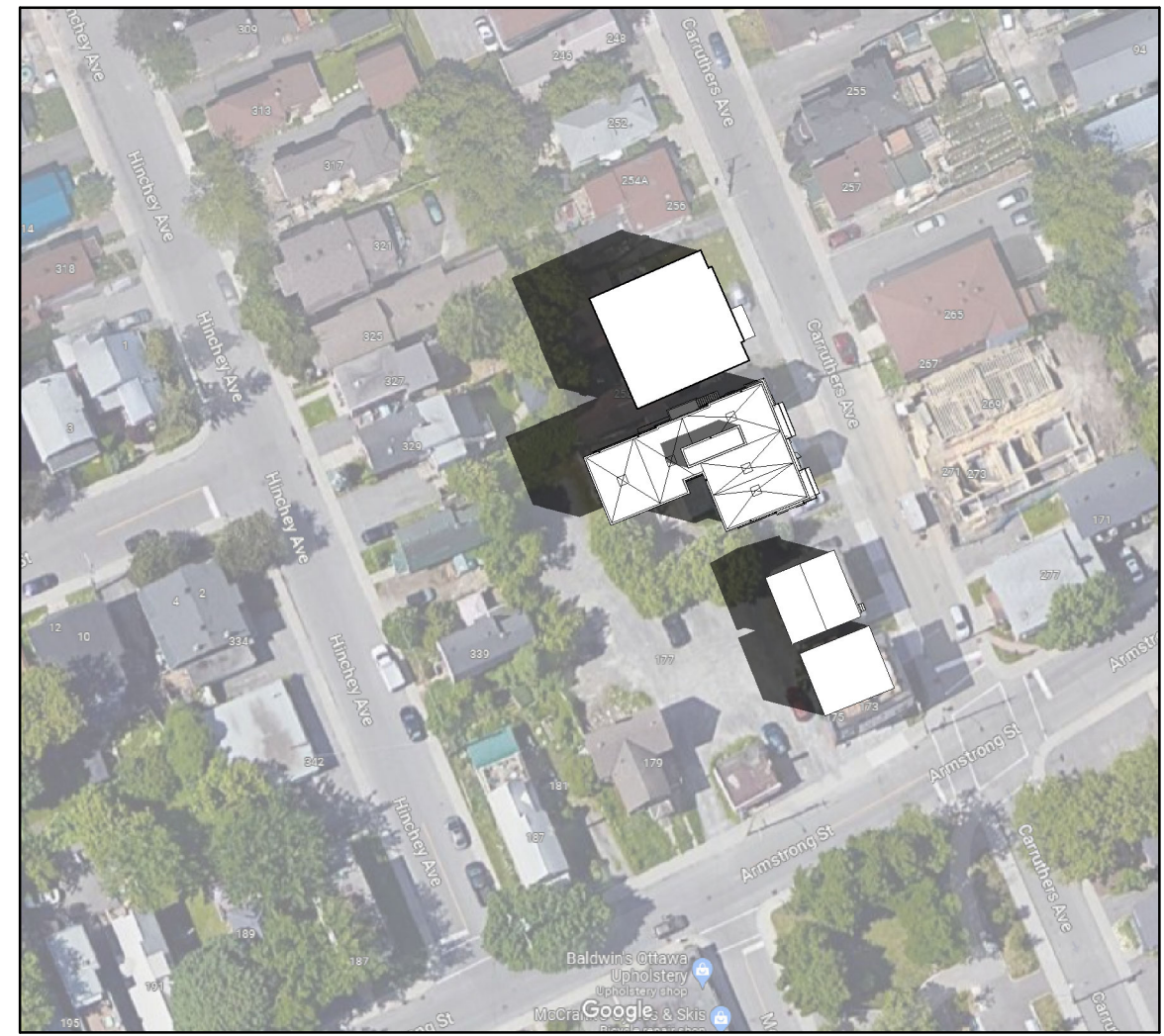
2 Summer Solstice 9am SS-1 SCALE 1: 1000