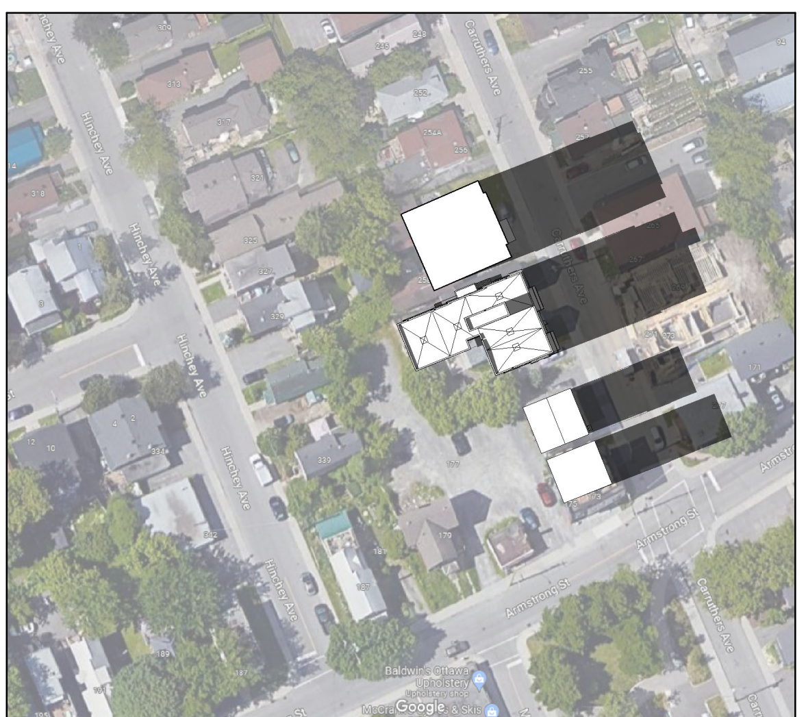
11 Fall Equinox 4pm SS-1 SCALE 1: 1000