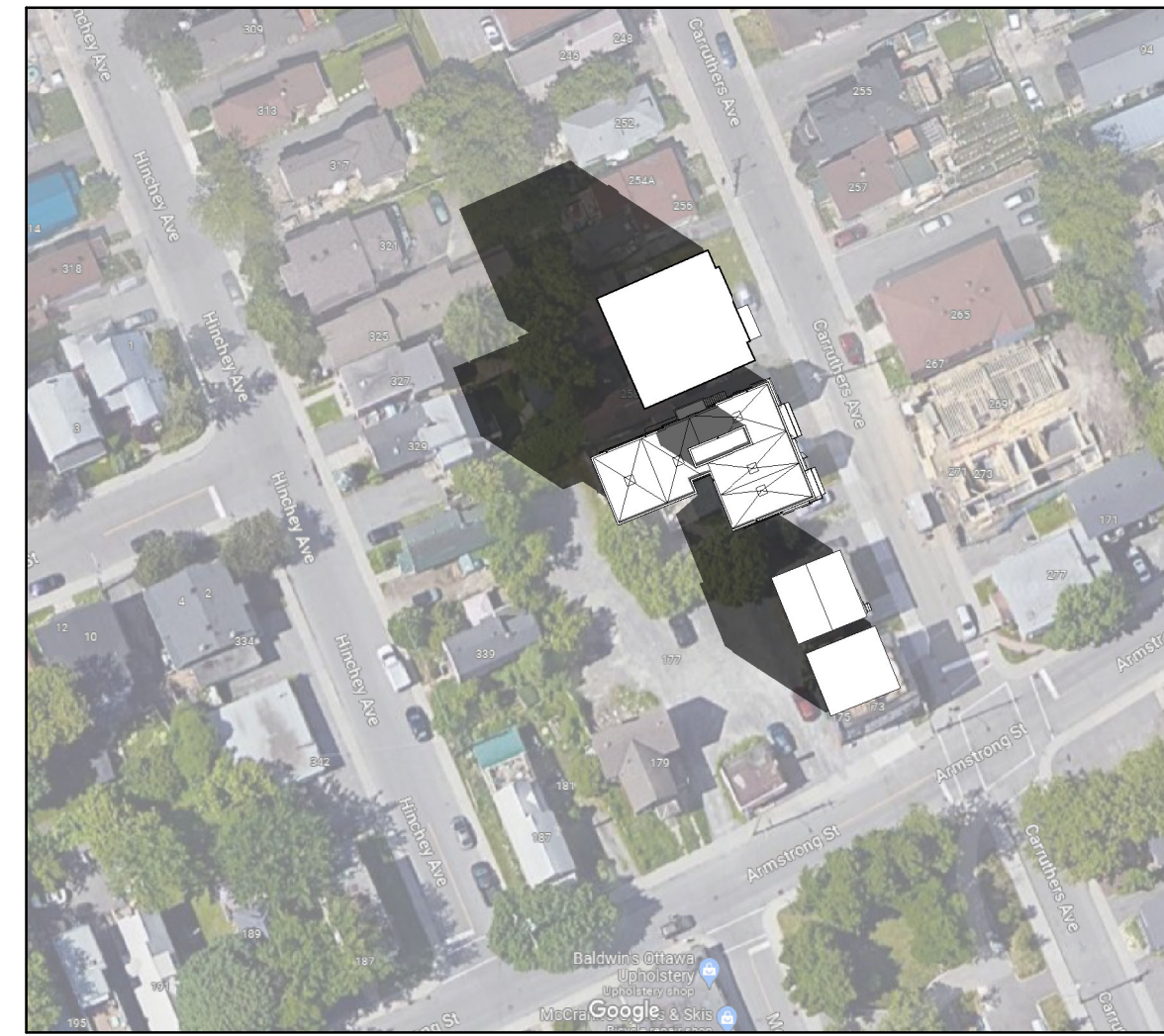
1 Spring Equinox 9am SS-1 SCALE 1: 1000