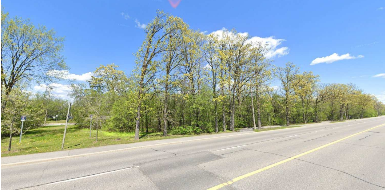
Figure 6 - Vantage point #2