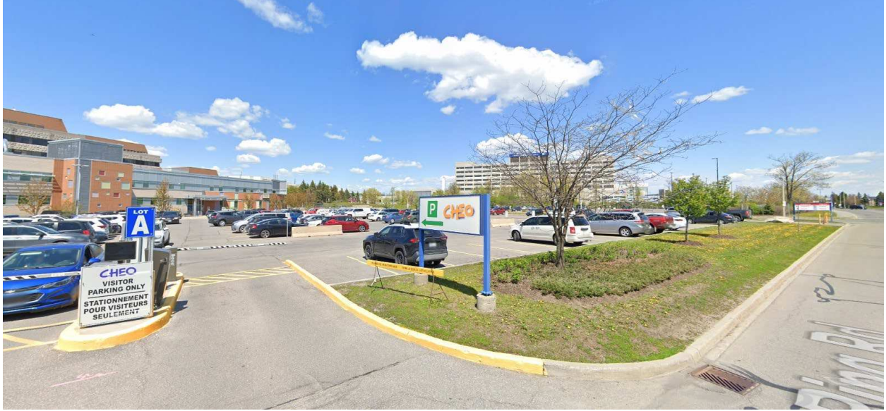
Figure 8 - Vantage point #4