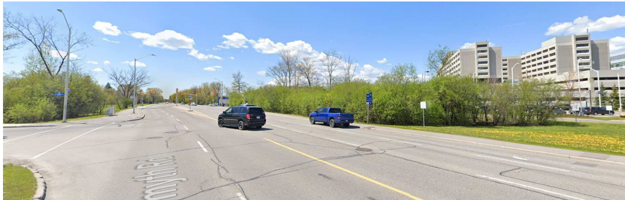
Figure 5 - Vantage point #1