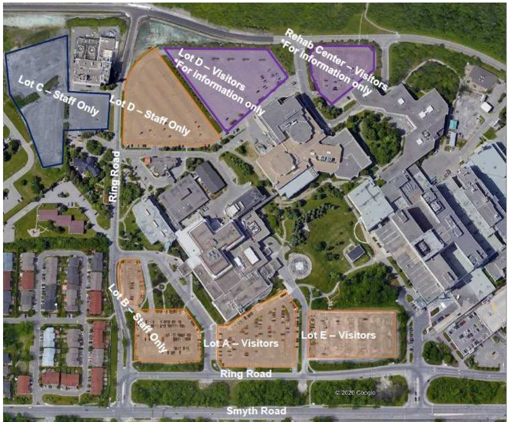
Figure 1 - Plan showing surface parking currently serving CHEO