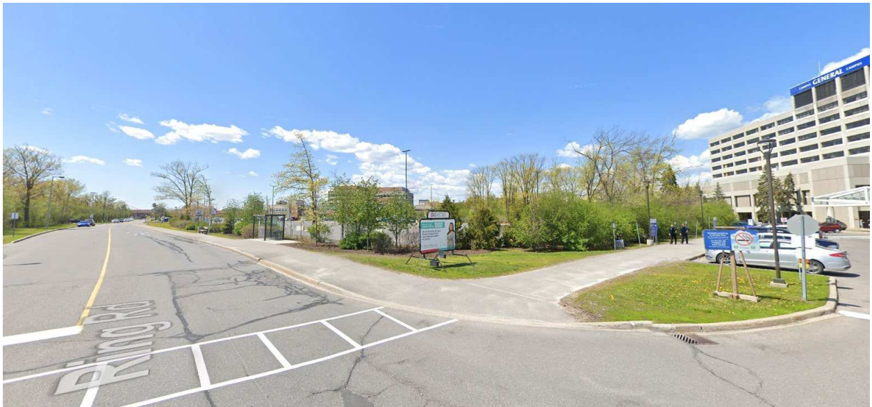
Figure 7 - Vantage point #3