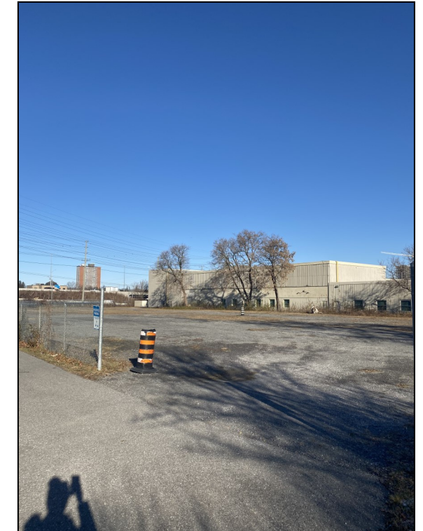
Photo 3. Trees 8 to 11. December 12, 2022.