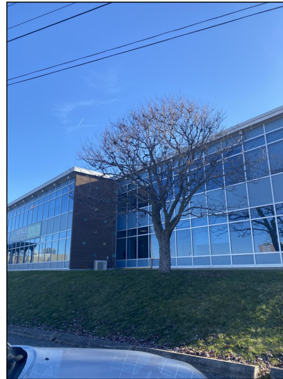
Photo 2. Tree 3. December 12, 2022.