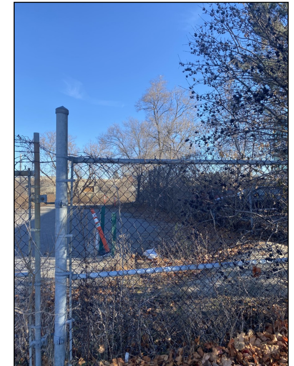
Photo 6. Trees at southeast corner of the Site. December 12, 2022.