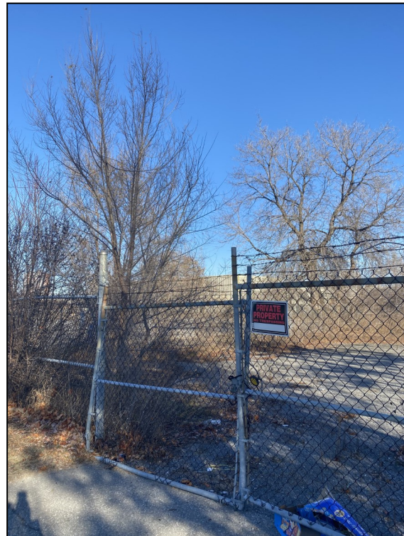
Photo 4. Trees 16 and 17. December 12, 2022.