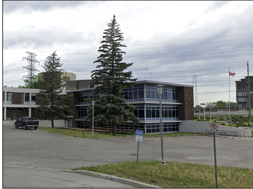
Photo 1. Trees 1 and 2. December 12, 2022.