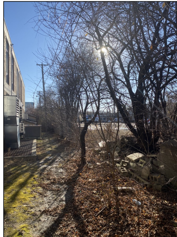
Photo 5. Trees and Common Buckthorn along western edge of Site. December 12, 2022.