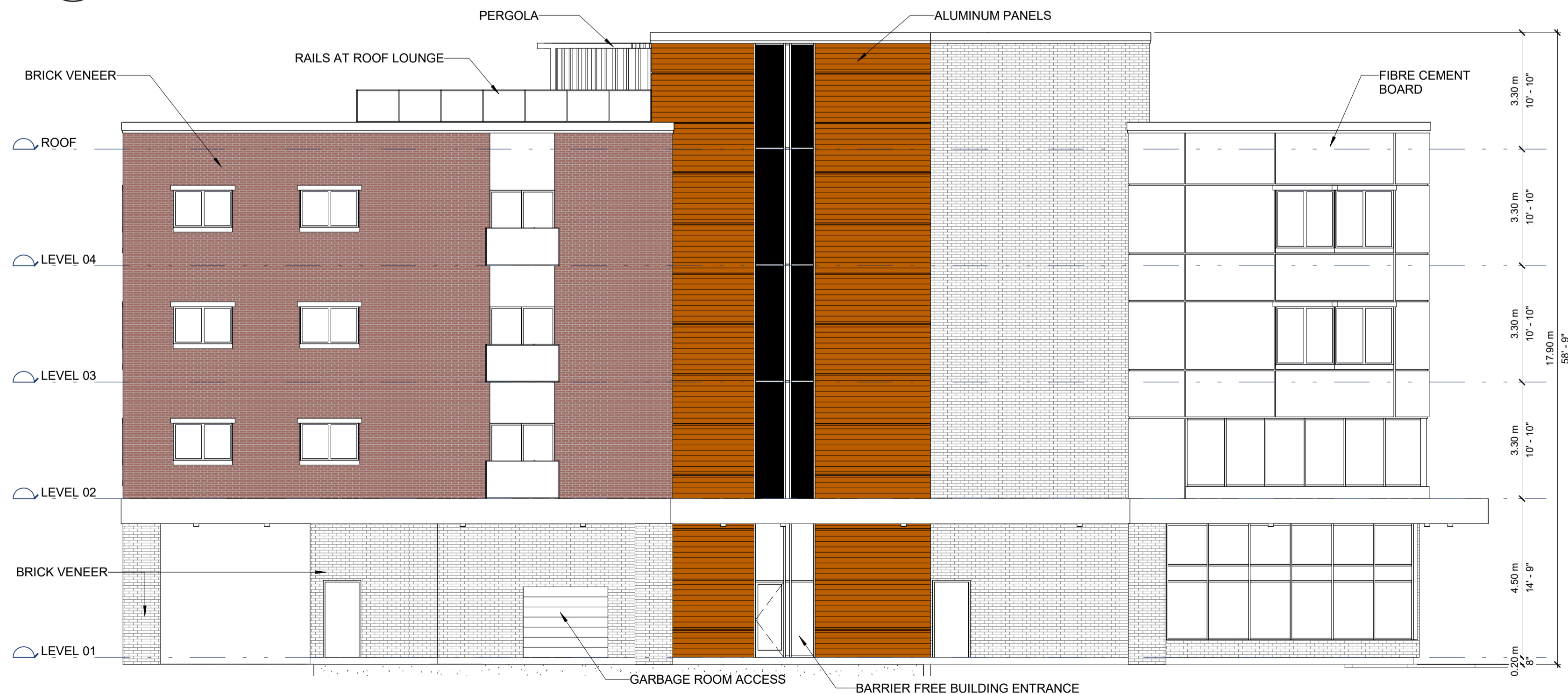
A2 BUILDING ELEVATION - WEST A401 1:100