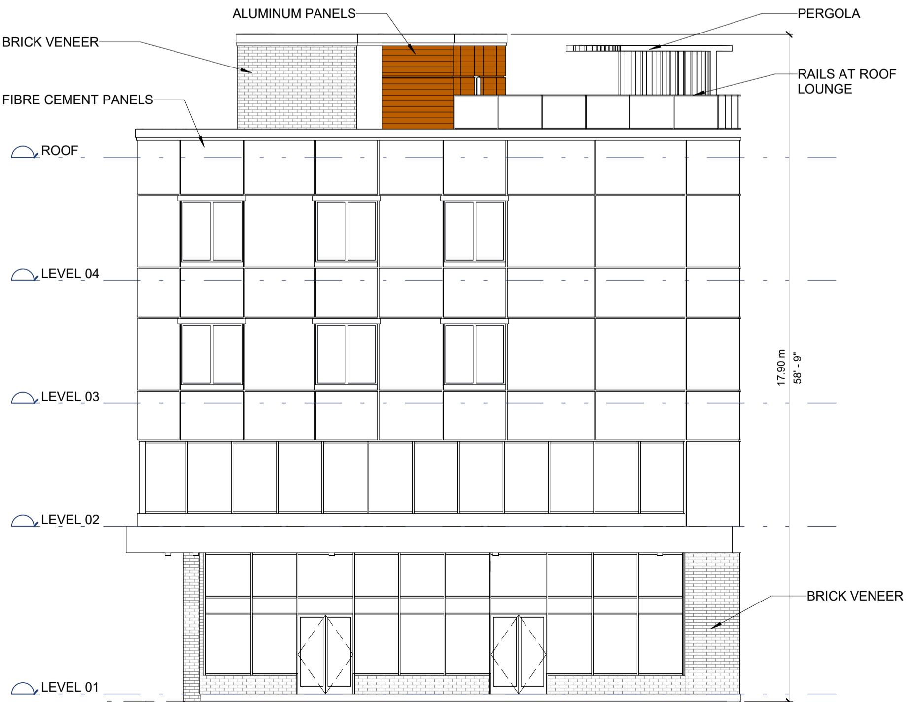
A1 BUILDING ELEVATION - SOUTH A401 1:100