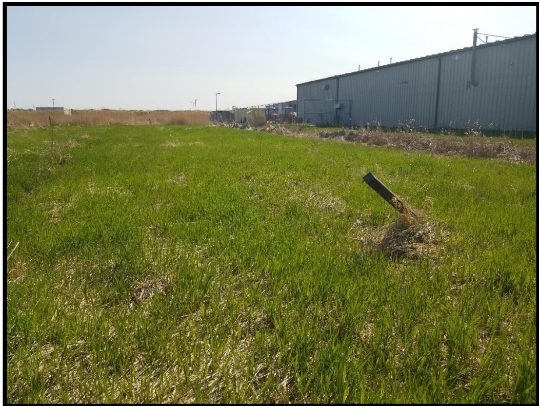
Figure 8: Dry conditions along southern border of study area (MH1153-D017).