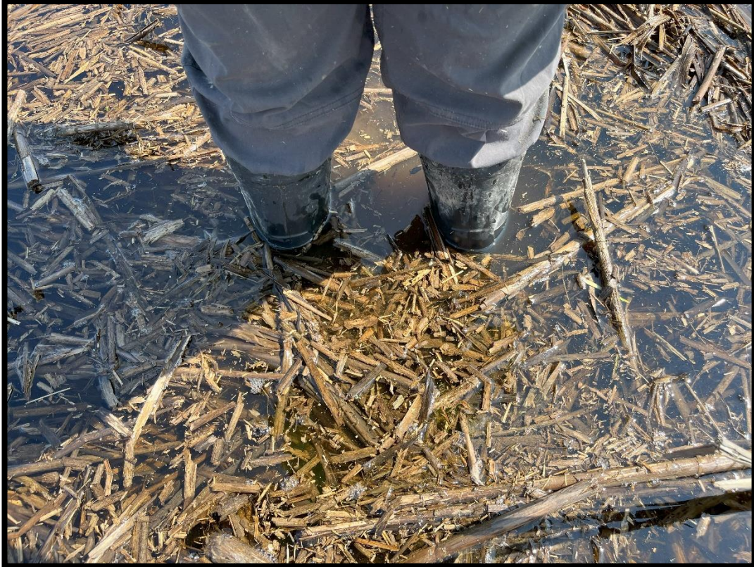
Figure 3: General wet conditions of study area (MH1153-D006).