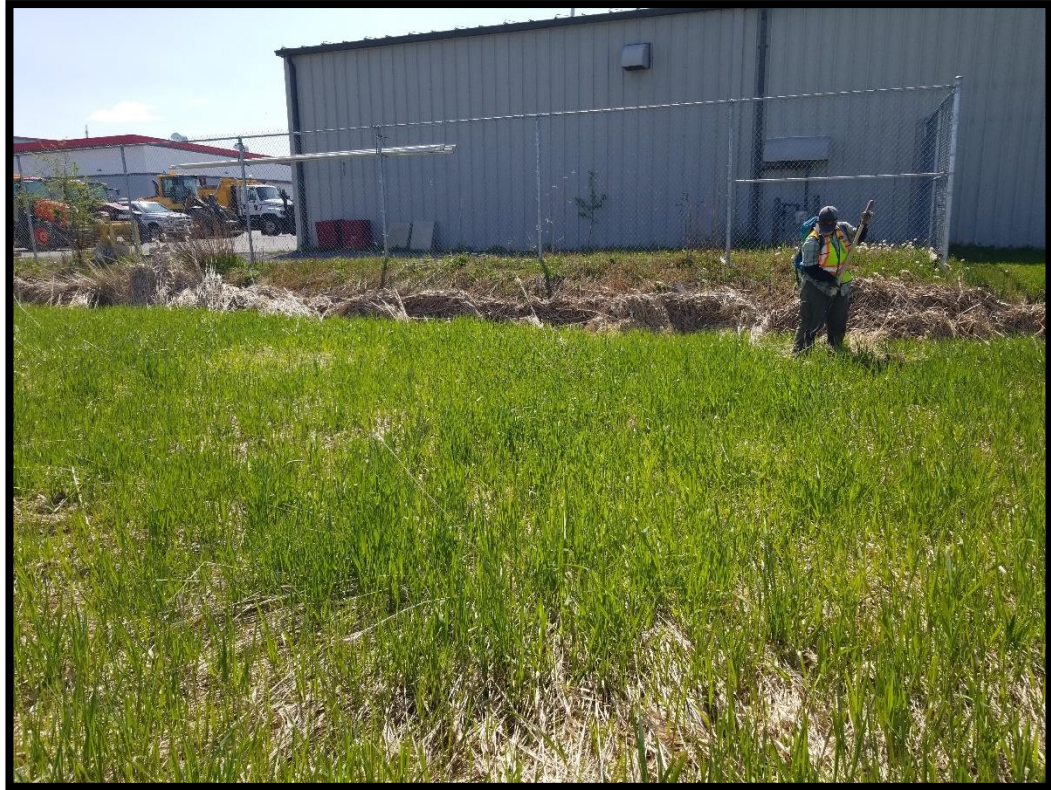
Figure 9: Test pitting in progress (MH1153-D035).