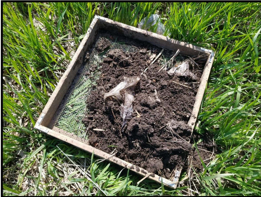
Figure 12: Disturbed soil conditions with modern garbage (MH1153-D030).