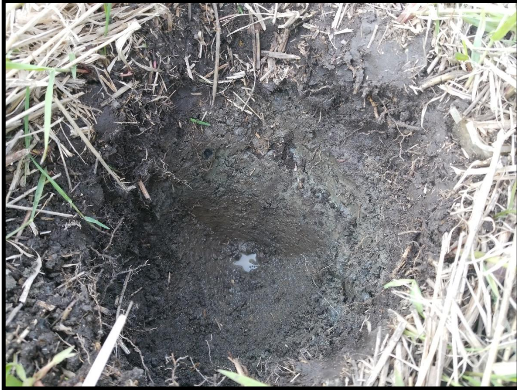
Figure 11: General soil conditions (MH1153-D028).