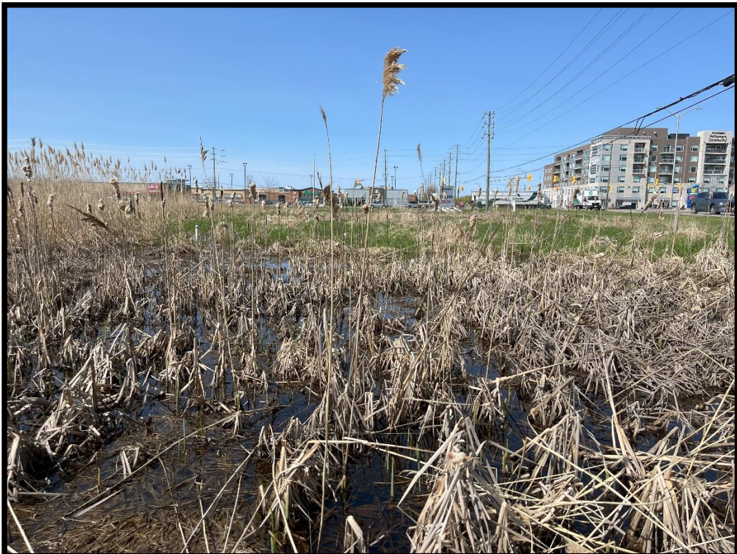
Figure 4: General wet conditions of study area with bullrushes (MH1153-D008).