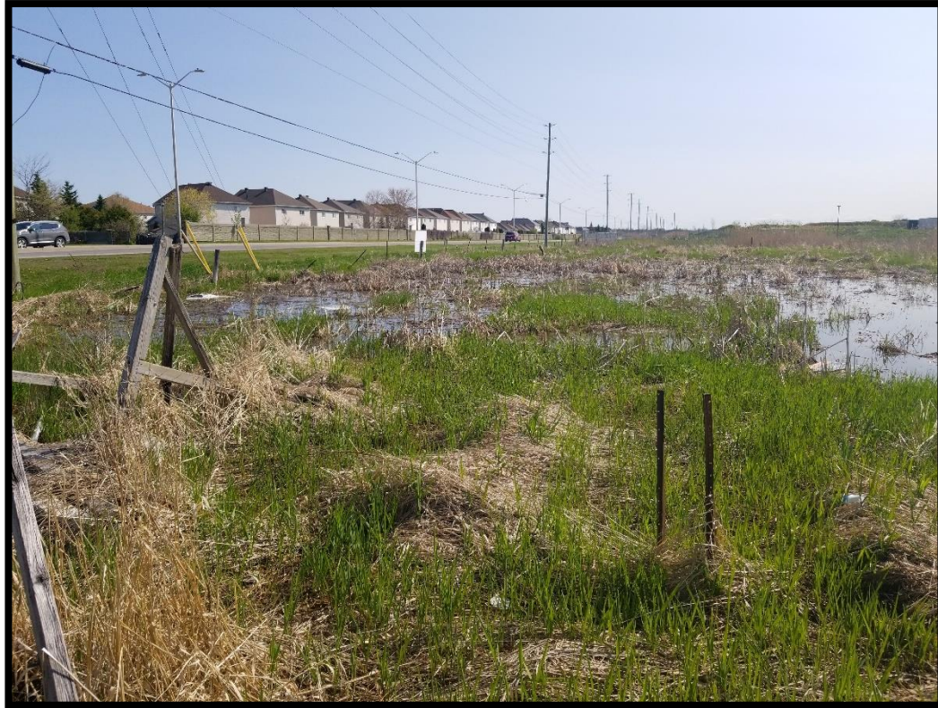
Figure 5: General wet conditions of study area (MH1153-D010).