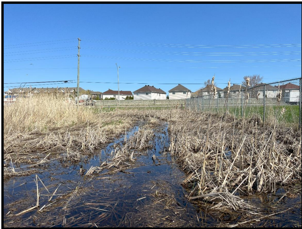
Figure 2: General wet conditions of study area with bullrushes (MH1153-D005).