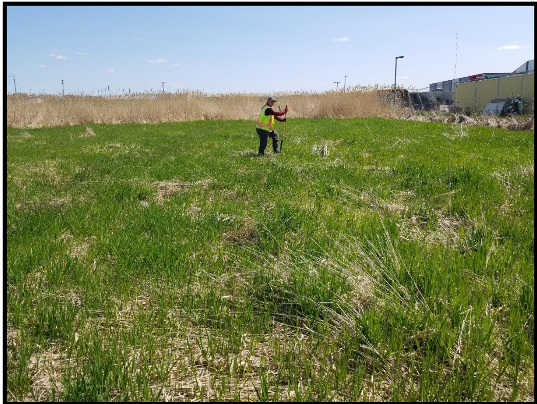
Figure 10: Test pitting in progress (MH1153-D036).