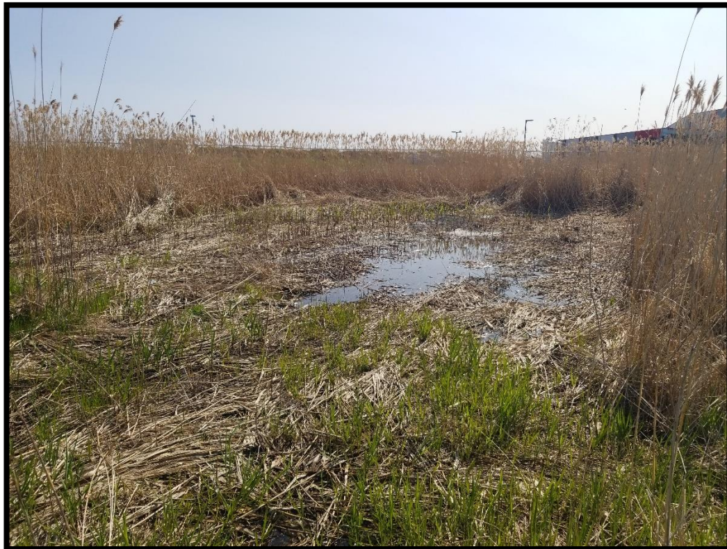
Figure 6: General wet conditions of study area (MH1153-D020).