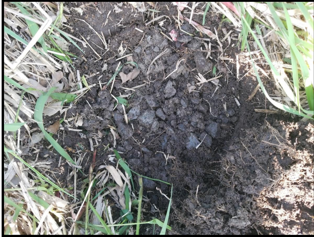
Figure 13: Disturbed soil conditions with gravel fill (MH1153-D031).