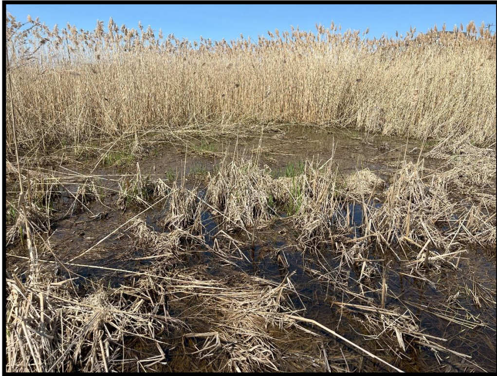
Figure 1: General wet conditions of study area (MH1153-D001).