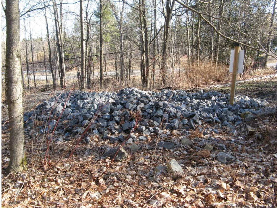
Photo 1 – Proposed location of the Islamic gazebo (north gazebo). View looking north towards Old Montreal Road