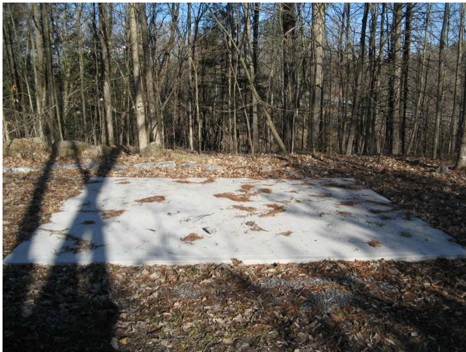
Photo 2 – Proposed location of the Canadian Charter of Rights and Freedoms gazebo (south gazebo). View looking west towards the crest of slope and Beckett's Creek tributary ravine