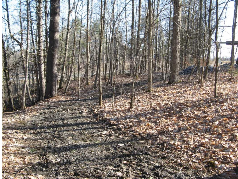
Photo 3 – Typical condition of setback between the proposed gazebo locations and the crest of slope (to left) with a permeable pathway. View looking north towards Old Montreal Road