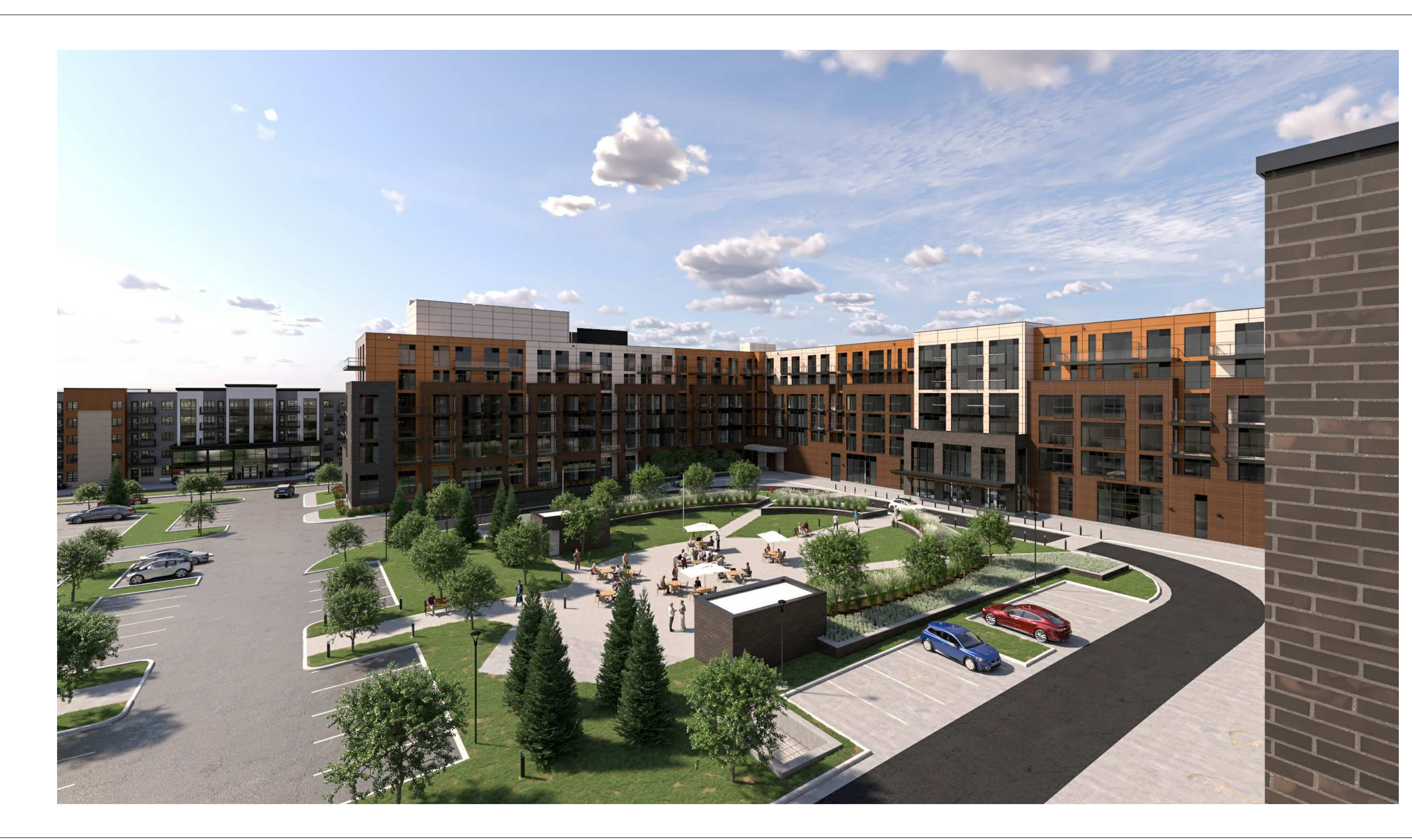
5 COURTYARD AERIAL VIEW LOOKING NORTH-EAST ASK-017 SCALE 1 : 1

NORTH PERSPECTIVE VIEW ASK-017 SCALE 1:1