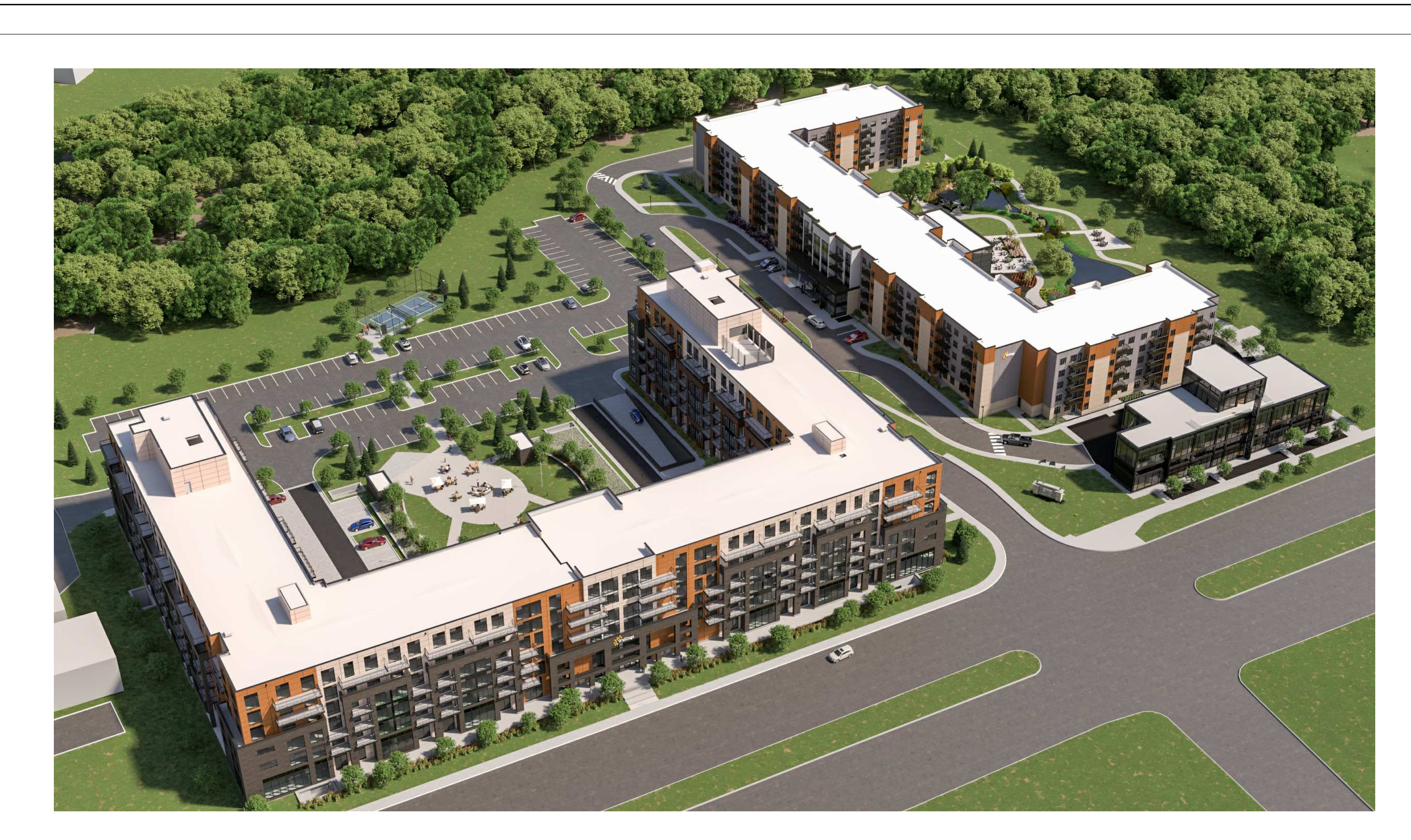
6 SOUTH-EAST AERIAL VIEW ASK-017 SCALE 1:1