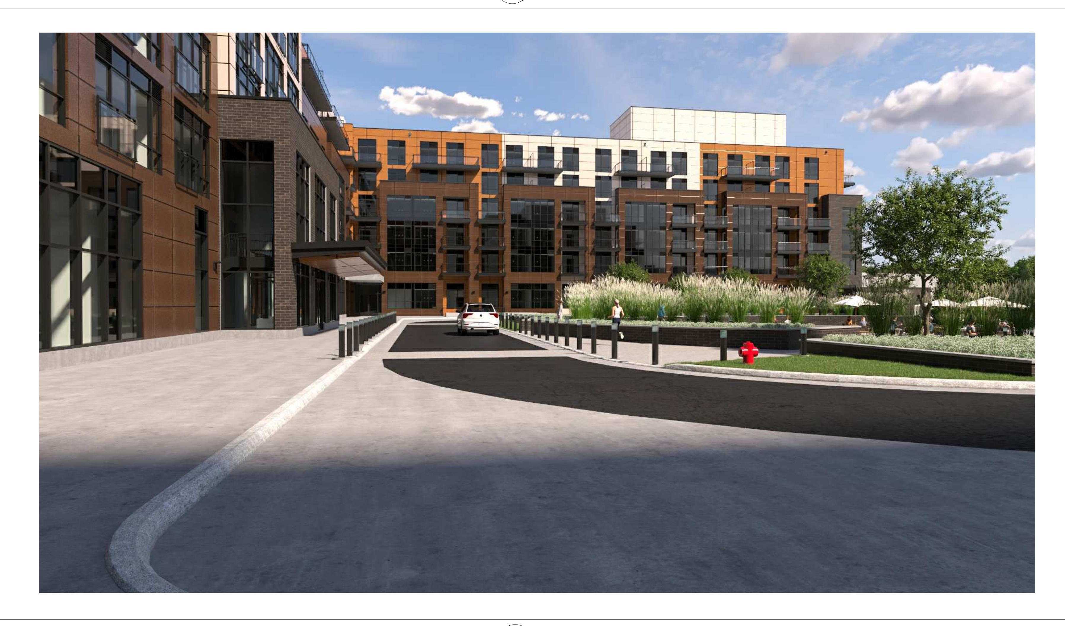
3 COURTYARD PERSPECTIVE VIEW LOOKING SOUTH