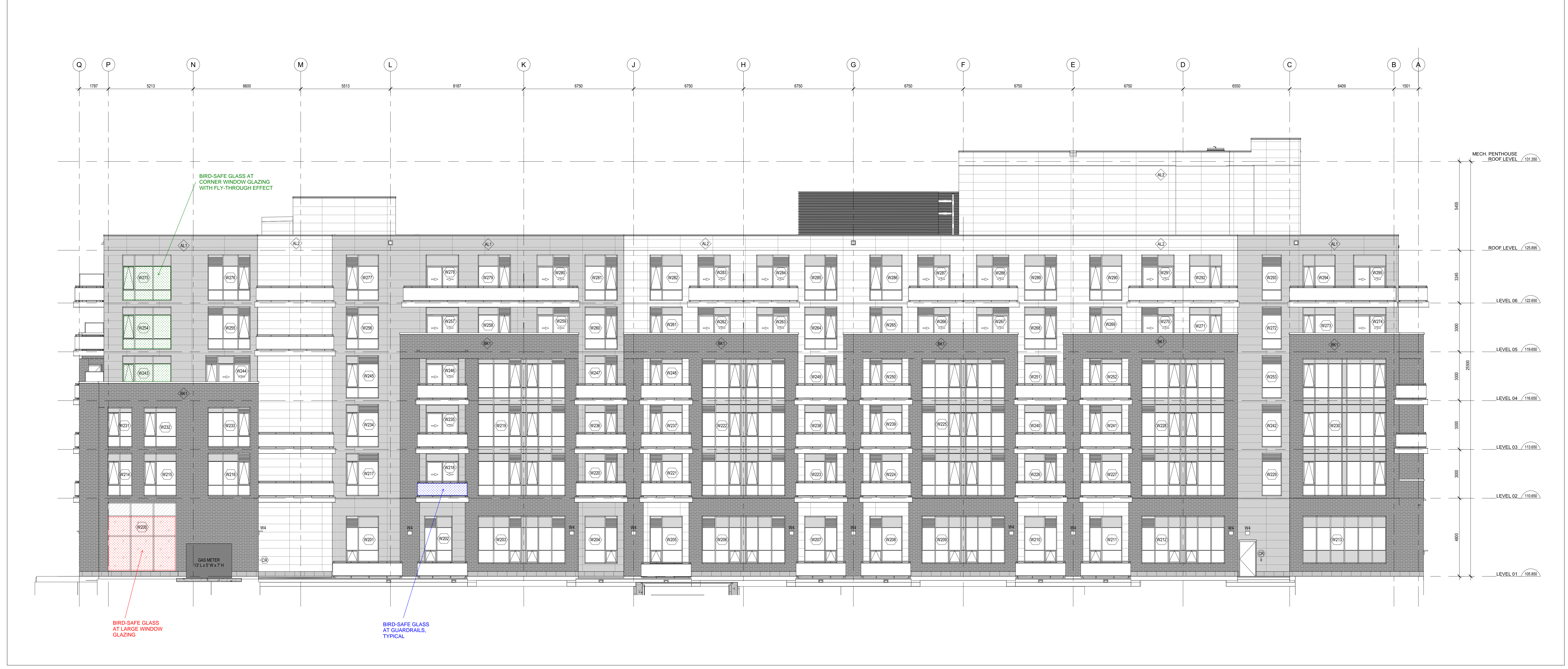
1 NORTH BUILDING ELEVATION - PHASE 2 SCALE 1 : 100

PROJECT NUMBER NOT BE USED FOR CONSTRUCTION UNLESS ISSUED BY THE ARCHITECT