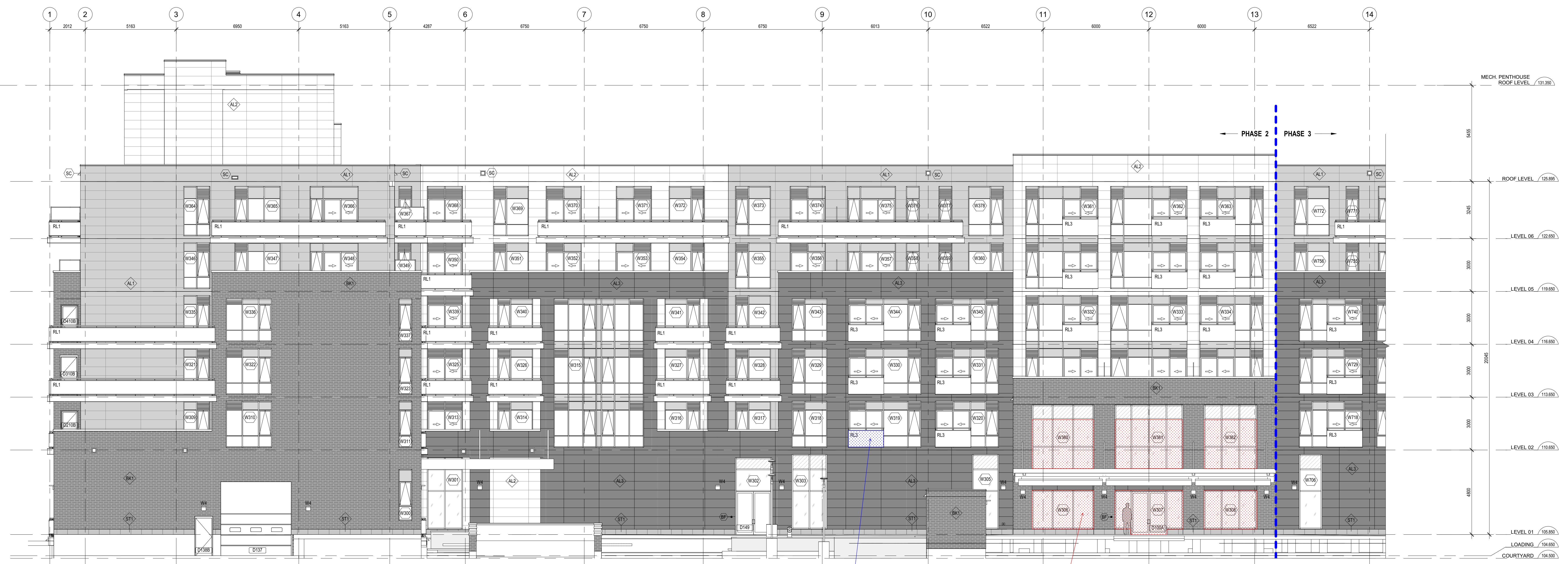
2 WEST BUILDING ELEVATION - PHASE 2 A-200A SCALE 1: 100