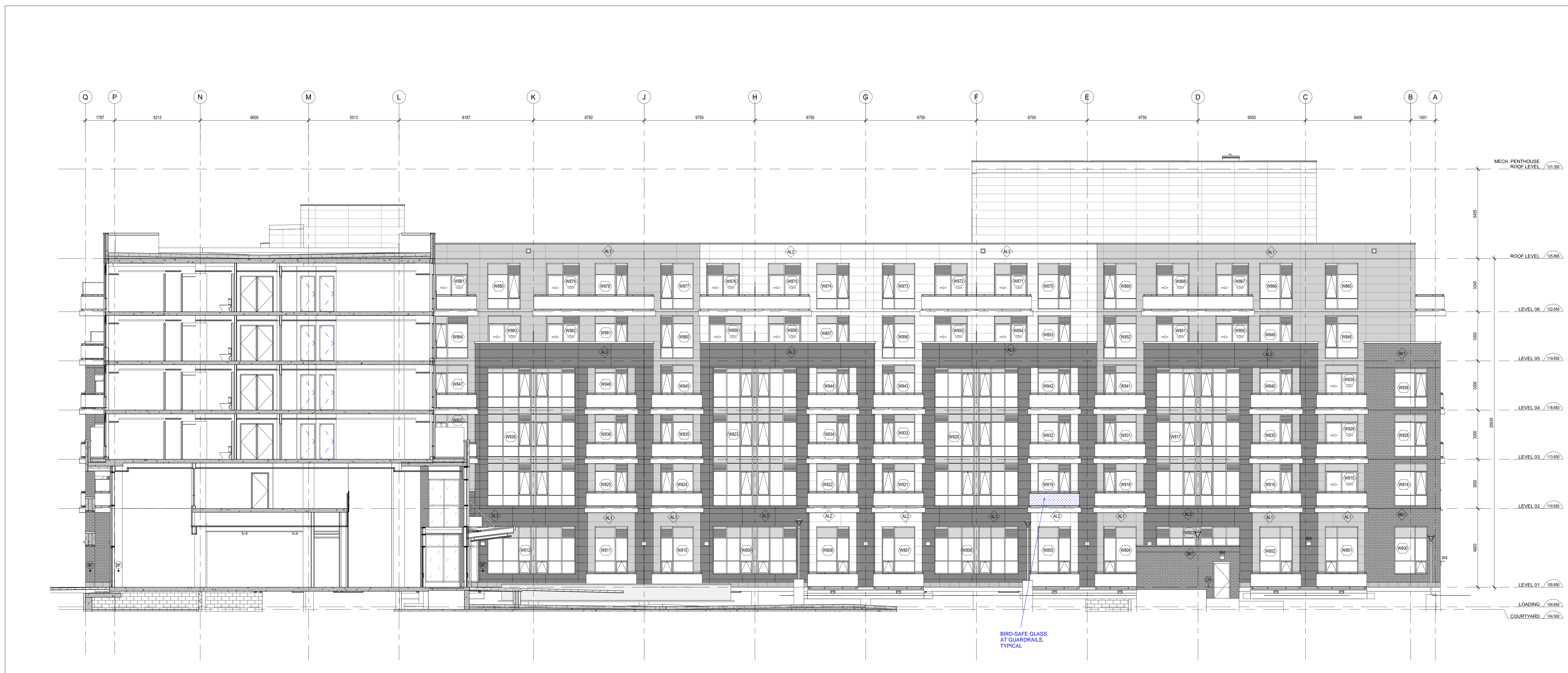
1 NORTH BUILDING SECTIONAL ELEVATION - PHASE 3 A-201B SCALE 1:100