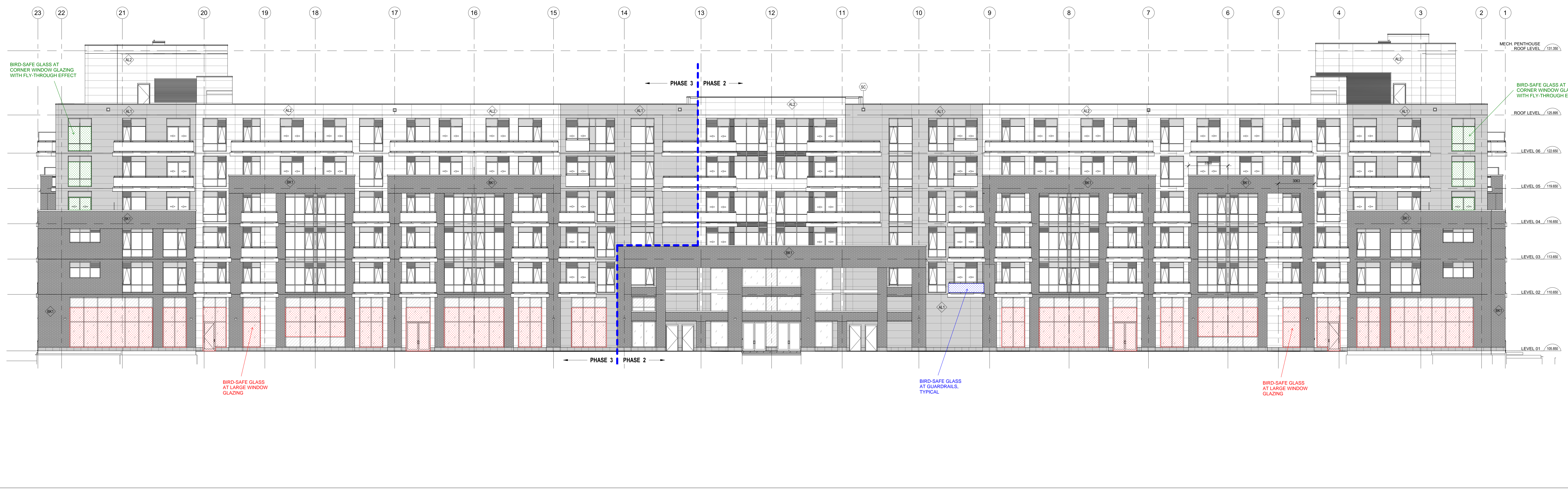
2 EAST BUILDING KEY ELEVATION A-200 SCALE: 1:125

NOTE: THIS DRAWING IS THE PROPERTY OF THE ARCHITECT AND MAY NOT BE REPRODUCED OR USED WITHOUT THE EXPRESSED CONSENT OF THE ARCHITECT. THE CONTRACTOR SHALL CHECK AND REPORT ALL DIMENSIONS AND REPORT ANY DISCREPANCIES OR DISCREPANCIES TO THE ARCHITECT BEFORE PROCEEDING WITH THE WORK. DO NOT SCALE THE DRAWINGS RELEASE / REVISION RECORD No. Description Date 1 Issued for SPC Coordination Meeting 23.08.11 2 Issued for Internal Review 23.08.12 3 Issued for H&E Tender 23.08.19 4 Issued for Re-submission to Building Permit 23.10.02 5 Issued for SPC Amendment 23.05.16 6 Issued for Coordination 23.02.10 7 Issued for Full Building Permit 23.05.16 8 Issued for Response to SPC Comments 23.05.16