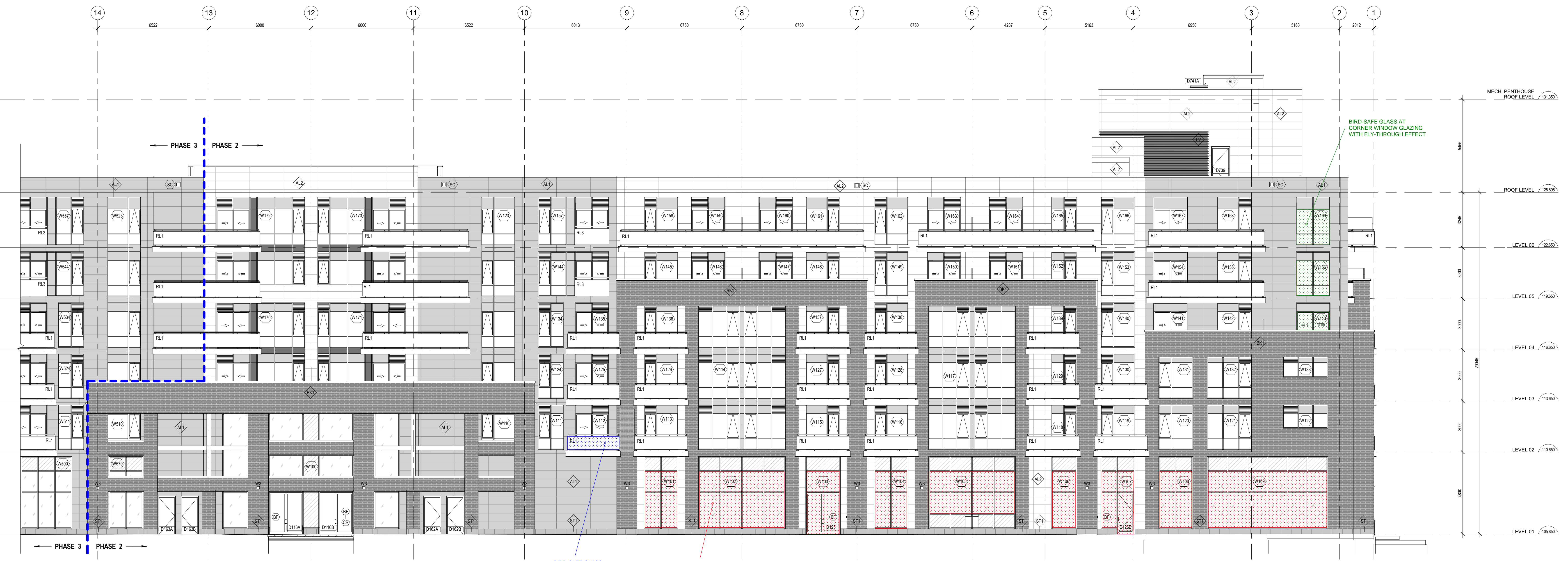
1 EAST BUILDING ELEVATION - PHASE 2 A-200A SCALE 1: 100

PROJECT NUMBER: 19-1764 DRAWN: CG SCALE: 1:100 CHECKED: ECRAC