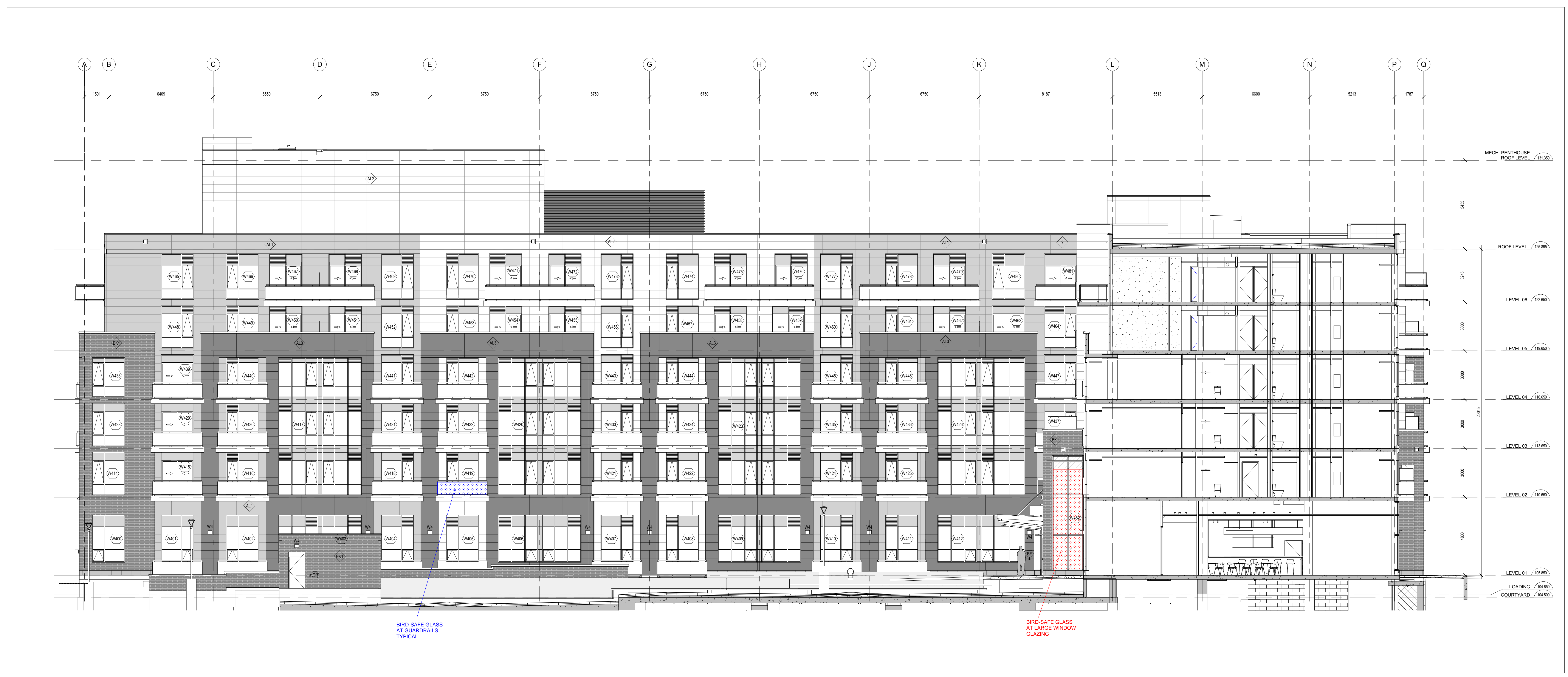
2 SOUTH BUILDING ELEVATION - PHASE 2 SCALE 1 : 100