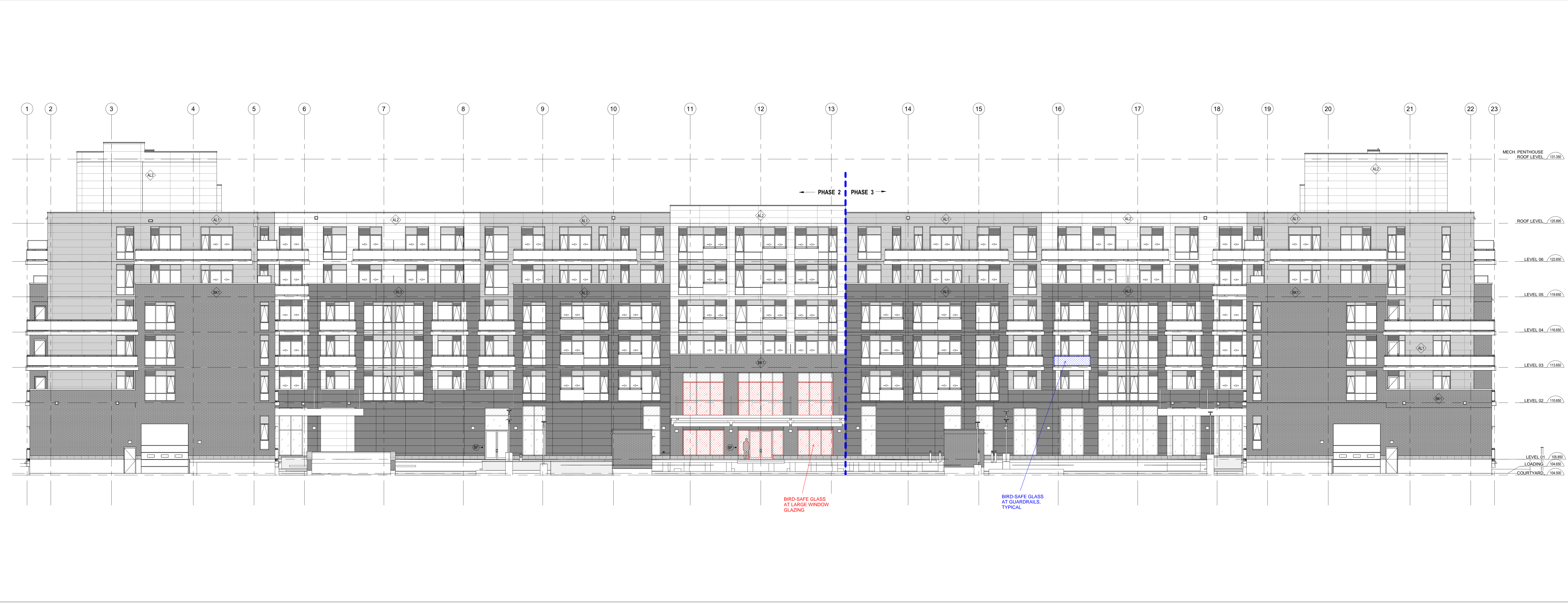
1 WEST BUILDING KEY ELEVATION A-200 SCALE: 1:125

PROJECT NUMBER NOT TO BE USED FOR CONSTRUCTION UNLESS ISSUED BY THE ARCHITECT