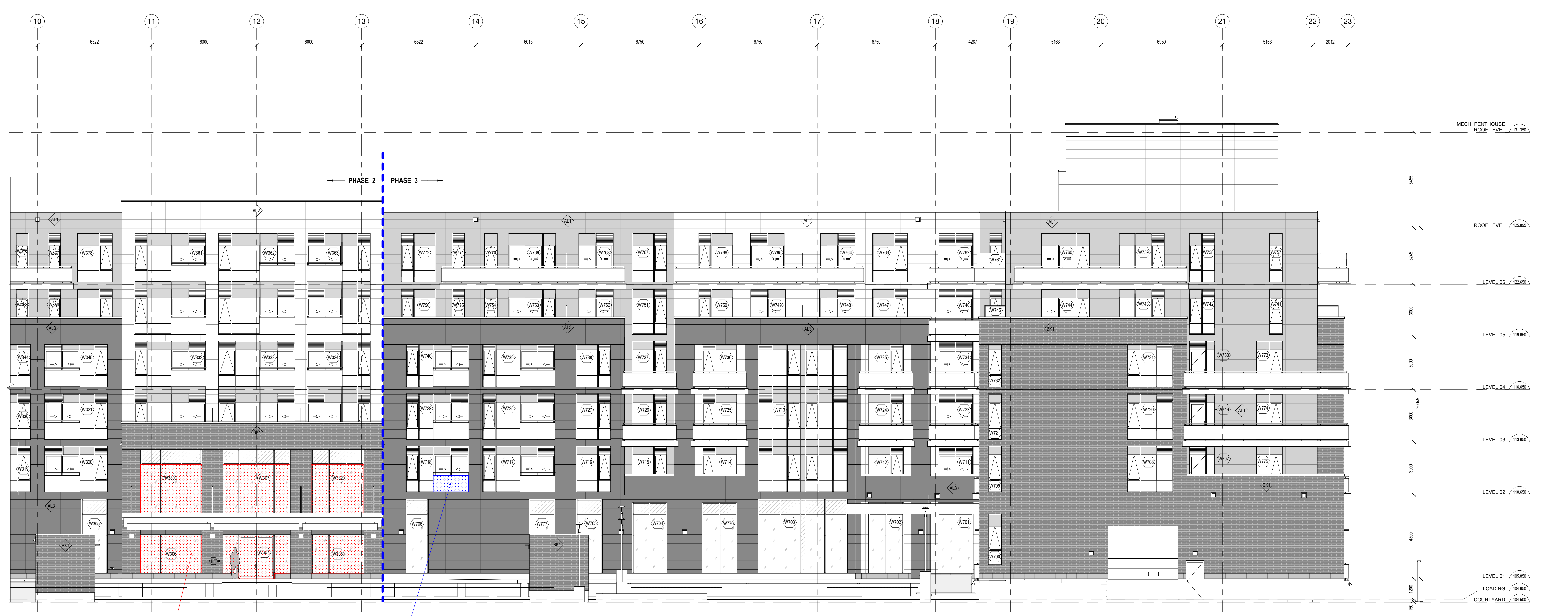
2 WEST BUILDING ELEVATION - PHASE 3 SCALE 1:100