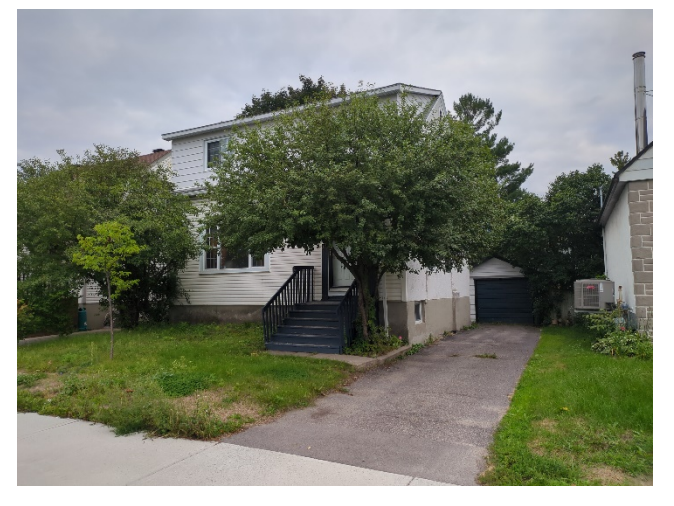
1818 Scott Street