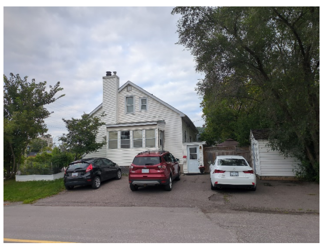
1798 Scott Street, viewed from Rockhurst Road