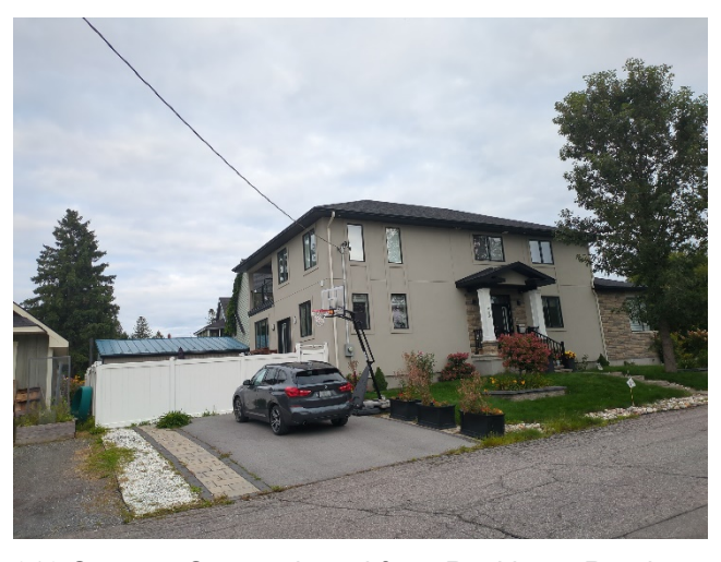
319 Spencer Street, viewed from Rockhurst Road