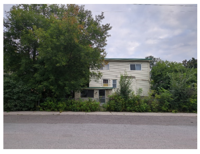
323 Rockhurst Road, viewed from Spencer Street