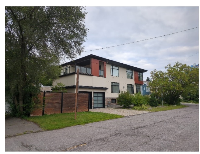
53 Gould Street, viewed from Rockhurst Road