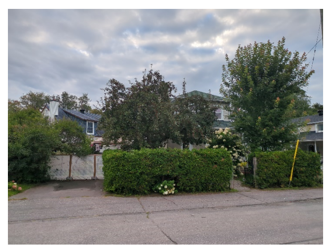
310 Rockhurst Road