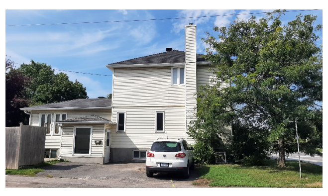
1806 Scott Street, viewed from Rockhurst Road ★