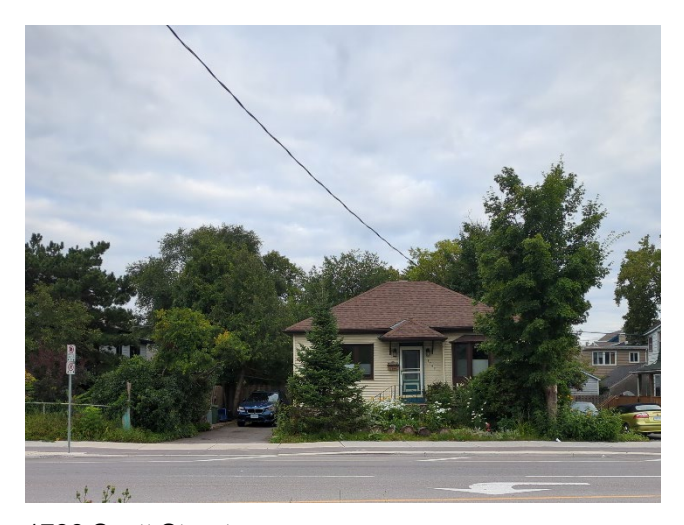
1786 Scott Street