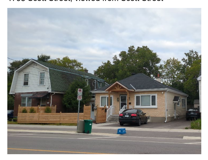
1794 Scott Street