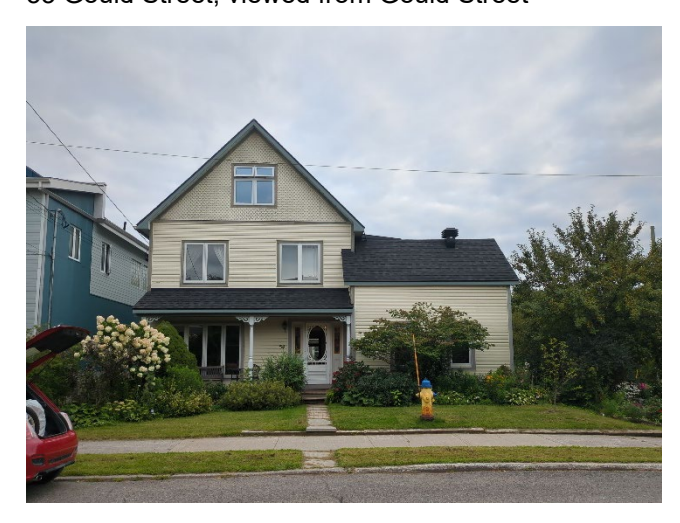
54 Gould Street, viewed from Gould Street