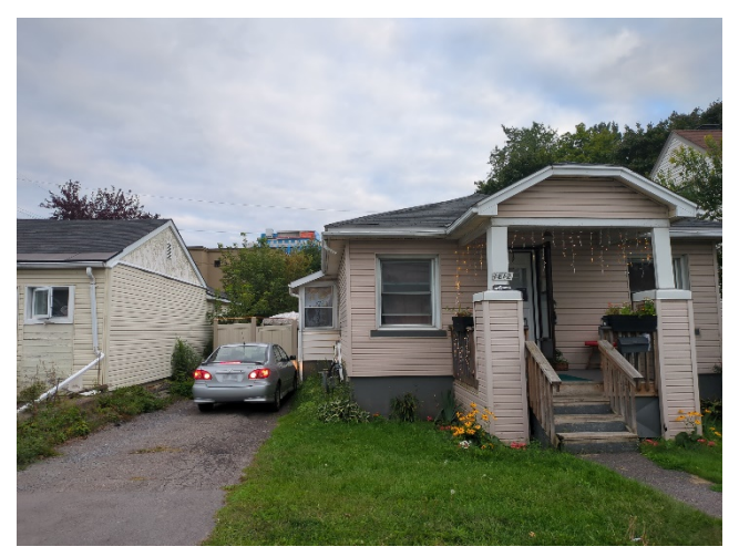
1812 Scott Street