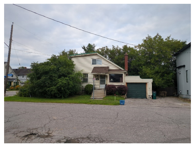
323 Rockhurst Road, viewed from Rockhurst Road