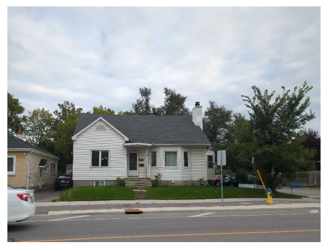
1798 Scott Street, viewed from Scott Street