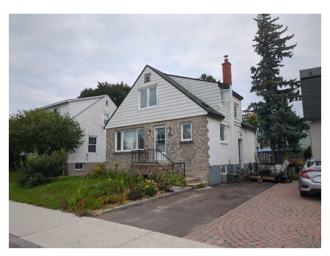
1822 Scott Street