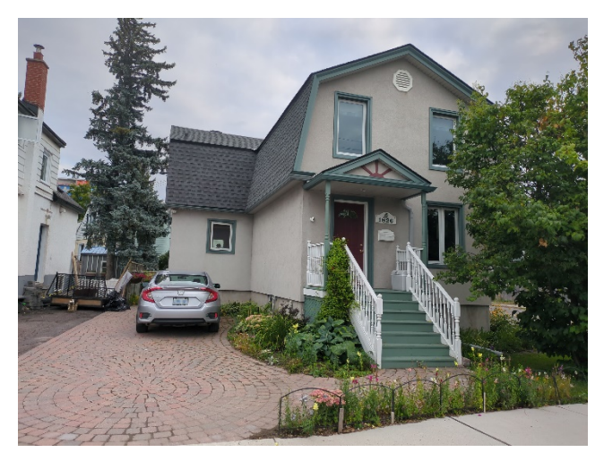
1826 Scott Street