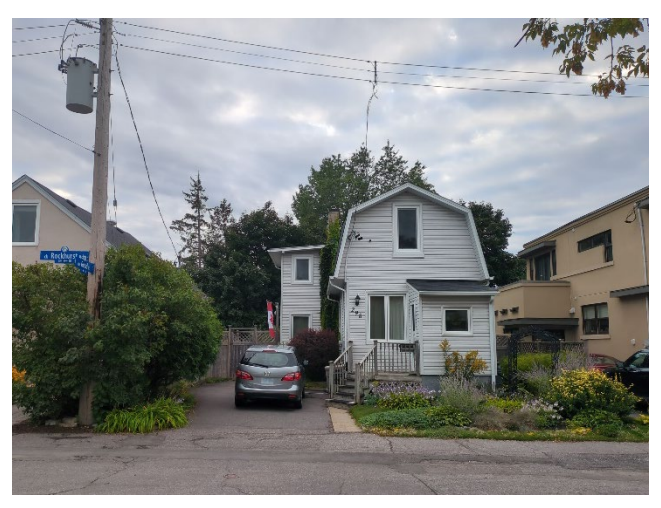
298 Rockhurst Road