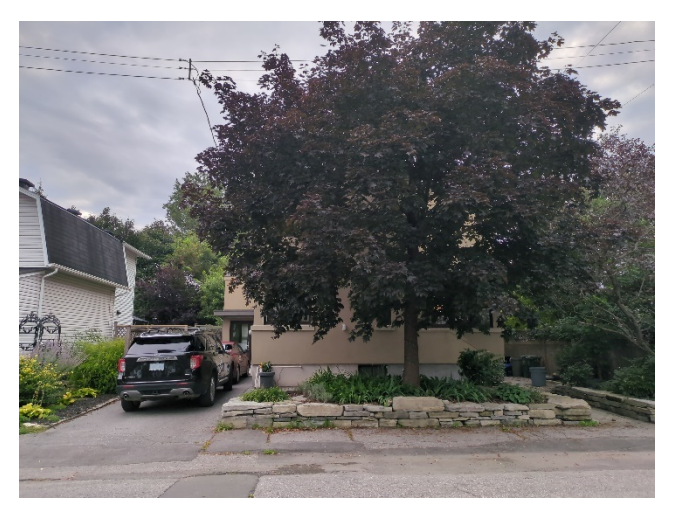
296 Rockhurst Road