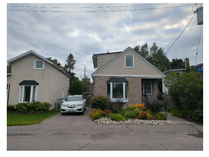
300 Rockhurst Road