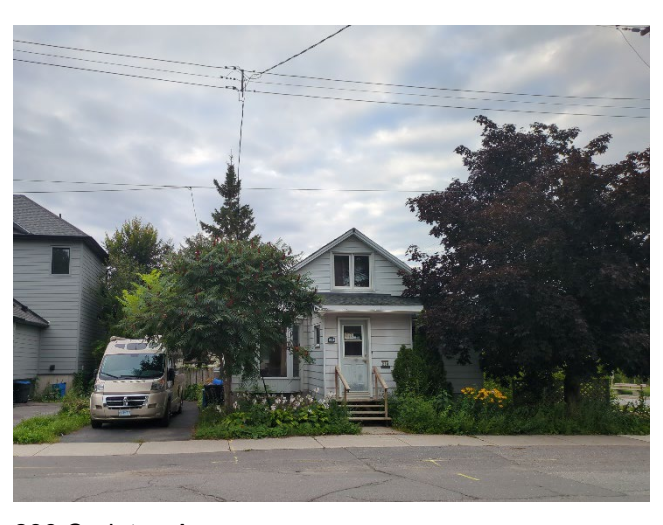
286 Carleton Avenue