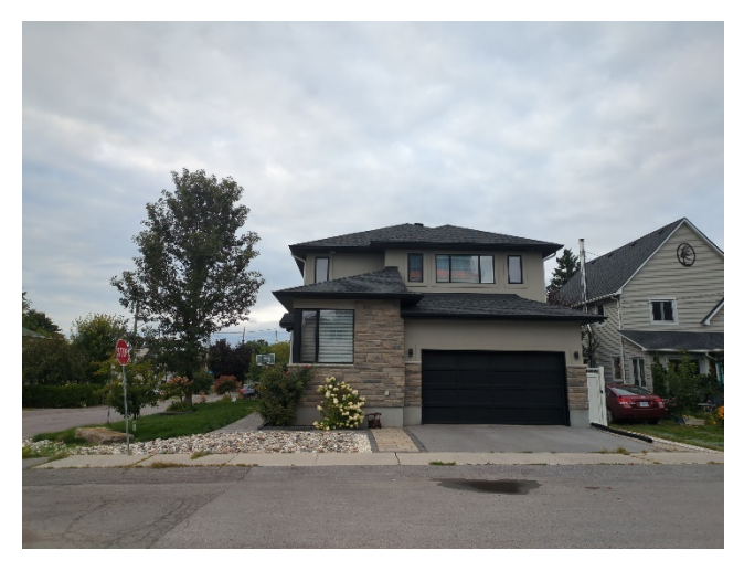
319 Spencer Street, viewed from Spencer Street