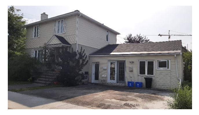
1806 Scott Street, viewed from Scott Street ★