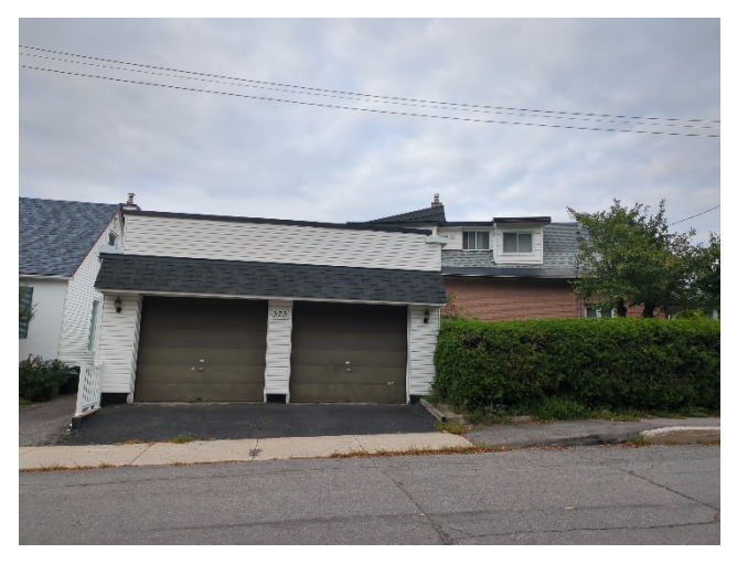
323 Oakdale Avenue, viewed from Oakdale Avenue