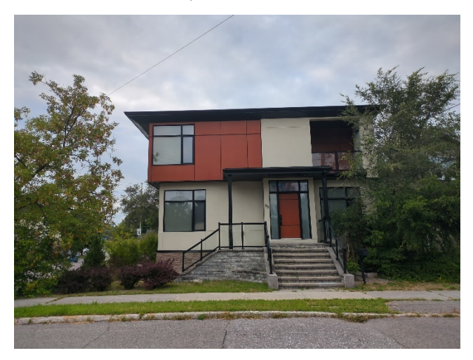
53 Gould Street, viewed from Gould Street