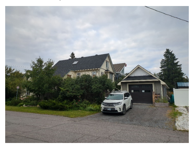
54 Gould Street, viewed from Rockhurst Road