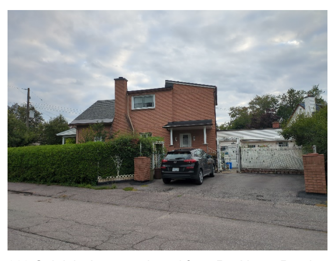
323 Oakdale Avenue, viewed from Rockhurst Road