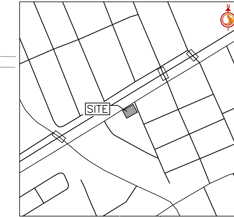
KEY PLAN N.T.S.

Stantec Consulting Ltd. 400 - 1331 Clyde Avenue Ottawa ON Tel. 613.722.4420 www.stantec.com