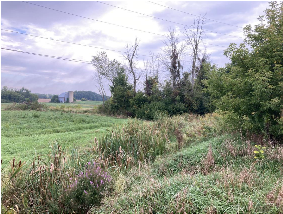
Photo 4. View of watercourse, just east of mushroom farm buildings

The redevelopment of the site will require that the catchment area and flow downstream continues post-construction. Any realignment of the watercourse would require a permit from the conservation authority. Stormwater for the Site would require consideration of maintaining flows, water quality and impacts on the receiving watercourse and downstream fish habitat.