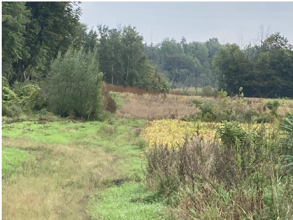
Photo 2. View of Wetland in back centre of photo and to right of photo.

The protection of the feature and a 30 m buffer is recommended. Currently the buffer area is partially farmland or woodland. Areas that may be adjacent to a future building envelope should be revegetated with native tree and shrub species.