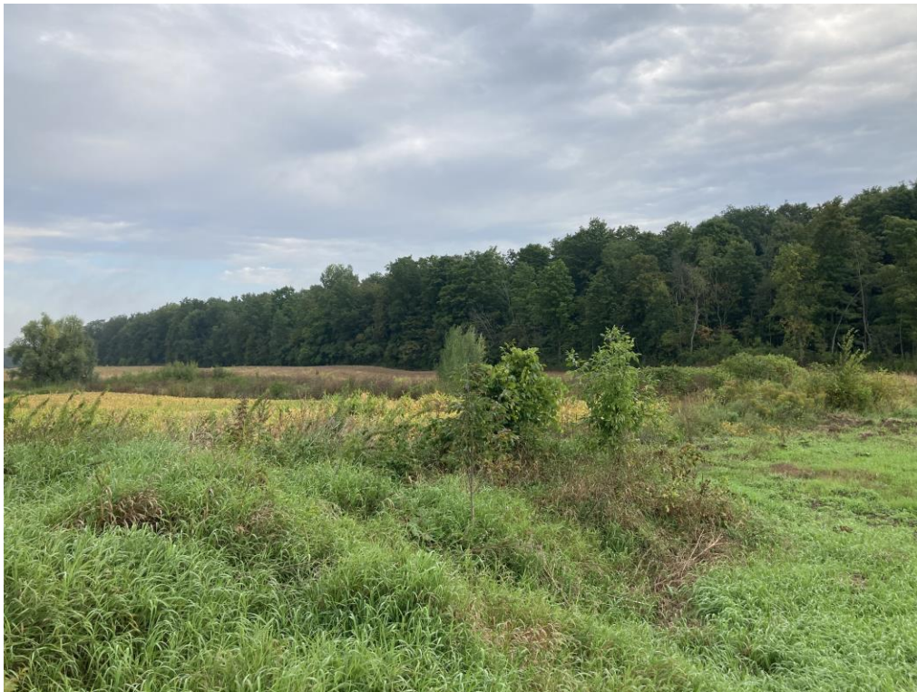
Photo 1 Agricultural field (left) and woodland in background - Sept. 13 th , 2022

On September 13 th , 2022, our terrestrial and wetland biologist visited the site to confirm the current site conditions. The site visit was used to verify the background information obtain within the literature review and confirm the presence/absence of natural features on site. The site visit documented the presence of woodland, wetland, regenerating fields and several small tributaries. Most of the property was comprised of active and abandoned buildings and storage structures with some areas in agricultural fields, which were planted in soya beans.