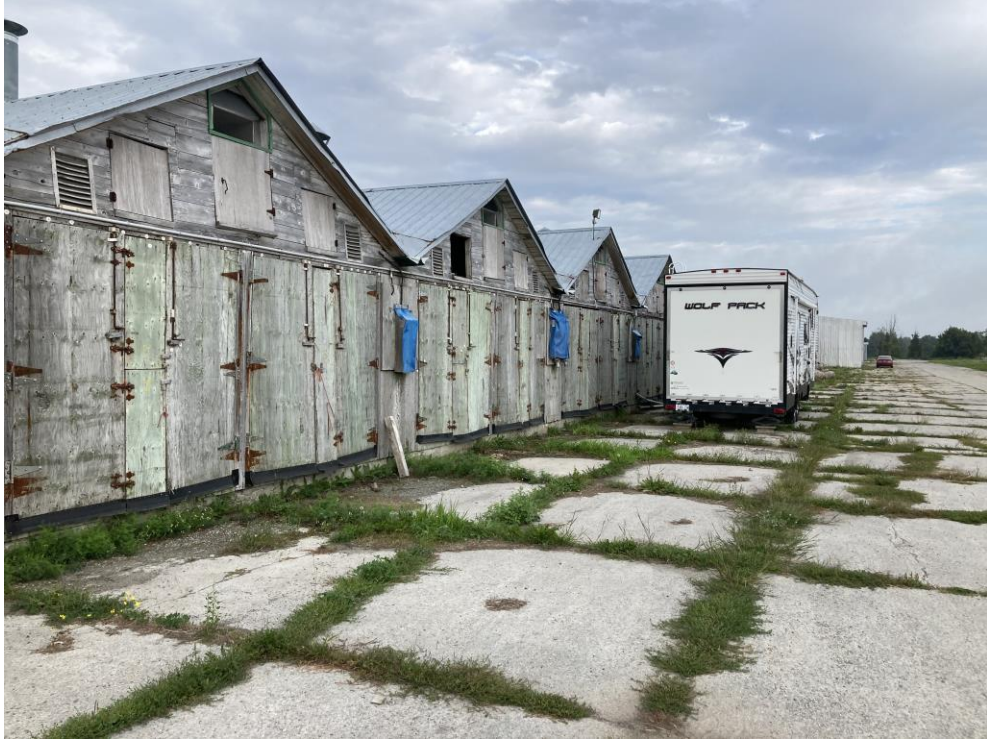
Photo 5. View of mushroom facility buildings and openings in eaves.

Eastern meadowlark prefer grasslands, hayfields, pasturelands and fallow farm fields for nesting. There are some abandoned fields on this Site that may contain suitable habitat for this species. Further surveys and assessment of habitat needed in the summer breeding season.