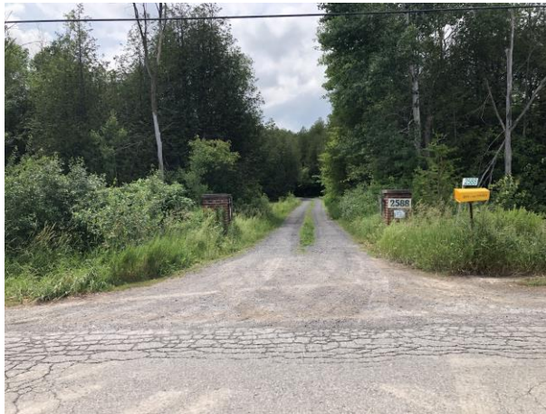
Figure 8 – View Down Residential Driveway at 2588 9 th Line Road