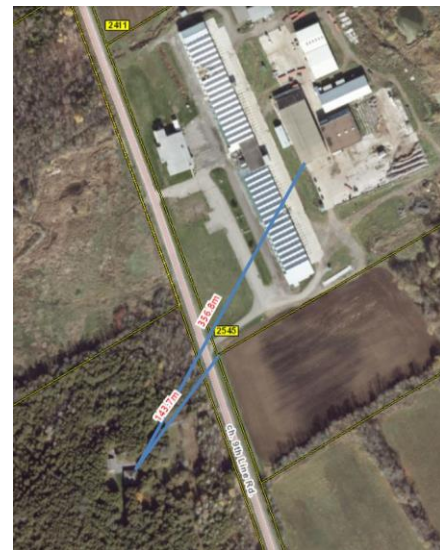
Figure 6 – General Land Use Method of Measure to #2588