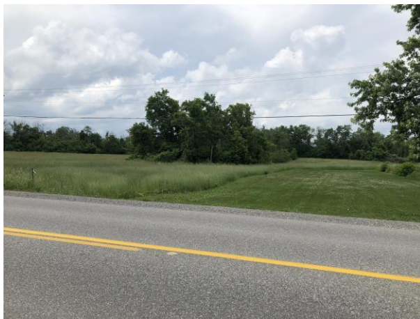
Figure 9 – View Looking North Toward Site from Closest Dwelling on Victoria Street