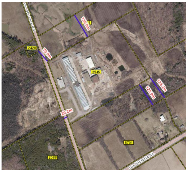
Figure 5 – Separation Distances to Nearby Sensitive Uses

One sensitive use located at 2588 9 th Line Road is within the 70-metre separation distance of the subject property. The northern tip of #2588 is directly across the road from the southern tip of the subject property at #2545. The separation distance from property line to property line is only 20 metres, the width of the road allowance. Rather than applying the site-specific method it is proposed to apply the general method of separation distance by measuring from the area of the sensitive use to the area of the industrial use. The dwelling at #2588 falls 145 metres from the subject property and roughly 381 metres from where the Phase I activity will occur (See Figure 6). The property at #2588 9 th Line is heavily treed providing buffering from the industrial use (See Figures 7 & 8). The house at 2588 9 th Line was present at the time of the previous composting activities on-site. The facility is buffered by existing vegetation and not visible from the closest residential dwelling on Victoria Street (See Figure 9).