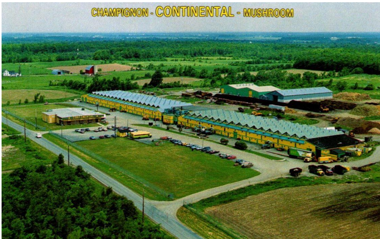
Figure 3 – Historic View of Continental Mushroom Use with Open Composting Activity Prior to the Establishment of the Storage Bunkers

For the initial phases of site plan, composted materials will be purchased and shipped to the property for soil mixing. Phase III of the Site Plan seeks to establish composting activities on the property to supplant the need to purchase composted material. Continental Mushroom installed composting infrastructure on-site to supply the growing medium needed for their business. Underground piping provides aeration and drainage. Proposed composting will be significantly different than Continental Mushroom's processes. Compost will be limited to leaf and yard waste only. No organic materials like old food, egg shells, coffee grounds, etc. will be included in the compost. It is understood that Continental Mushroom typically used old rotting material like hay, organic waste and even animal waste to develop the compost used for growing mushrooms. The odours produced from the organic composting are significantly stronger than leaf and yard waste compost. The scale of composting activity will be reduced compared to Continental Mushroom's processes as seen in Figure 3 which used to be mainly outdoors. In Figure 4 the storage bunkers on-site have been constructed and are starting to be used. Rows of compost are visible in the building. Of note, the roof of the closest sensitive receptor at 2588 9 th Line Road is visible in the bottom right corner of Figure 4 demonstrating the use was in place at the time of the original composting activity.