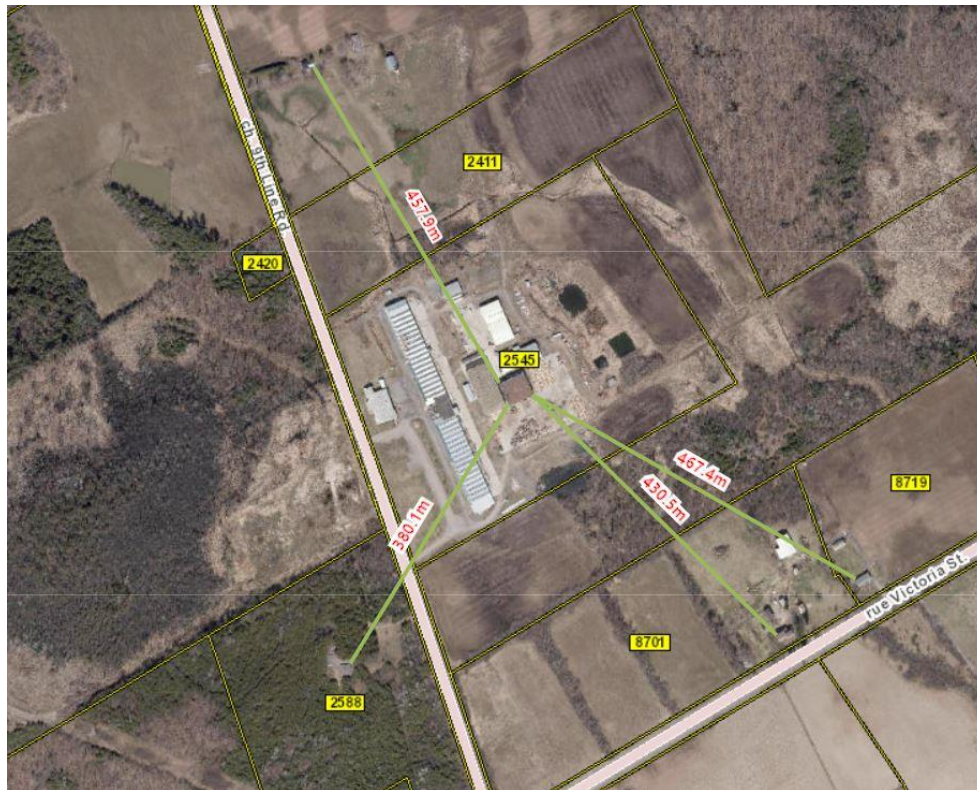
Figure 10 – Separation Distances between Composting Area and Nearest Sensitive Residential Receptors