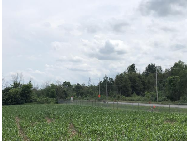
Figure 7 – View Looking Toward 2588 9 th Line Road from Subject Property