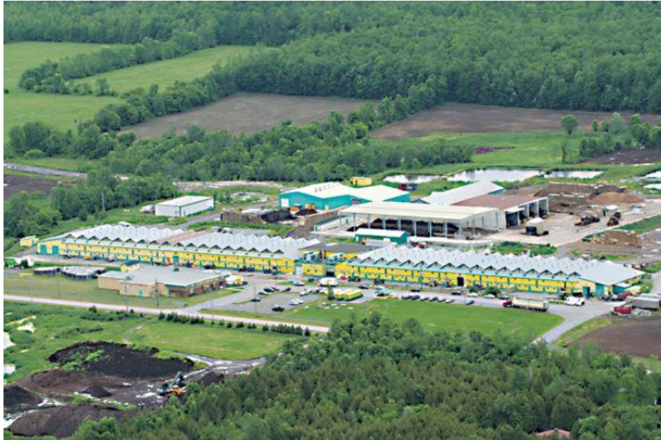
Figure 4 – Historic Aerial of Continental Mushroom with Composting Activity Inside the Storage Bunker

ASB Greenworld is anticipating that if the transition is made to include composting on-site, 5000 cubic metres of compost would be required per year to meet the composting component of the soil mix. If that were considered cumulatively, 5000 cubic metres would result in a pile of compost 33.3 metres wide by 30 metres long with a height of 5 metres. The cast concrete building labeled in Figure 2 for composting use measures roughly 34 metres wide by 30 metres deep and is over 5 metres in height. Its size would be large enough to house the anticipated compost volume needed if all stored at one time. However, it is unlikely one single pile of compost would be managed but rather several smaller piles at varying stages of decay to provide material throughout the year. The cast concrete building is separated into 4 bays as seen in Figure 4 (and as seen in Figure 11 later in this report) providing the separation needed to manage compost piles for year-round supply.