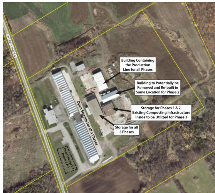
Figure 1 – Outlining the Phasing On-Site

An existing office building near the road will remain. The office building on-site may be used in Phase 1 for some of the daily operations. It is anticipated Phase 1 will require anywhere from 5 – 9 employees to achieve the needed production. Existing paved areas that provided parking for the previous use are sufficient to provide parking for employees. A servicing brief will provide the necessary information to show on-site private services can accommodate the development and employees proposed as part of Phase 1. All Phase 1 activity will occur within existing buildings without the need for any site alteration, new construction or changes to the size or location of buildings (See Figure 2).