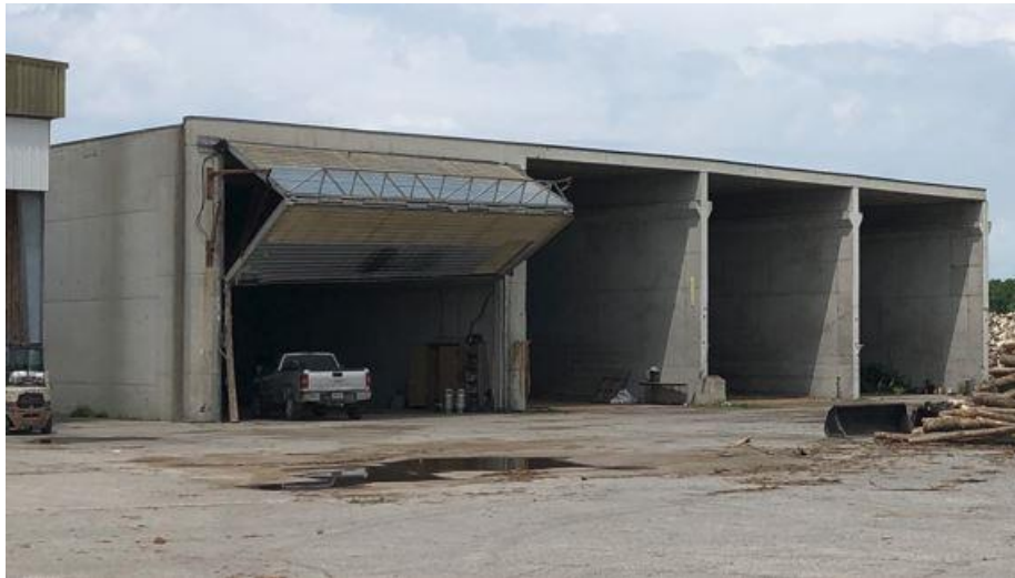
Figure 11 – Concrete Storage Bunker On-Site

sources result from processing activities that result in emissions from vessels and aeration systems, or active composting piles if not enclosed (Ward & Weins, 2018). The compost piles would be enclosed within the concrete storage bunker on the property. The bunker has an open side at the southern end but one bay does have a door which can extend down to enclose the compost (See Figure 11) making it possible to retrofit doors on each bay.