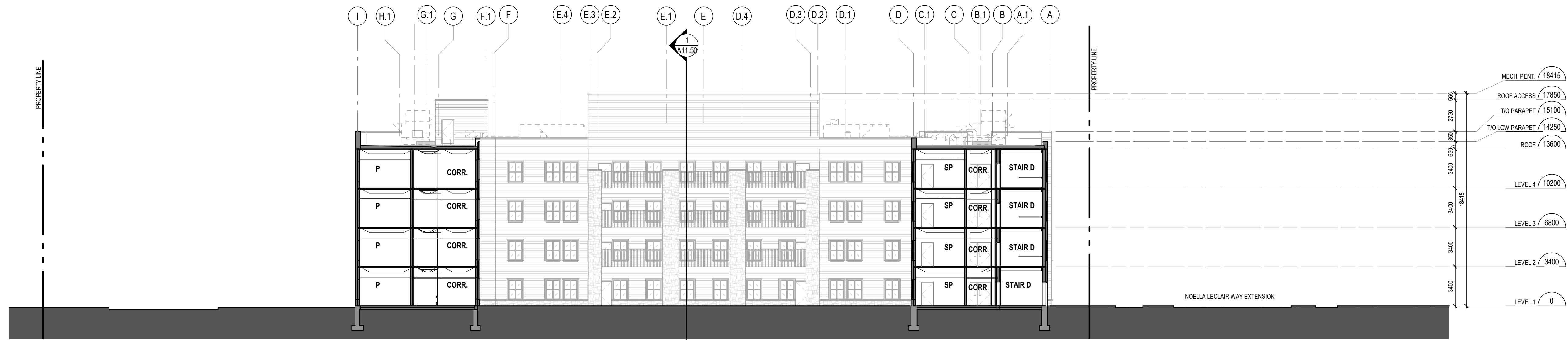
2 BUILDING SECTION NORTH/SOUTH COURTYARD (SPA) A11.50 1:200