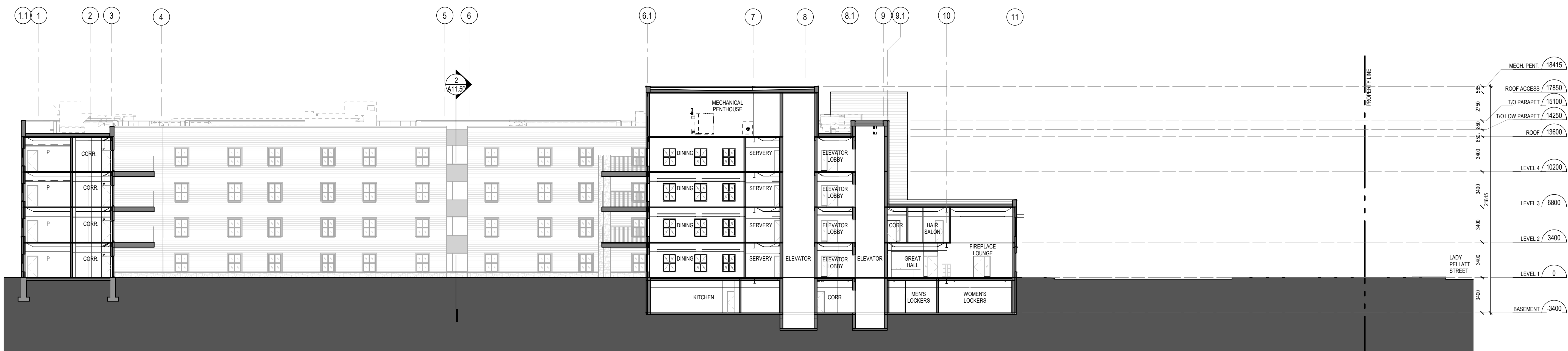
1 BUILDING SECTION EAST/WEST (SPA) A11.50 1:200

2 02.17.23 ISSUED FOR SITE PLAN APPROVAL MSA # date: revision: by: revisions