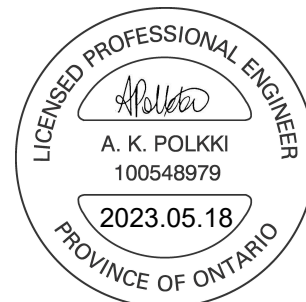
Structural Engineer's Seal

Practitioner's Name: Alaina Polkki Firm: RJC Engineers Phone#: 613-714-7000 City: Ottawa Province: Ontario