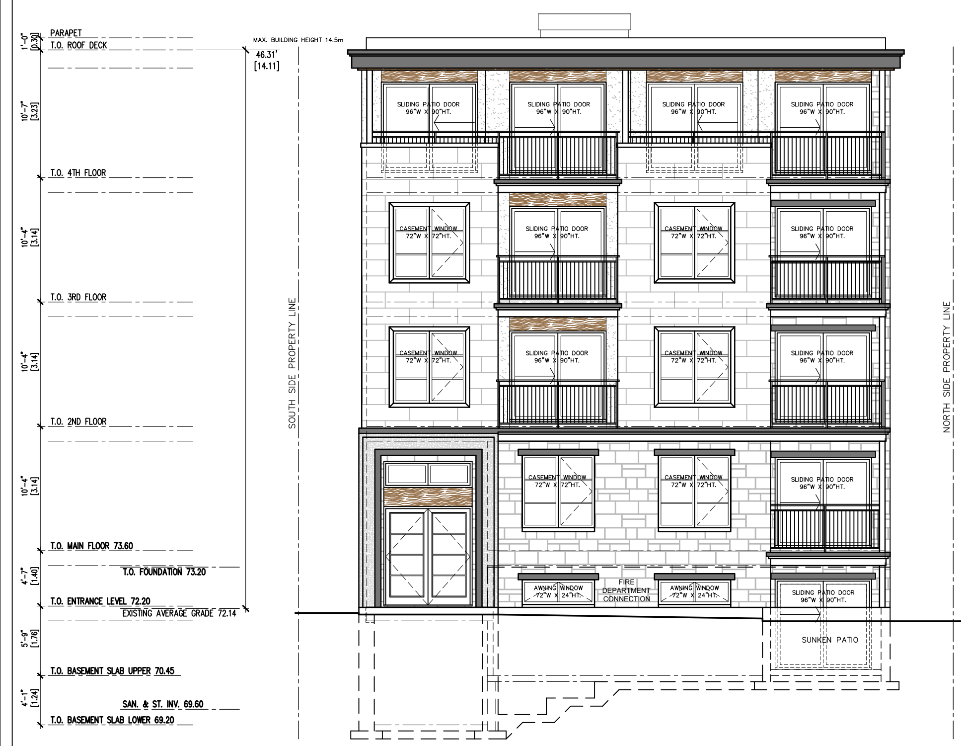
FRONT ELEVATION (EAST) SCALE: 1/8" = 1'-0"

FACADE AREA CALCULATIONS: SEC. 141 (10) 10. The front facade must comprise at least 20 percent of the AREA OF FRONT FACADE = 185.3m 2 (1999.39 sq ft) AREA OF WINDOW = 51.6m 2 (7716sq ft) 71.4 / 185.3 = 38.52% *The front facade comprises at least 38.52% windows. 11. At least 20 percent of the area of the front facade must be recessed an additional 0.6 metres from the front setback line. AREA OF FRONT FACADE = 185.3m 2 (1999.39 sq ft) 1.06 (60%) MIN. LONG RECESSED AREA OF FRONT FACADE = 92.89m 2 (999.9 sq ft) 52.3 / 185.3 = 28.22% *At least 28.22% of the area of the front facade is recessed by at least 1.5 metres from the front setback line.