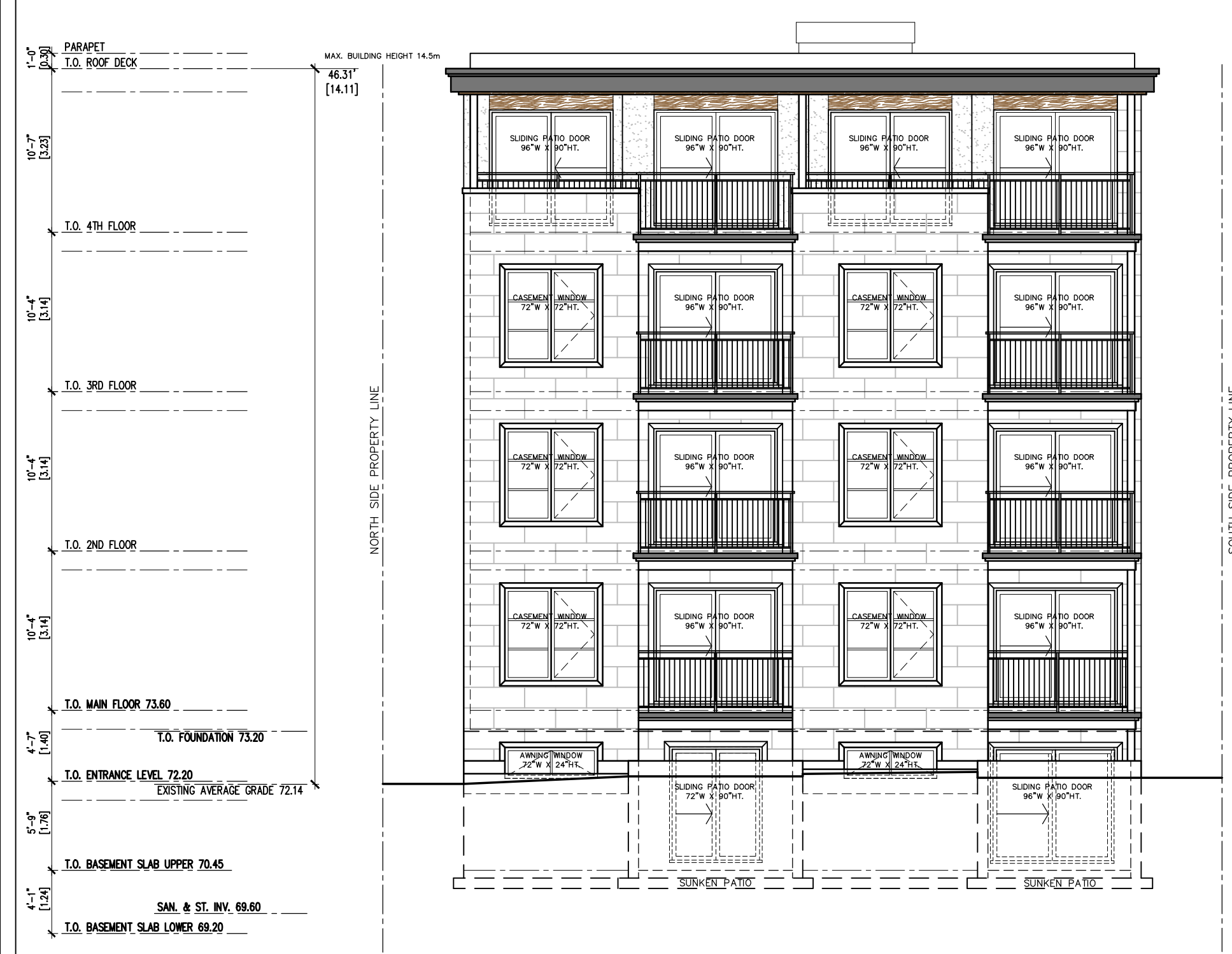
REAR ELEVATION (WEST) SCALE: 1/8" = 1'-0"

APPROVED By Andrew McCreight at 7:35 am, Jun 07, 2024