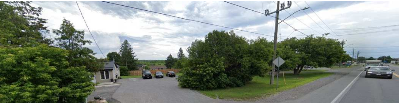
Image 5. Property immediately to the north of site looking northeast from Carp Road (Google Streetview, July 2022)