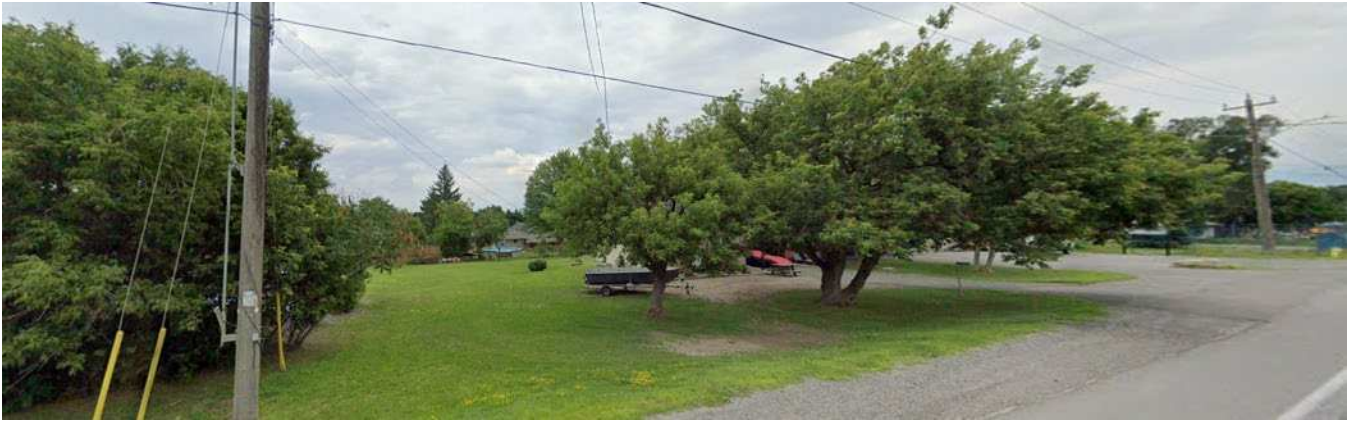
Image 2. Subject site looking east from Carp Road