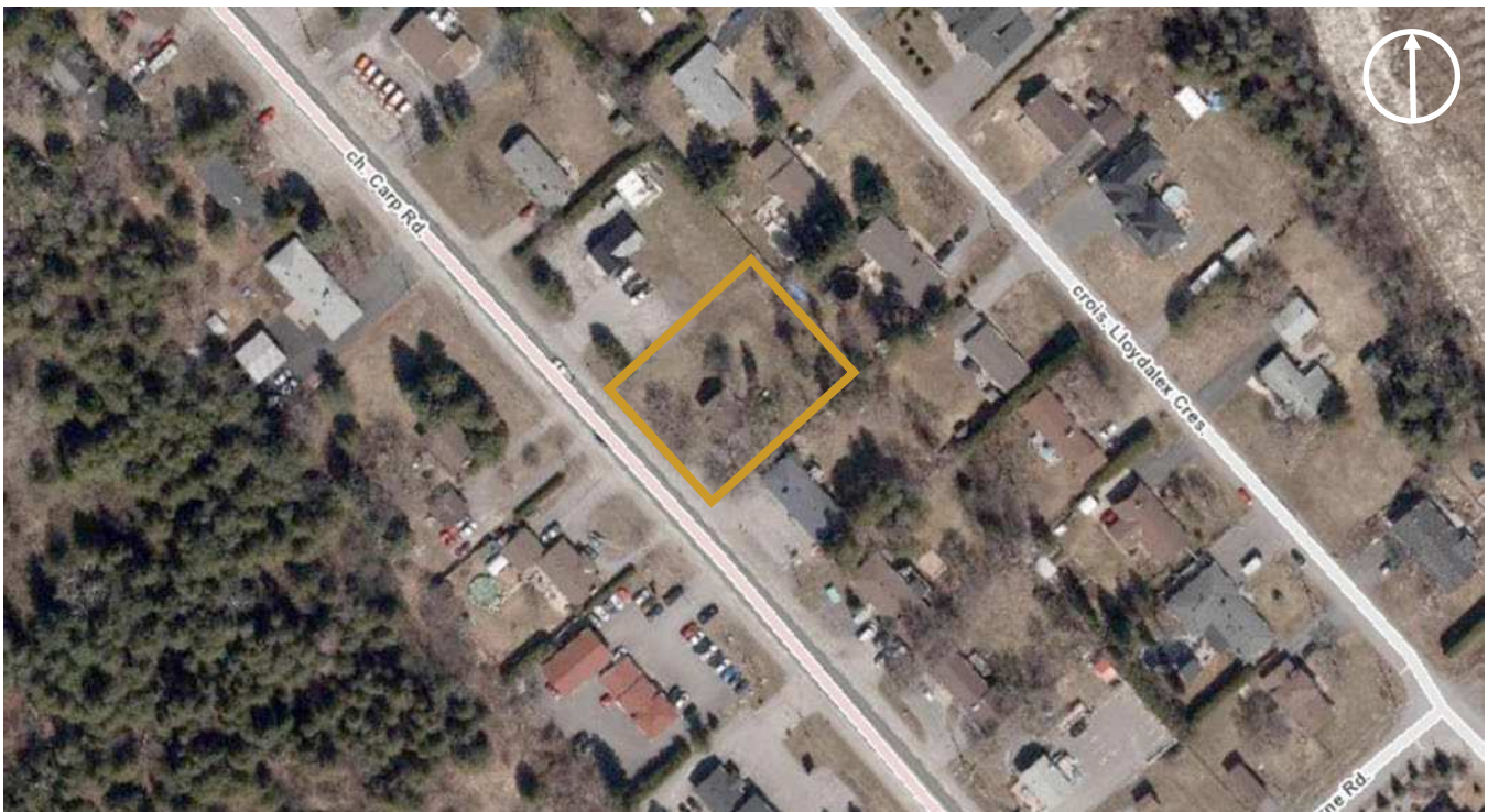
Figure 3. Aerial imagery of subject site and immediately surrounding land uses