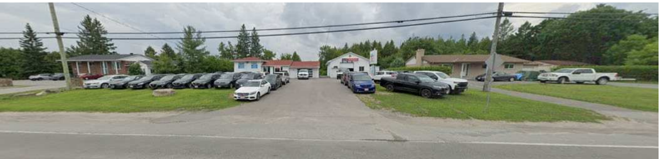
Image 4. Car dealership across from subject site looking southwest from Carp Road