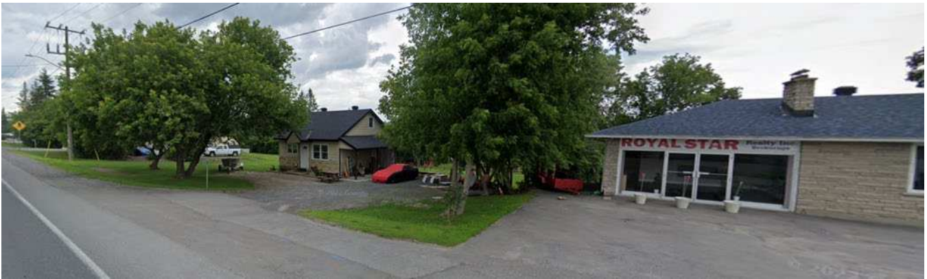
Image 3. Subject site and adjacent commercial use looking north from Carp Road (Google Streetview, July 2022)