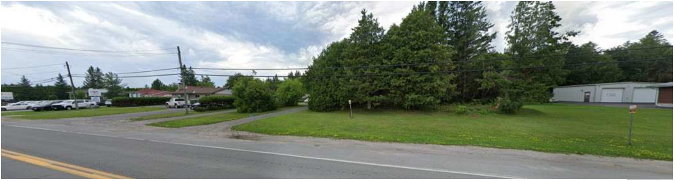
Image 6. Surrounding conditions looking southwest from Carp Road (Google Streetview, July 2022)