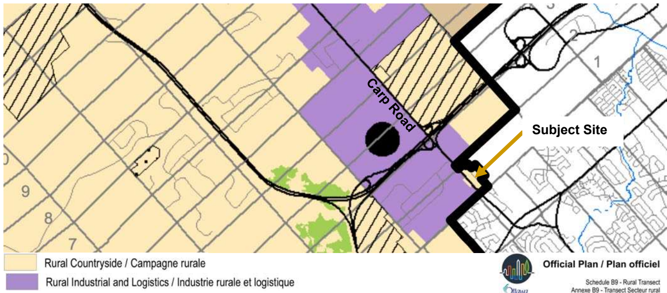
Figure 6. Extract of new Official Plan, Schedule B9 – Rural Transect

The subject site is designated Rural Countryside in the Official Plan. Per Section 9.2 of the Official Plan, “[t]he intent of this designation is to accommodate a variety of land uses that are appropriate for a rural location, limiting the amount of residential development and support industries that serve local residents and the travelling public, while ensuring that the character of the rural area is preserved”. Per Section 9.2.2, Subsection 2 , permitted uses, where the appropriate zoning is in place, include small scale commercial where the uses serve the rural community, they are located within 200 metres of an arterial or collector road, are of appropriate scale for the rural context, minimizes incompatibilities with adjacent residential uses, and integrates appropriately with the rural character. Subsection 3 states that “[w]here the use is proposed within 1 kilometer of a Village or Urban boundary, it will be reviewed to ensure that it shall not impede the expansion of the settlement area and all of the following criteria shall be considered: