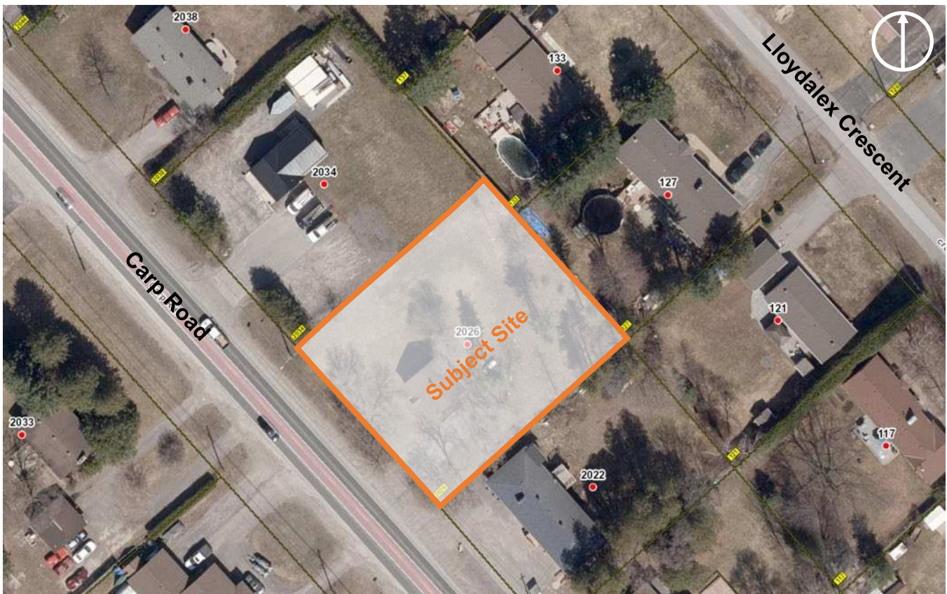
Figure 1. Subject site showing property lines and surrounding context (GeoOttawa, 2021)

The site is a roughly square-shaped lot located on the east side of Carp Road, municipally known as 2026 Carp Road. There is presently a small single-detached dwelling (formerly residential) located on the west side of the lot towards the Carp Road frontage, with a gravel driveway located on the south side towards the southern interior side lot line. The intent is to retain and renovate the existing single-detached dwelling to convert the building into a sales office for used vehicles. Figure 1 below shows the site and approximate property lines per 2021 GeoOttawa mapping.