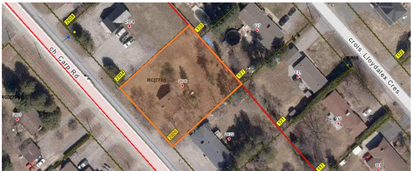
Figure 7. Extract of zoning by-law with subject sites shown in orange (GeoOttawa, 2021)