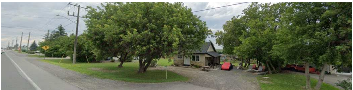
Image 1. Subject site looking north from Carp Road (Google Streetview, July 2022)

Images 1, 2 and 3 below represent the existing site conditions (Google Streetview, July 2022) from Carp Road. The existing building is to be retained and converted to a sales office for the automobile dealership use. Images 4 through 7 present the immediately surrounding context (Google Streetview, 2019).