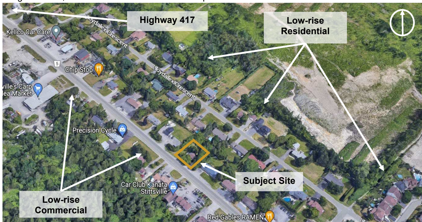
Figure 4. Aerial imagery of subject site and immediately surrounding land uses

The site fronts onto the east side of Carp Road, which is a two-lane generally north-south Arterial which connects Stittsville to Fitzroy, travelling from Stittsville Main Street to the southeast, to Galetta Side Road to the northwest. Carp Road provides direct access to Highway 417 which travels east-west across the City of Ottawa and is easily navigable for trucking routes. Given the rural location of the site, there is limited transit accessible to the site, with the closest transit stations being located to the southeast at Tanger Outlets, located Palladium Drive and Campeau Drive.