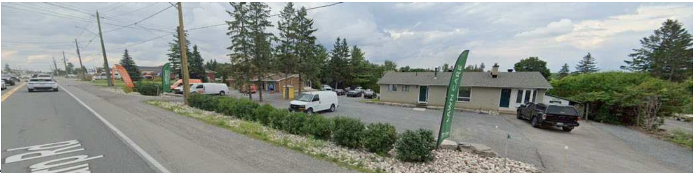
Image 7. Surrounding commercial uses north of site looking north from Carp Road (Google Streetview, July 2022)