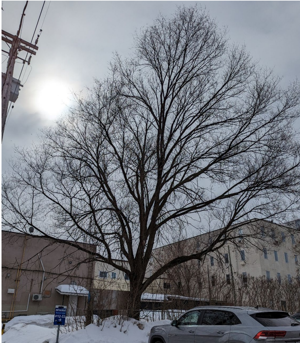
Figure 3 - Tree 3: Boundary Siberian elm to be removed