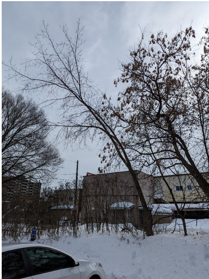
Figure 2 - Tree 2: Boundary elm to be removed