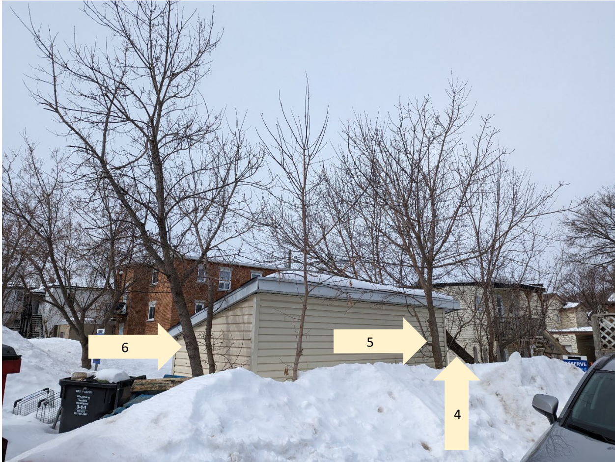
Figure 4 - Trees 4, 5 and 6 (indicated with arrows): boundary Manitoba maples to be removed