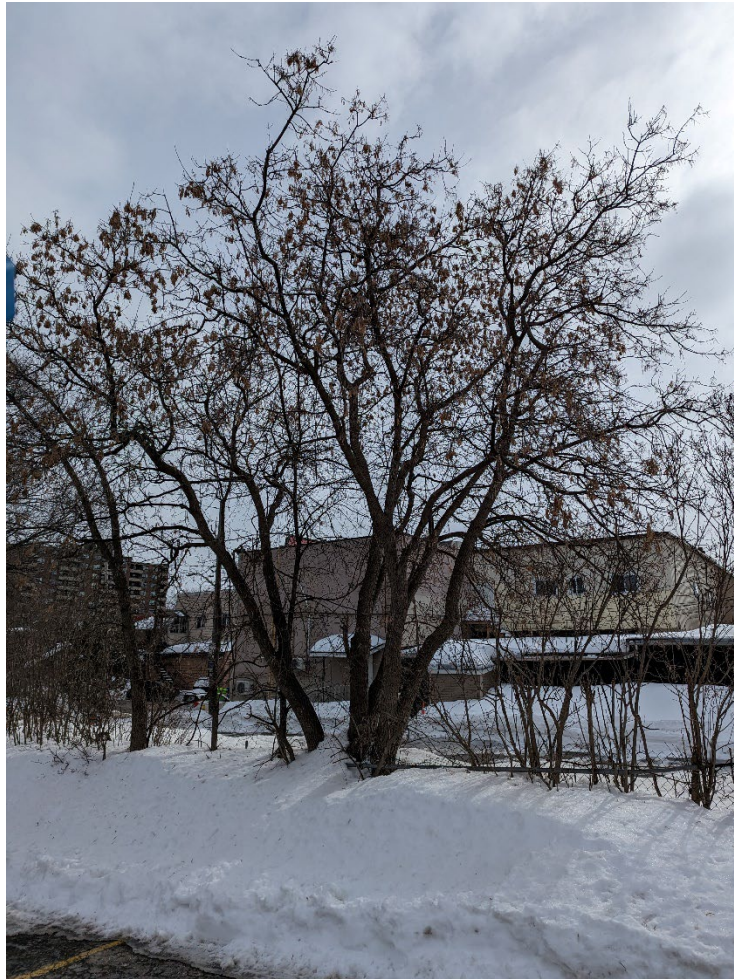
Figure 1 - Tree 1: Adjacent Manitoba maple to be removed