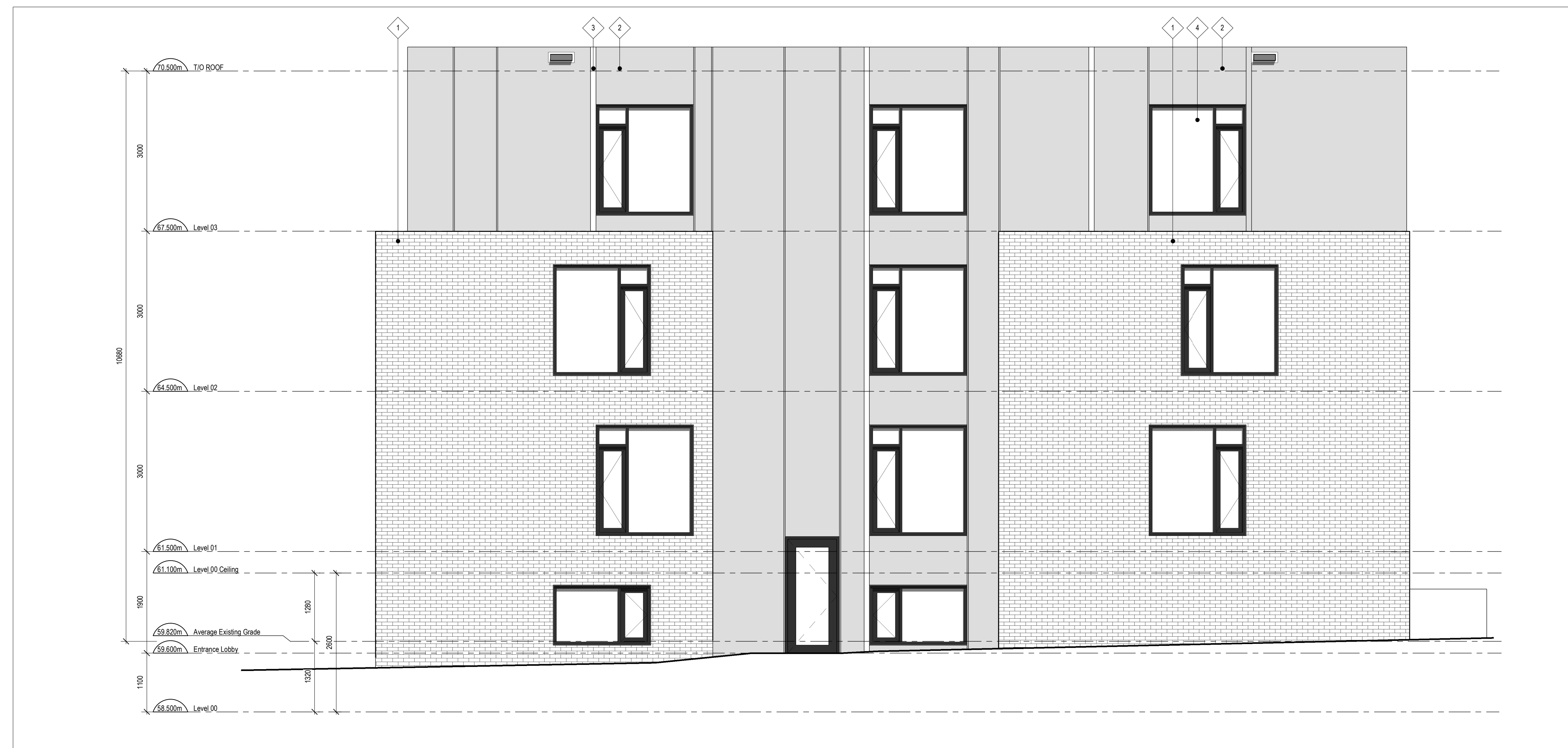
1 NORTH ELEVATION A202 SCALE: 1 : 50