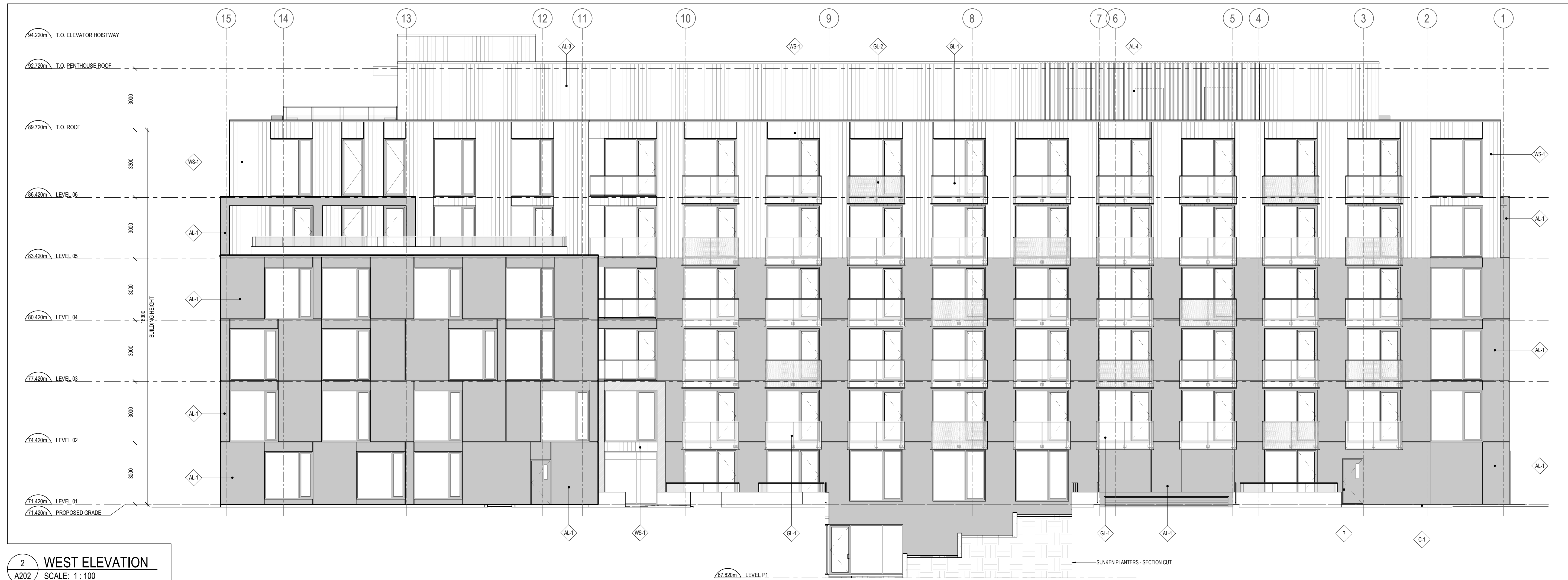
2 WEST ELEVATION A202 SCALE: 1:100