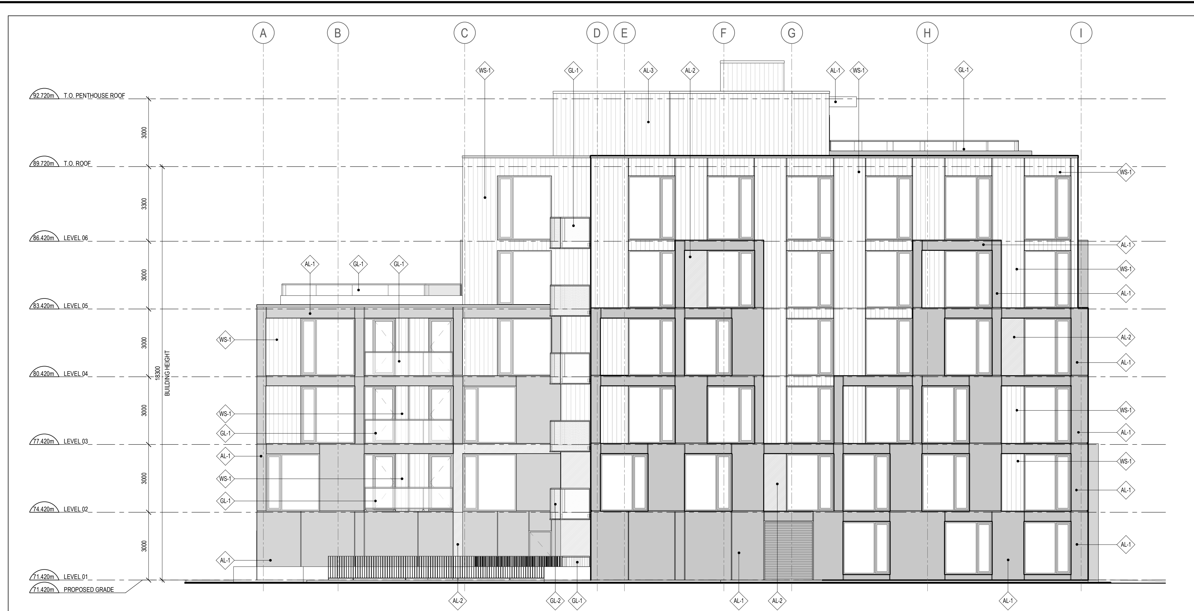
1 SOUTH ELEVATION A201 SCALE: 1:100