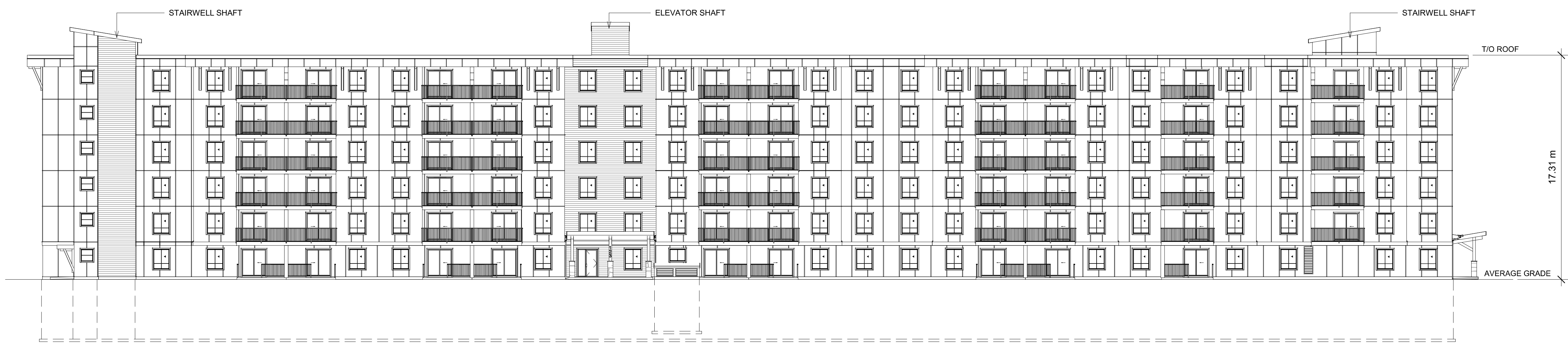
2 SOUTH ELEVATION 1 : 175