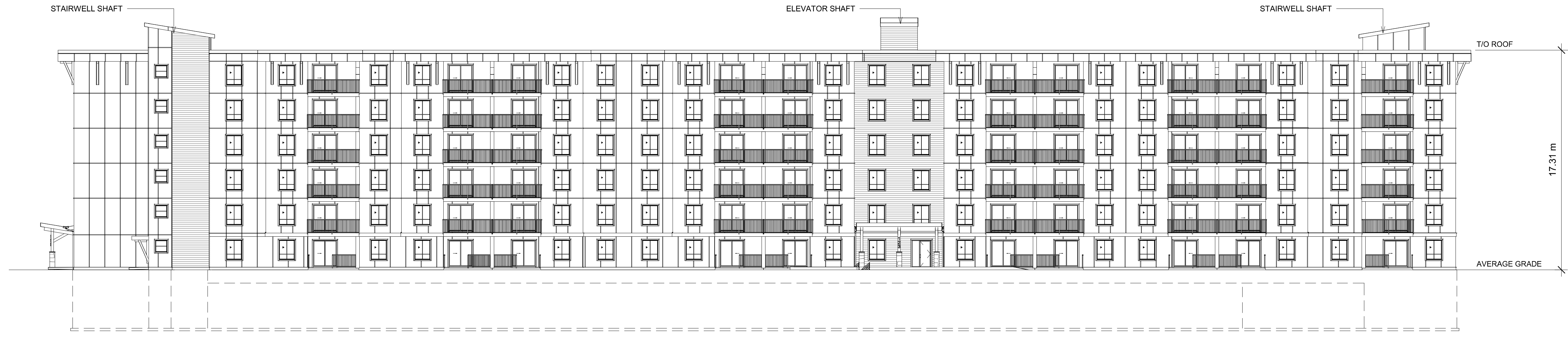
1 NORTH ELEVATION 1 : 175