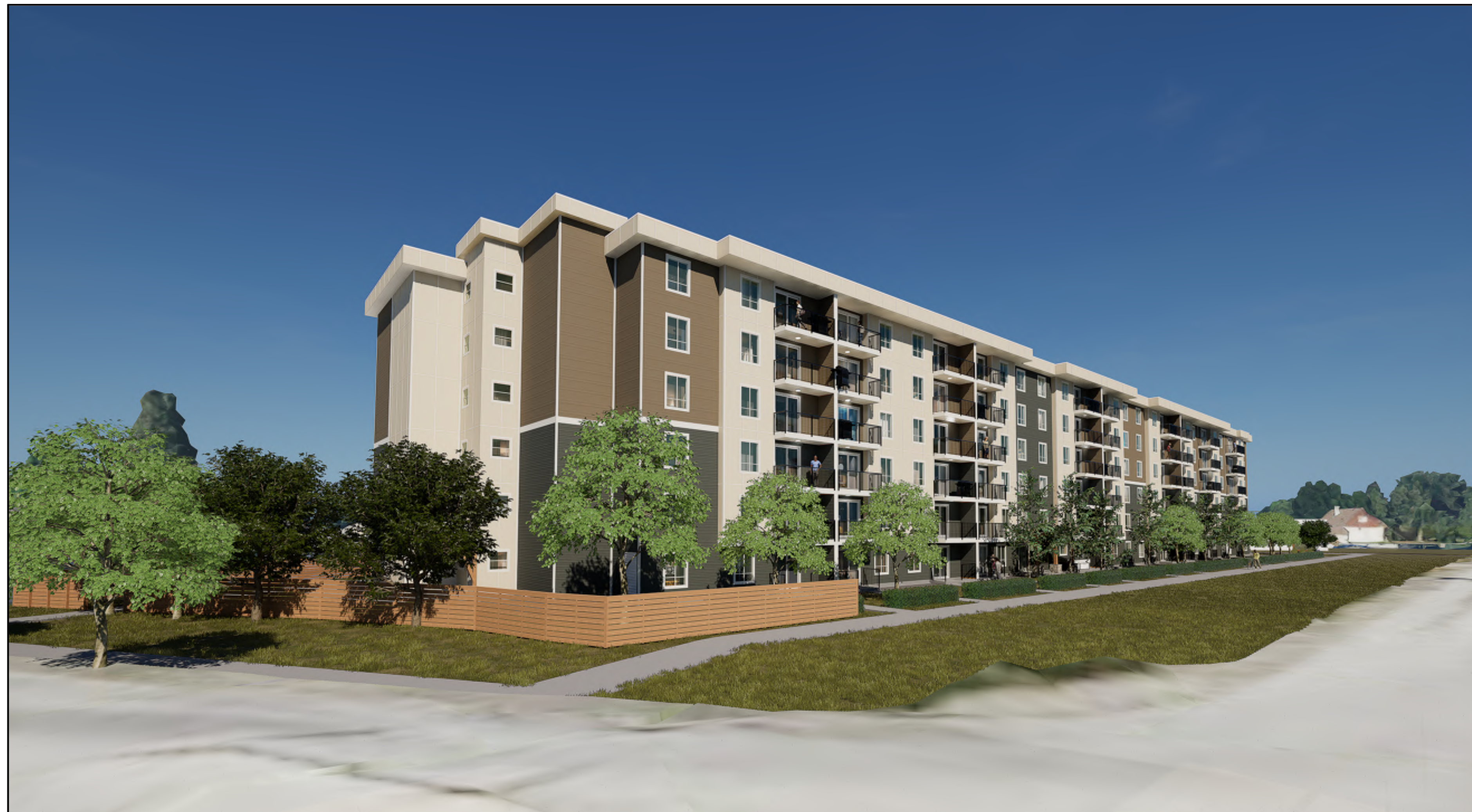
(1) WEST VIEW OF STREET SIDE ENTRANCE