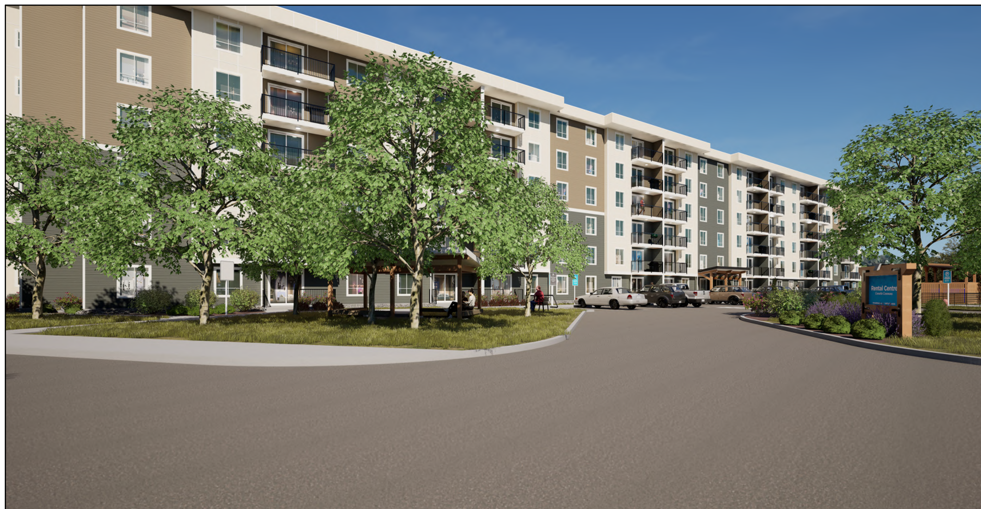
(2) EAST VIEW SITE ENTRANCE