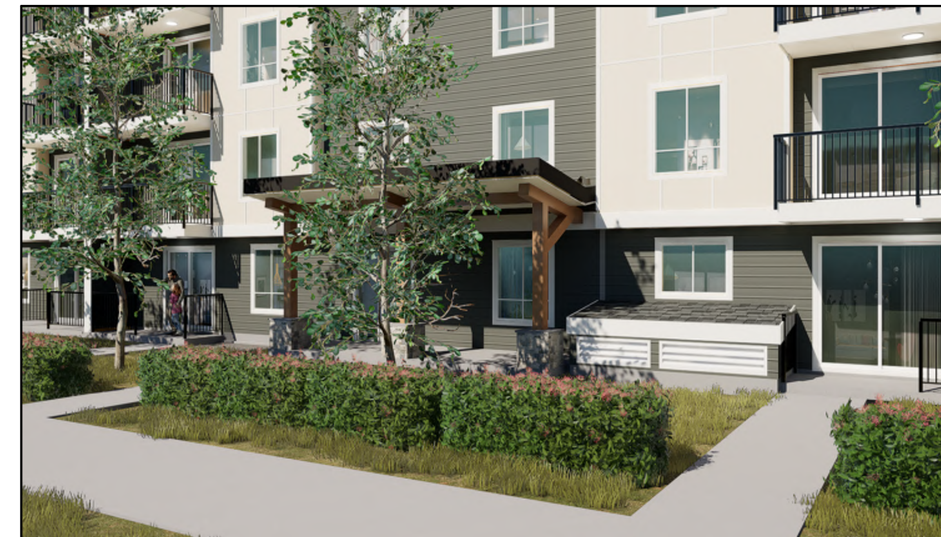
(3) STREET SIDE ENTRANCE