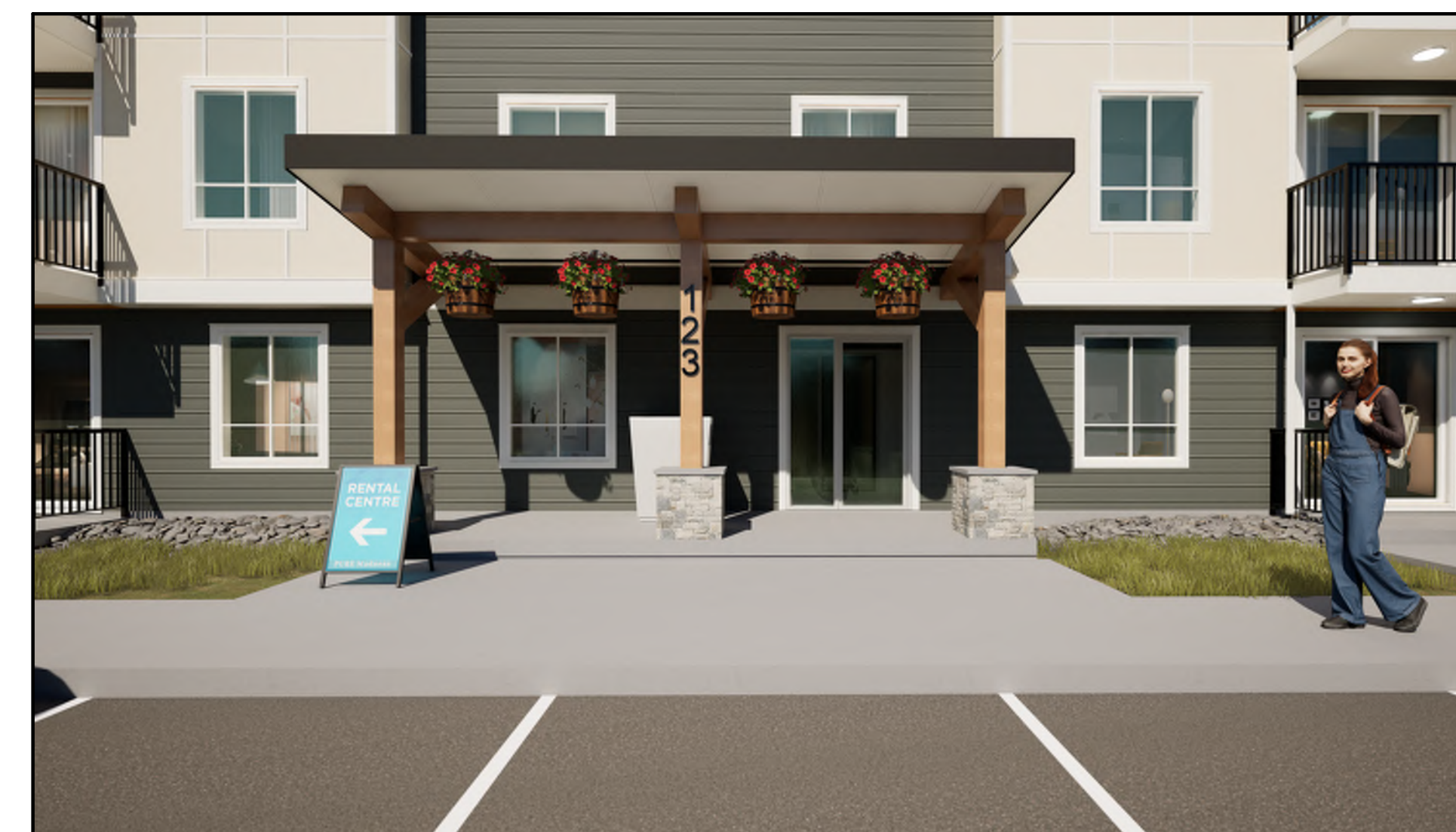
(4) PRINCIPAL ENTRANCE