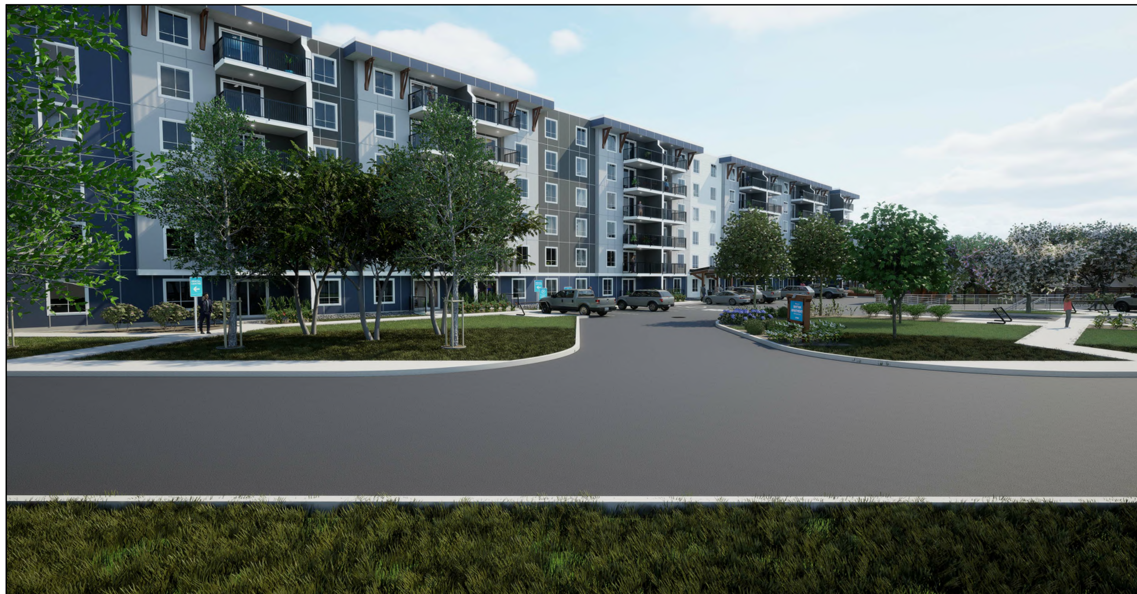
(2) EAST VIEW SITE ENTRANCE