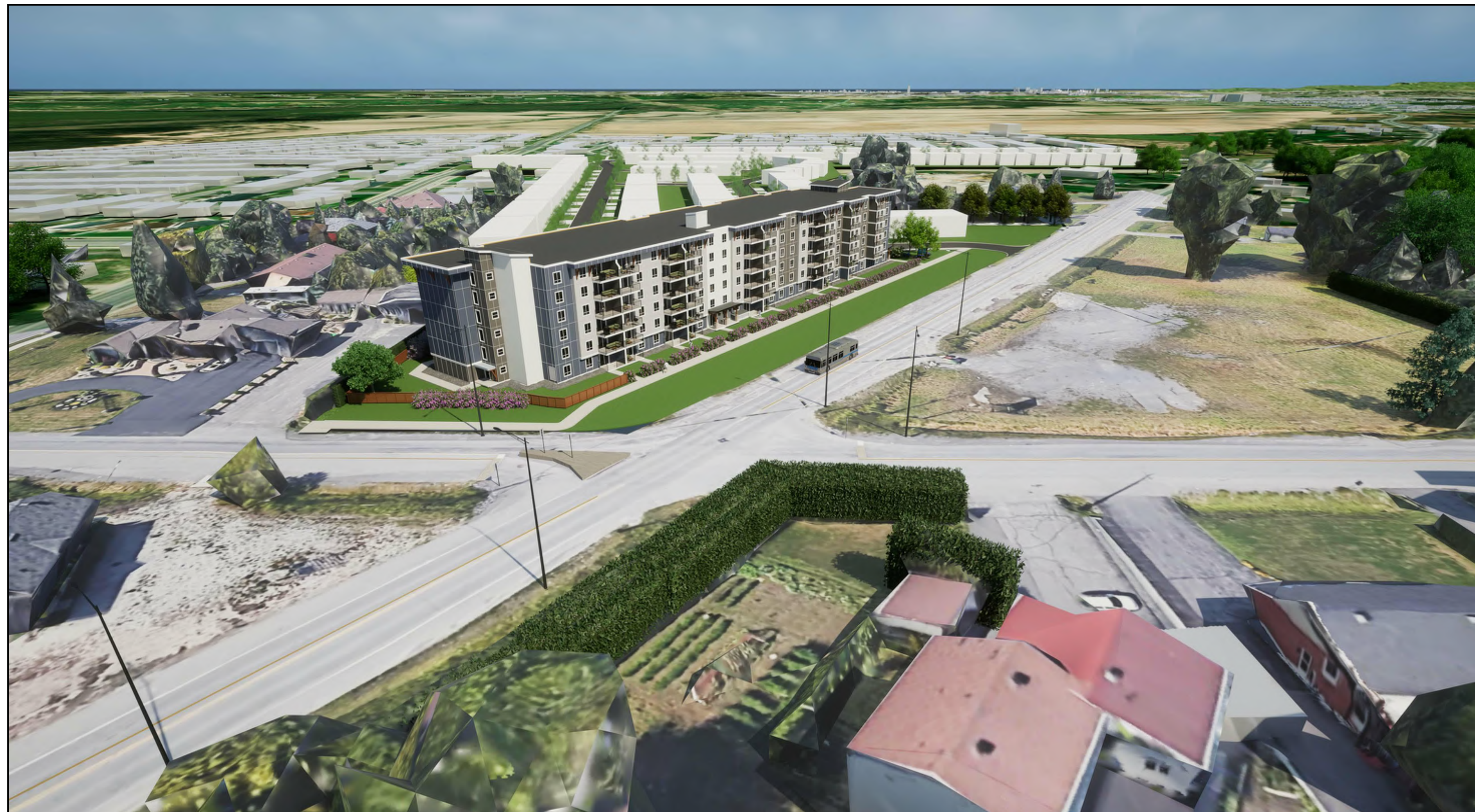
(1) WEST VIEW OF STREET SIDE ENTRANCE