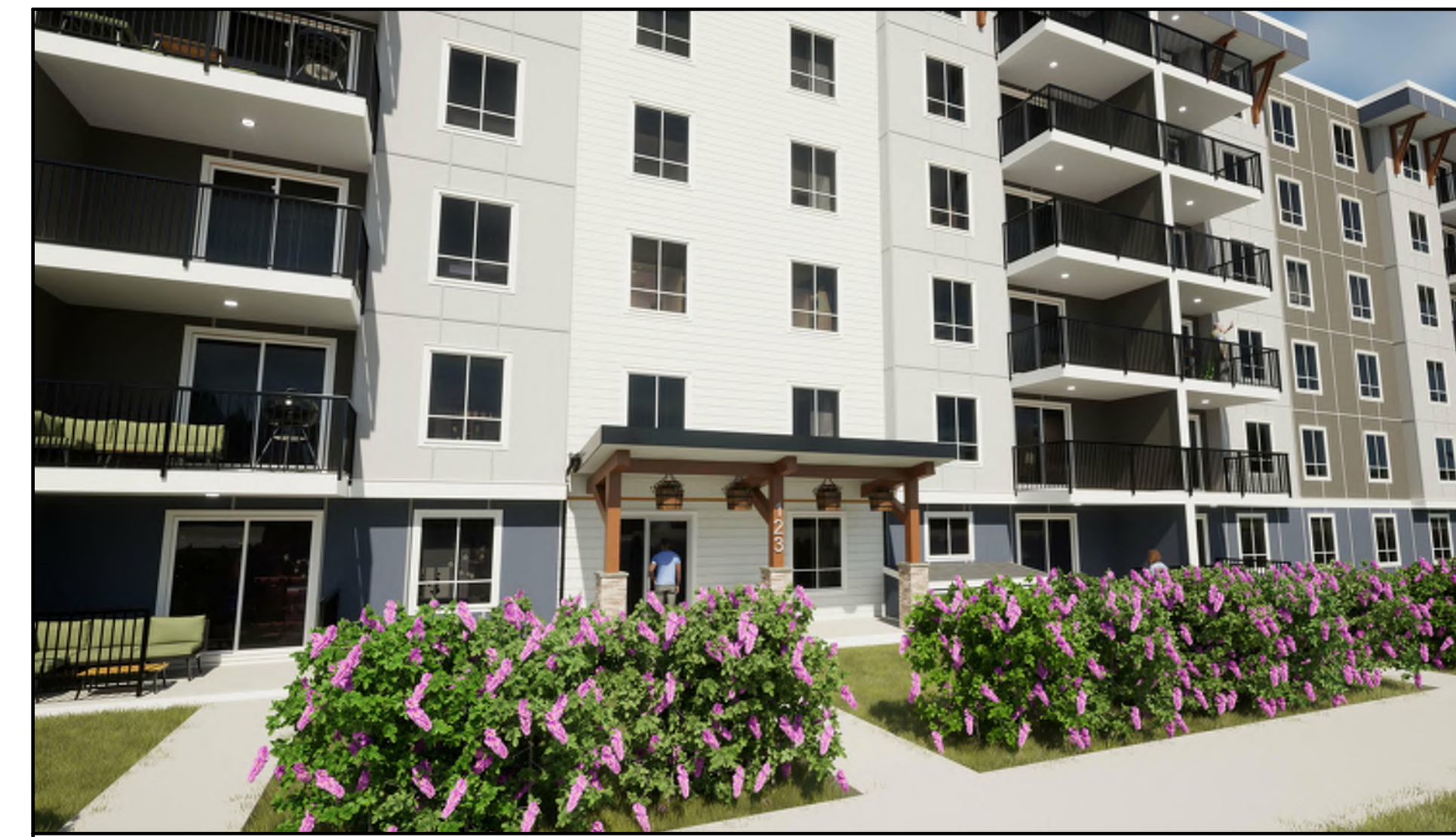
(3) STREET SIDE ENTRANCE