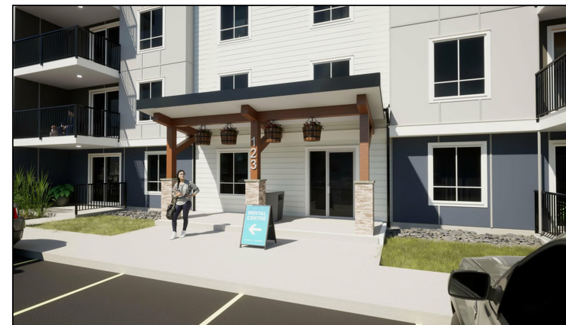
(4) PRINCIPAL ENTRANCE