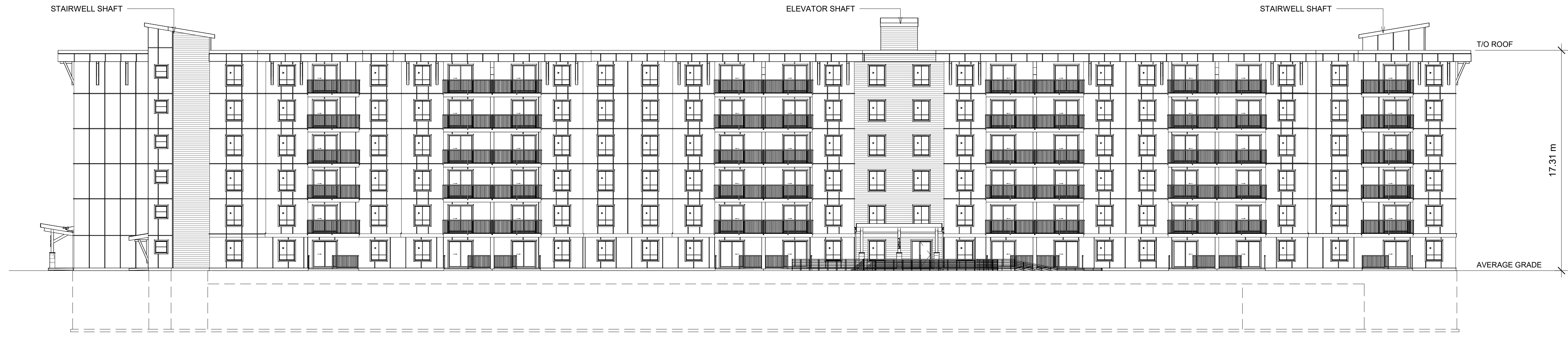
1 NORTH ELEVATION 1 : 175