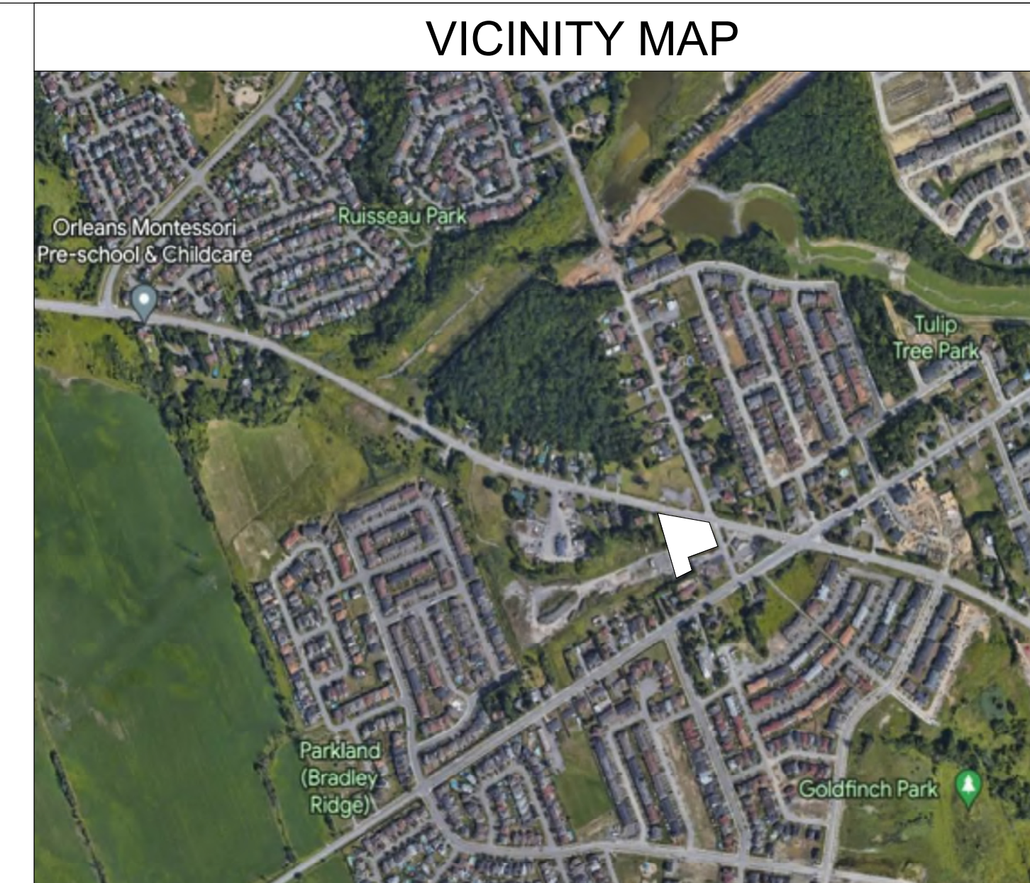
*VICINITY MAP IS ONLY AN APPROXIMATION OF PROJECT LOCATION*