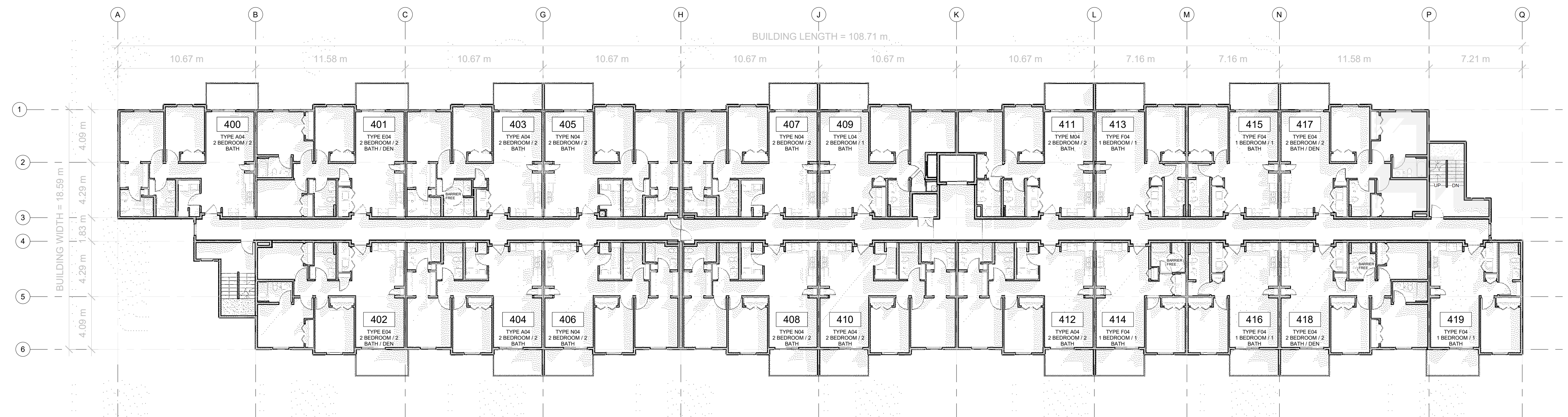
1 FLOOR PLAN - LEVEL 4