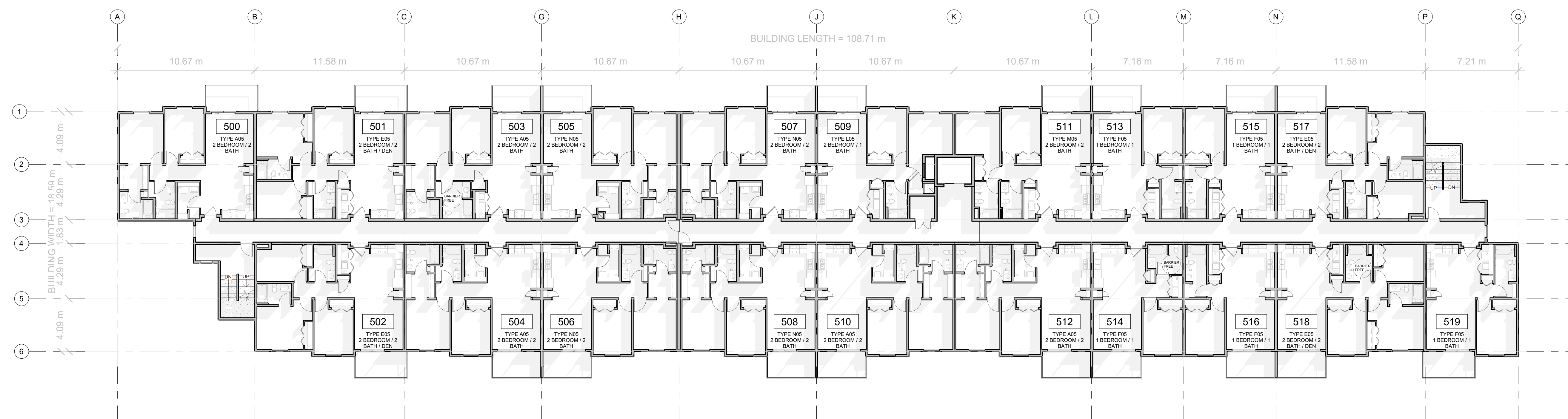
2 FLOOR PLAN - LEVEL 5