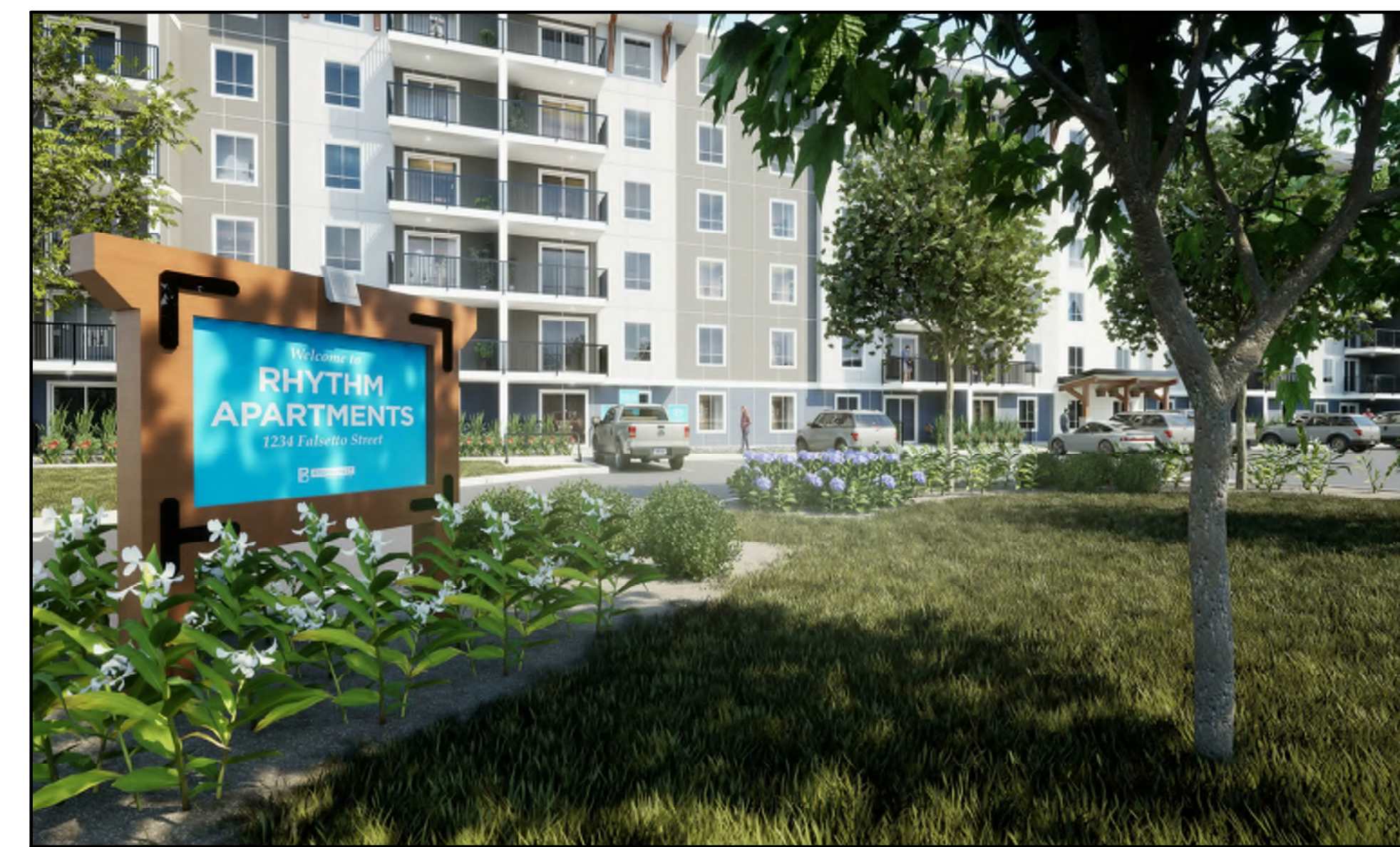
(4) SITE ENTRANCE SIGN