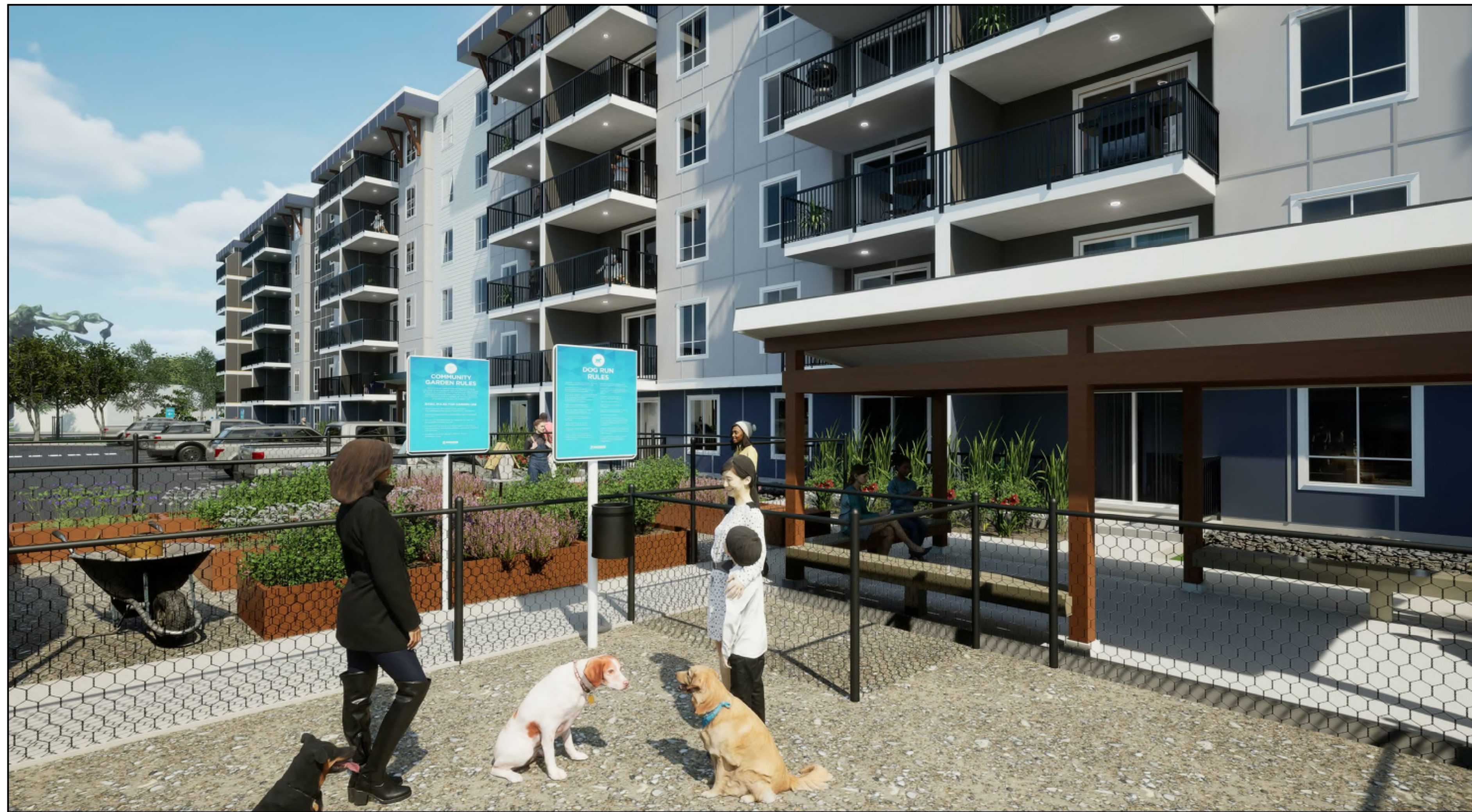
(1) DOG RUN AREA