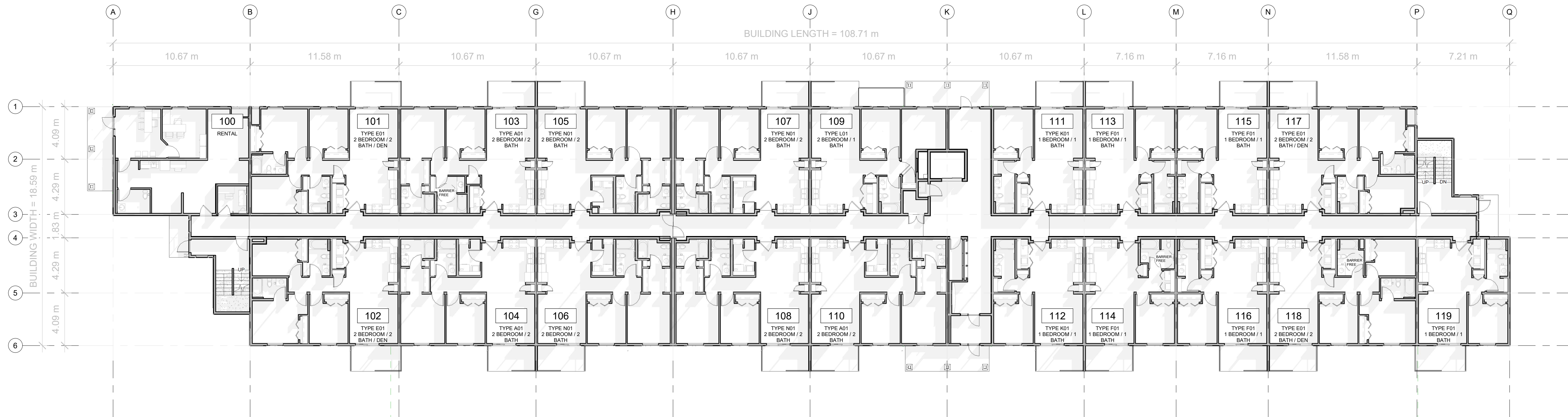
1 FLOOR PLAN - LEVEL 1 1 : 175