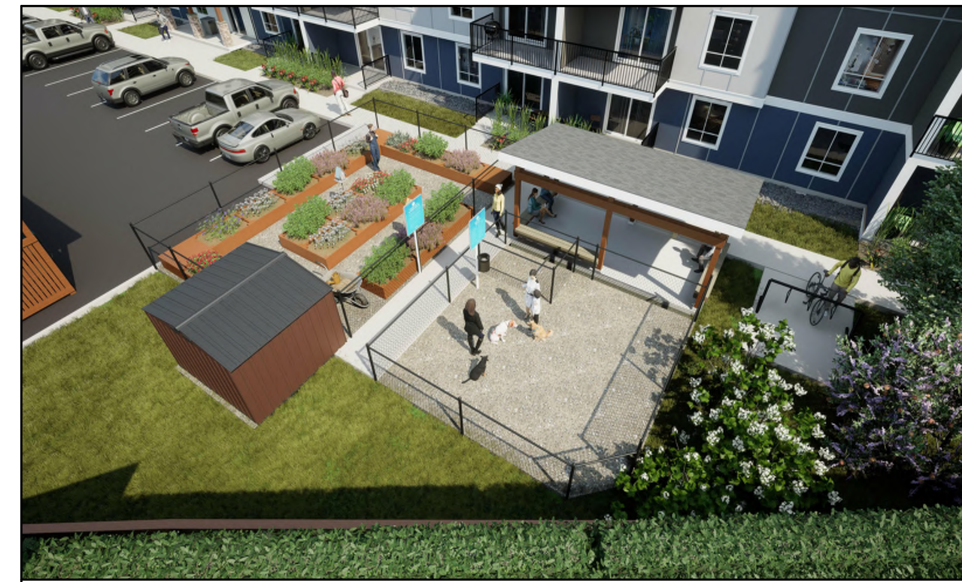
(3) COMMUNITY GARDEN / DOG RUN AREA