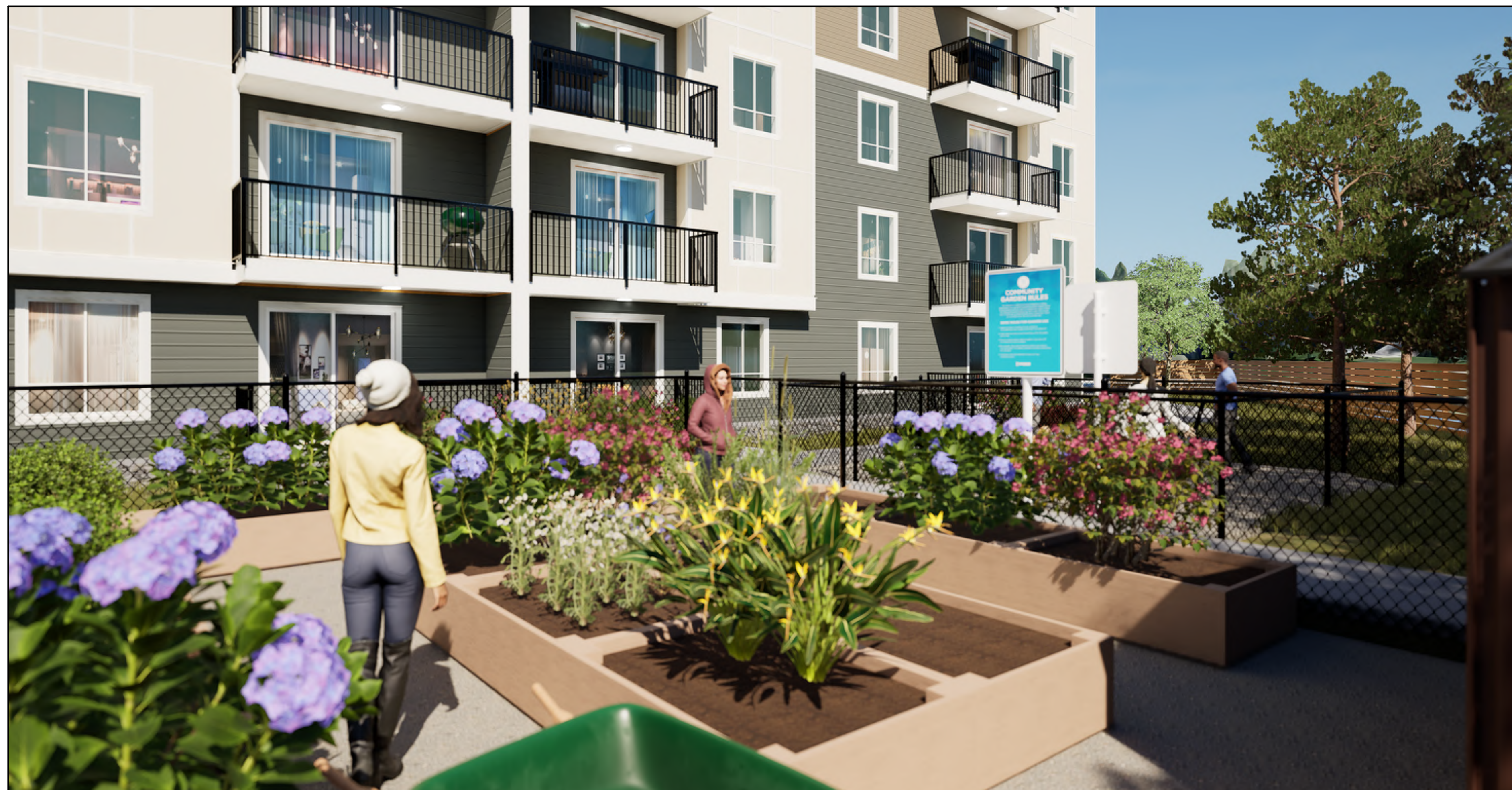
(2) COMMUNITY GARDEN