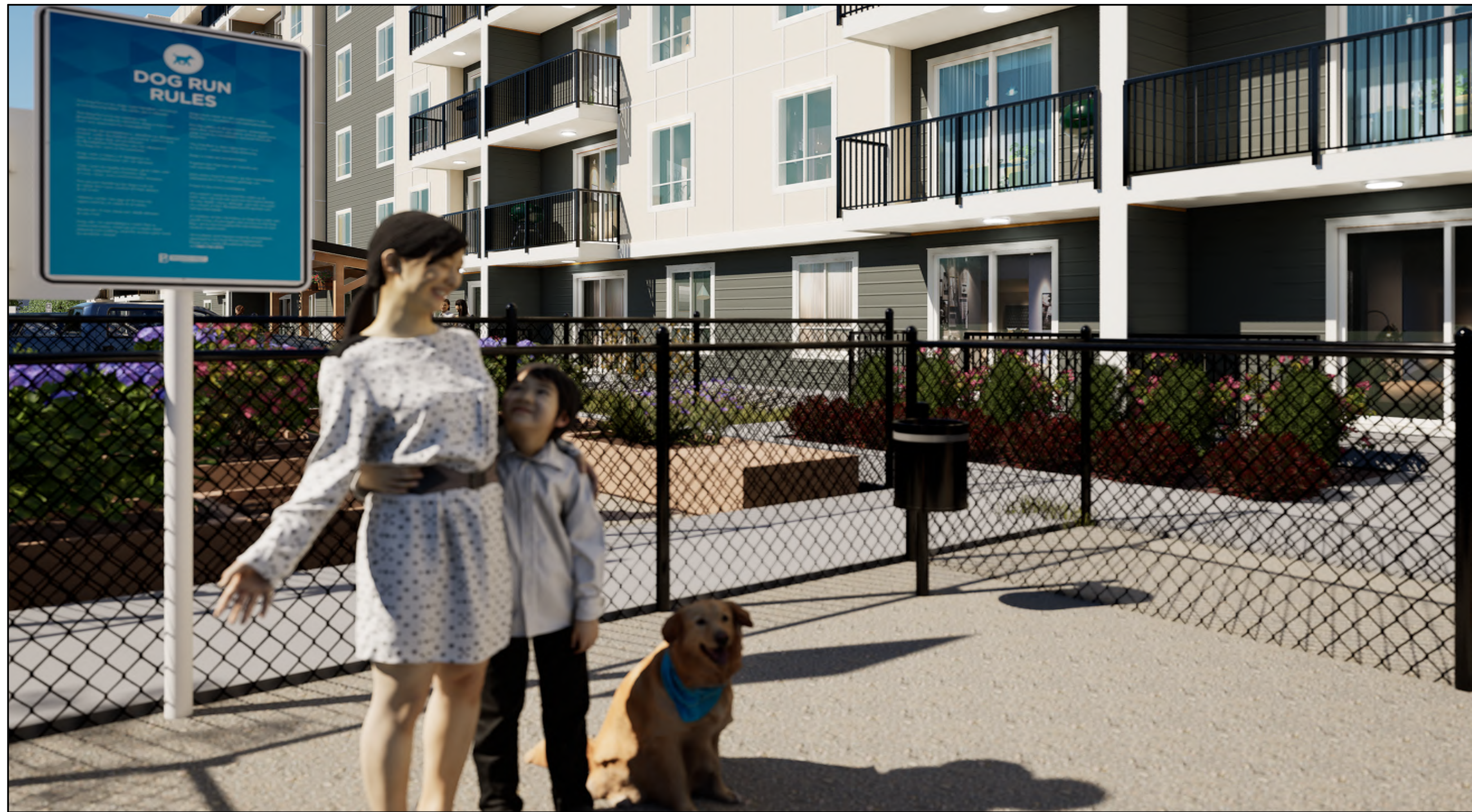
(1) DOG RUN AREA