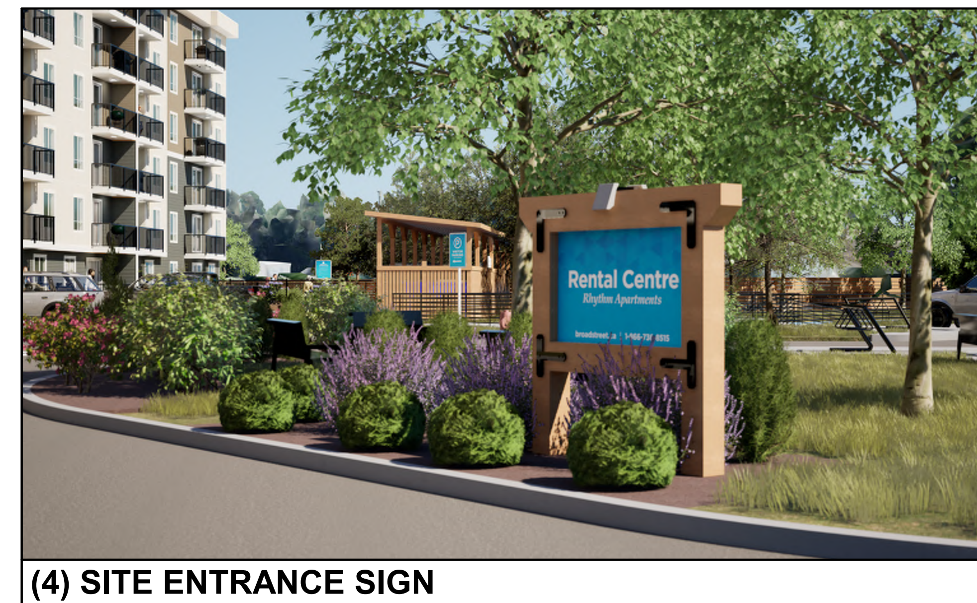
(4) SITE ENTRANCE SIGN