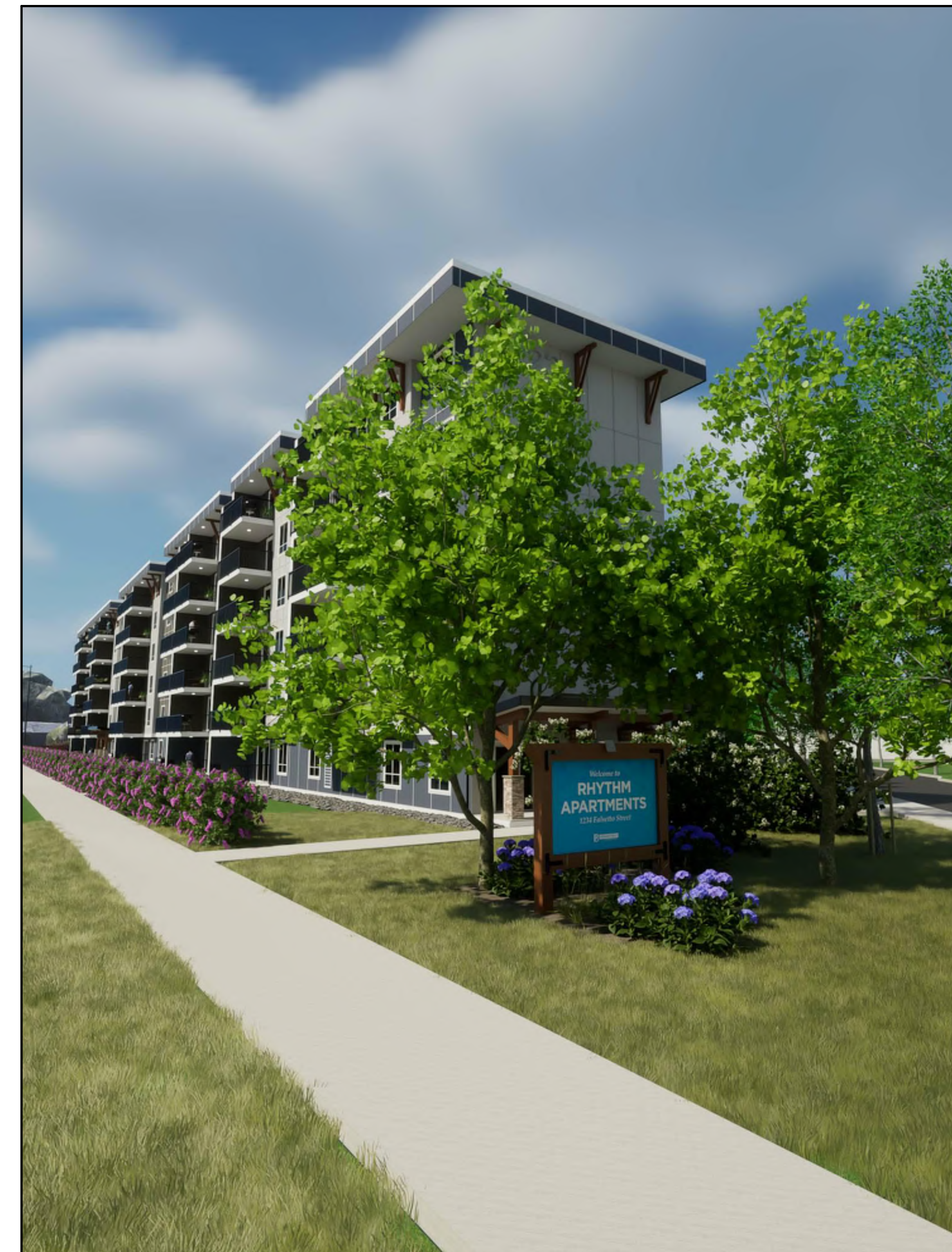
(3) EAST VIEW BUILDING CORNER