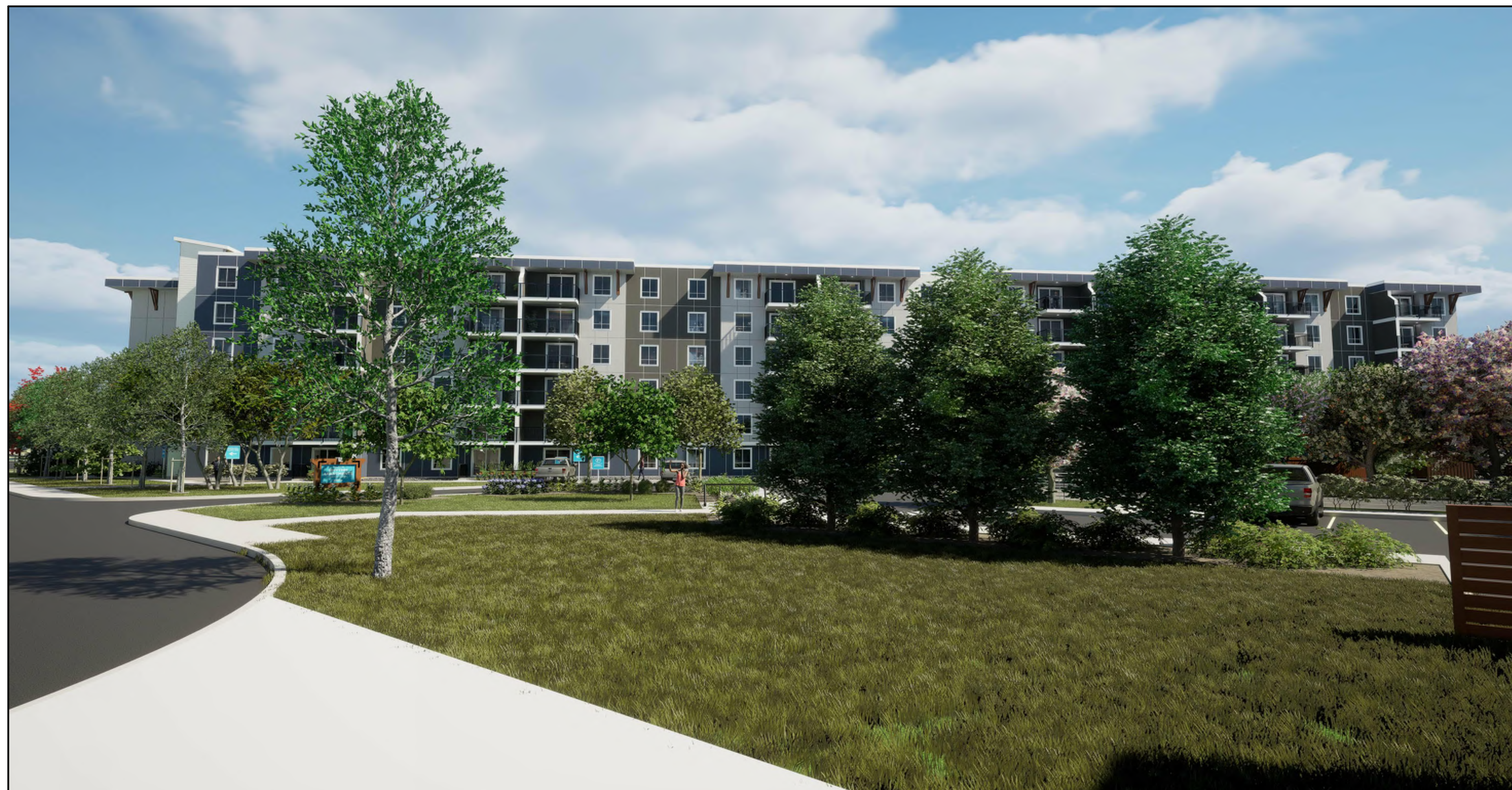
(2) NORTH VIEW LANDSCAPE AREA