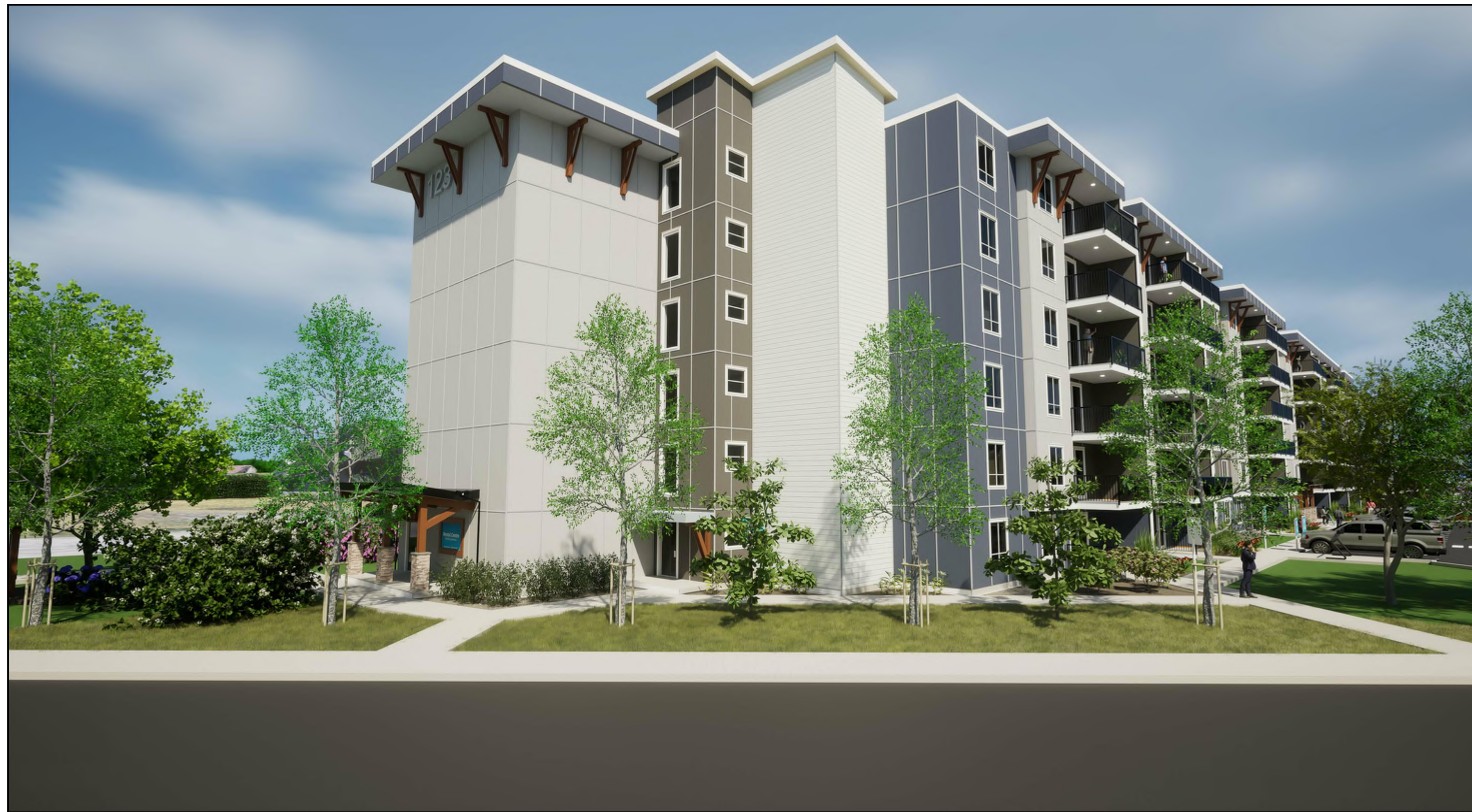
(1) EAST VIEW BUILDING CORNER ENTRANCE