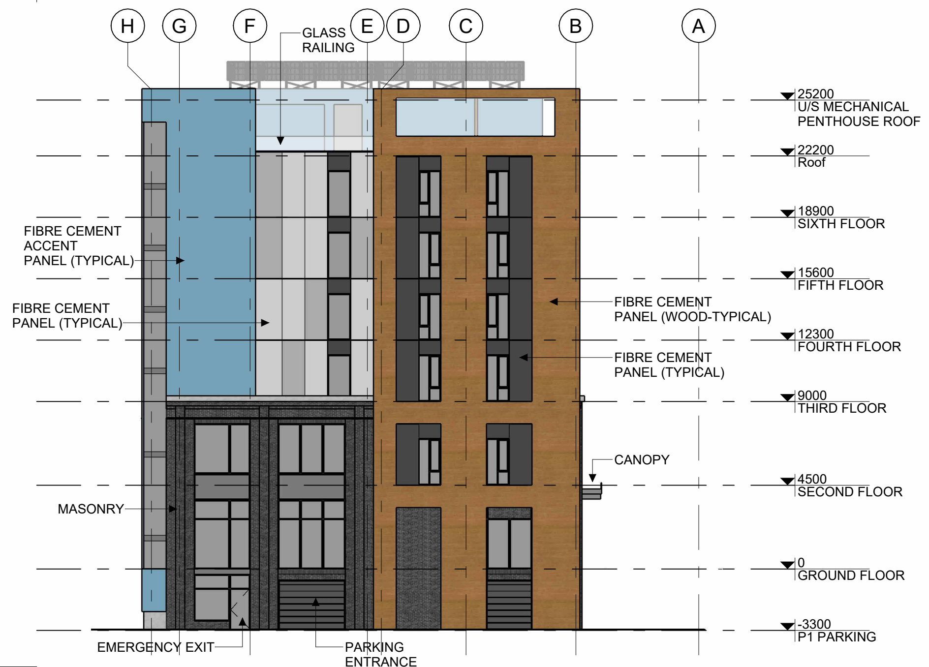
4 NORTH ELEVATION A300 1:200