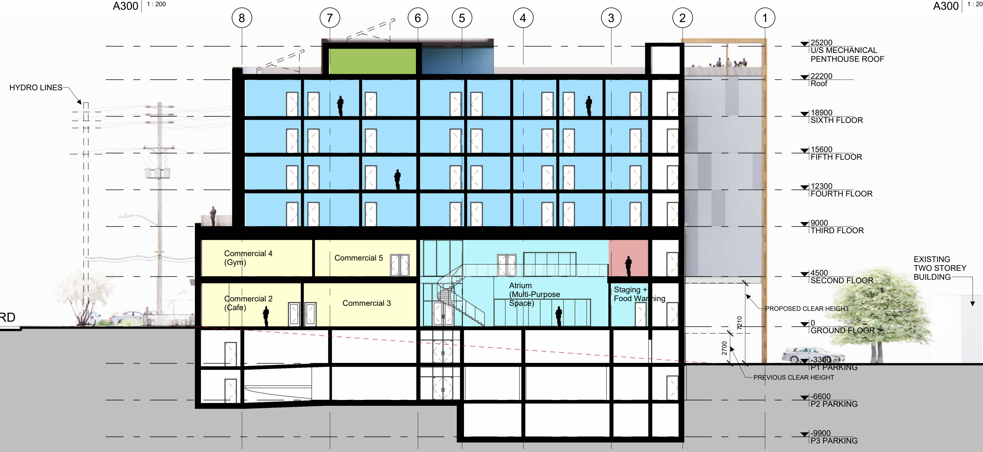
5 BUILDING SECTION A300 1:200