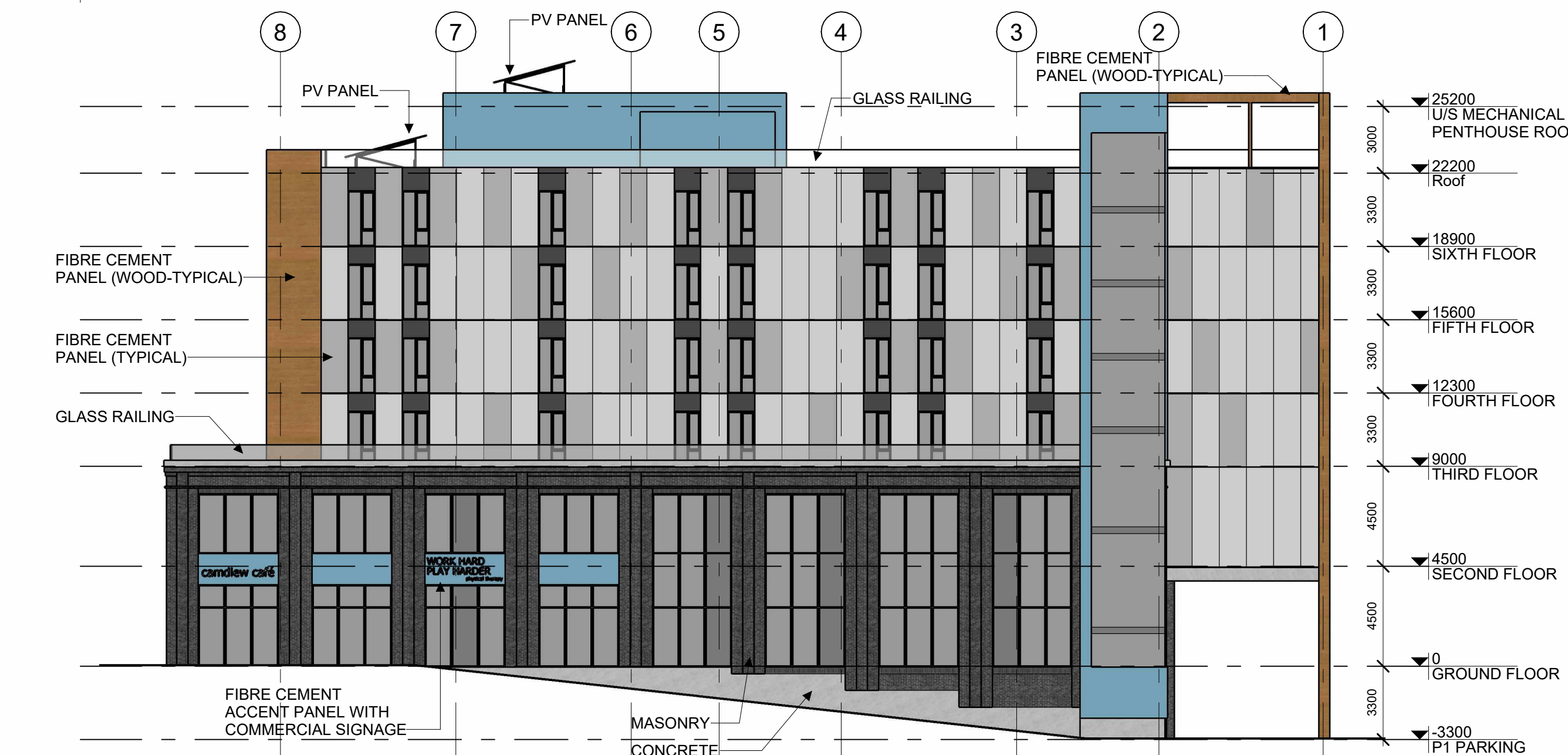
3 EAST ELEVATION A300 1:200