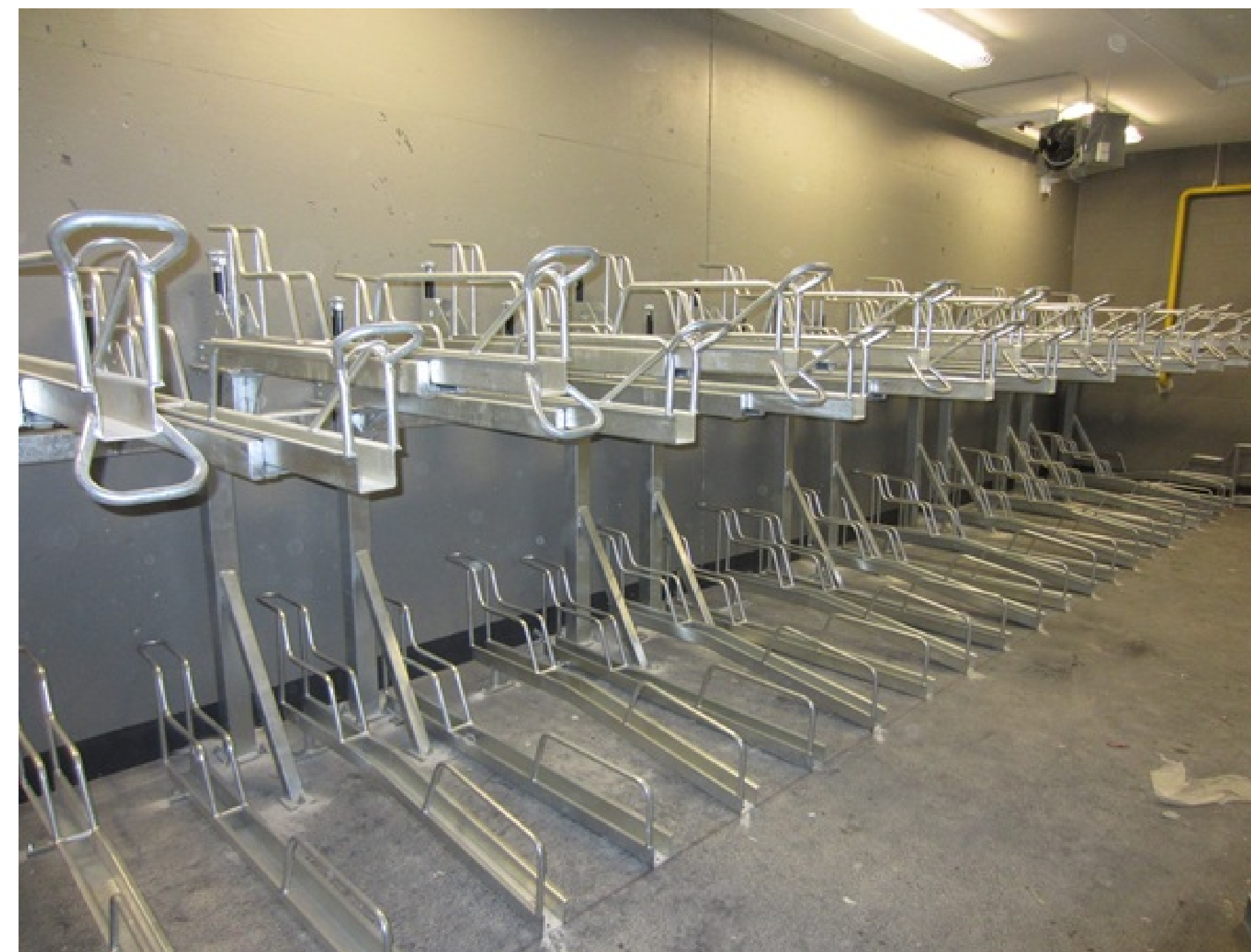
STACKABLE BICYCLE PARKING @ BASEMENT LEVEL