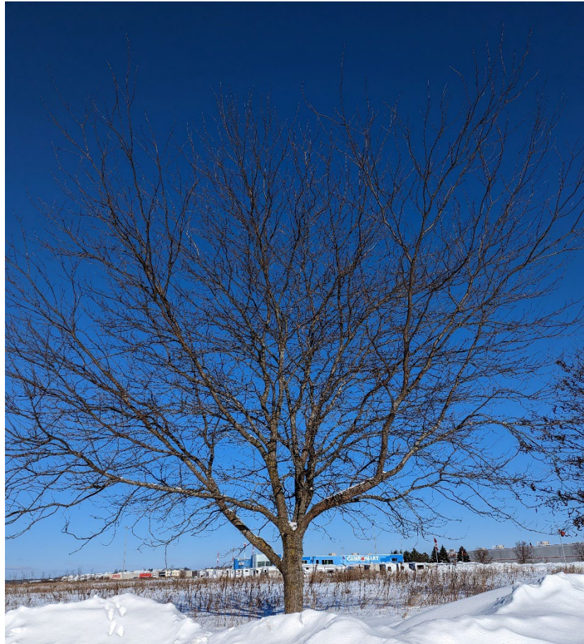
Figure 3 - Tree 4, honey locust