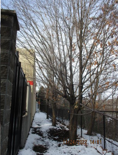
Trees 89, 90 and 91 – Sugar Maple