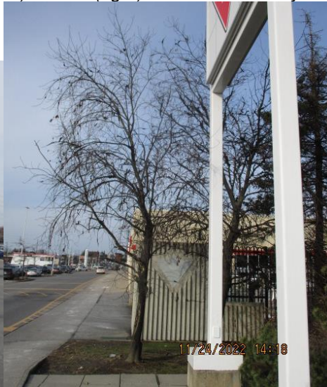
Trees 66 (left) to 68 (right)