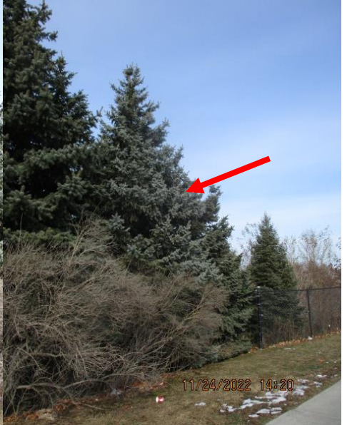
Tree 86 – Colorado Spruce