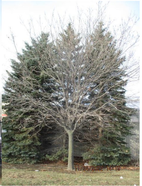
Trees 75 to 78 (Spruce) and 79 (Maple)