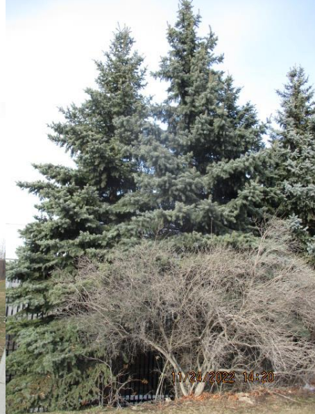
Trees 82 to 85 – Colorado Spruce