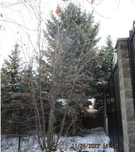
Tree 88 – Green Ash with 87 to south