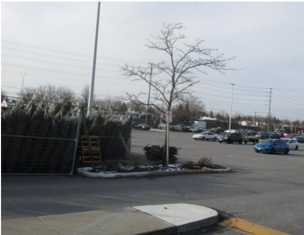
Tree 65 – Honeylocust