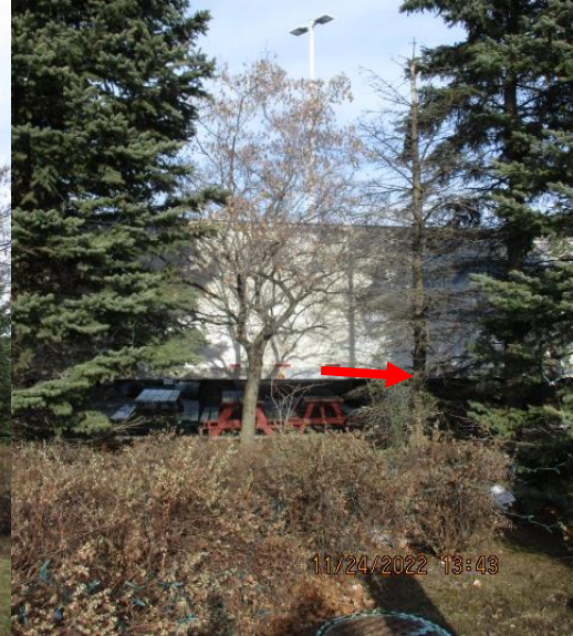
Tree 50 – dead Spruce