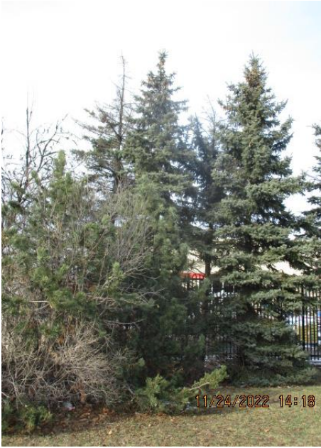
Trees 68 to 71 – Colorado Spruce