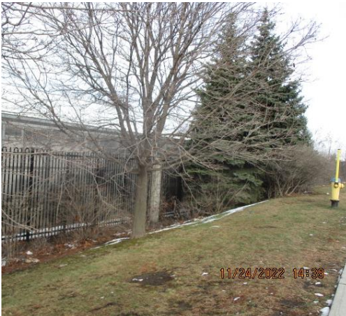
Tree 80 with grade increase in NE corner