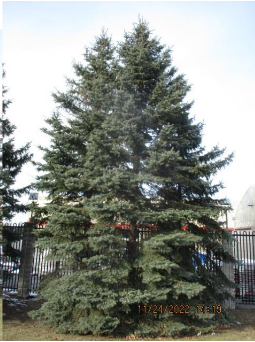
Trees 72 to 74 – Colorado Spruce