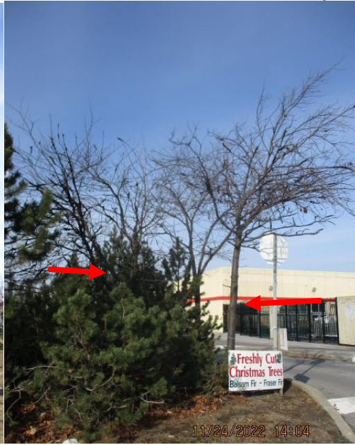
Trees 62(left) and 63 (right) – Schubert Cherry