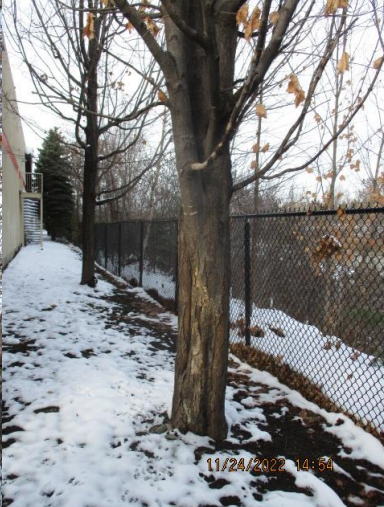
Tree 90 – trunk wound