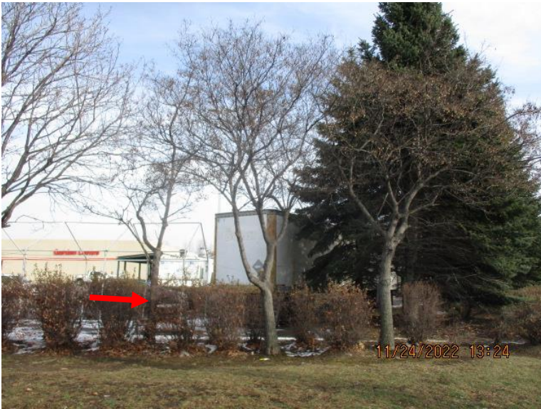
Tree 42 – Amur Maple