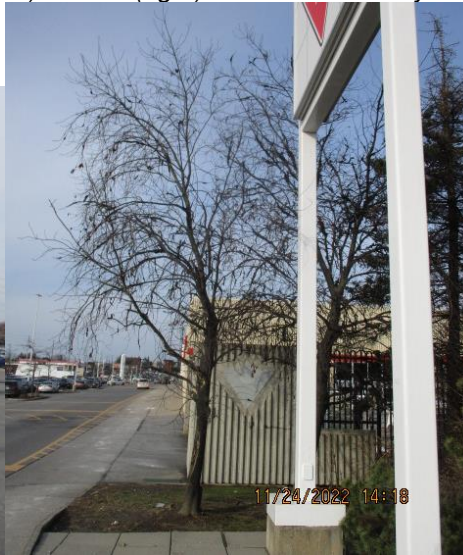
Trees 66 (left) to 68 (right)