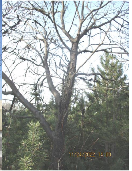
Tree 62 – Canker on trunk