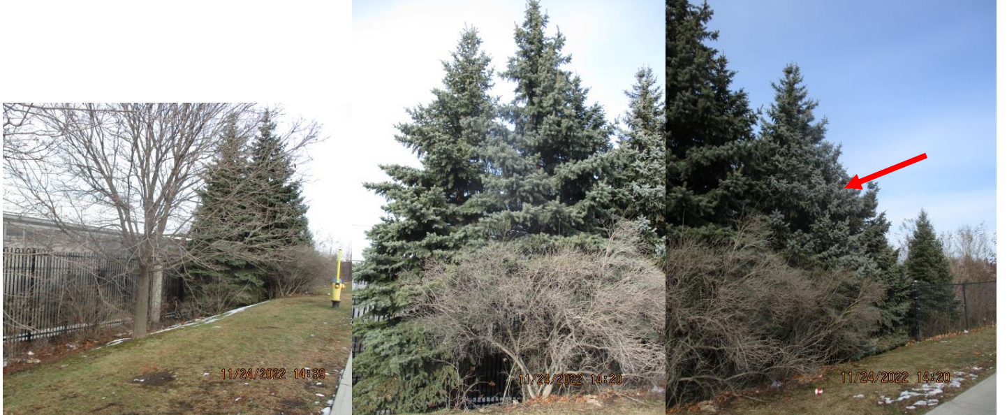
Tree 80 with grade increase in NE corner