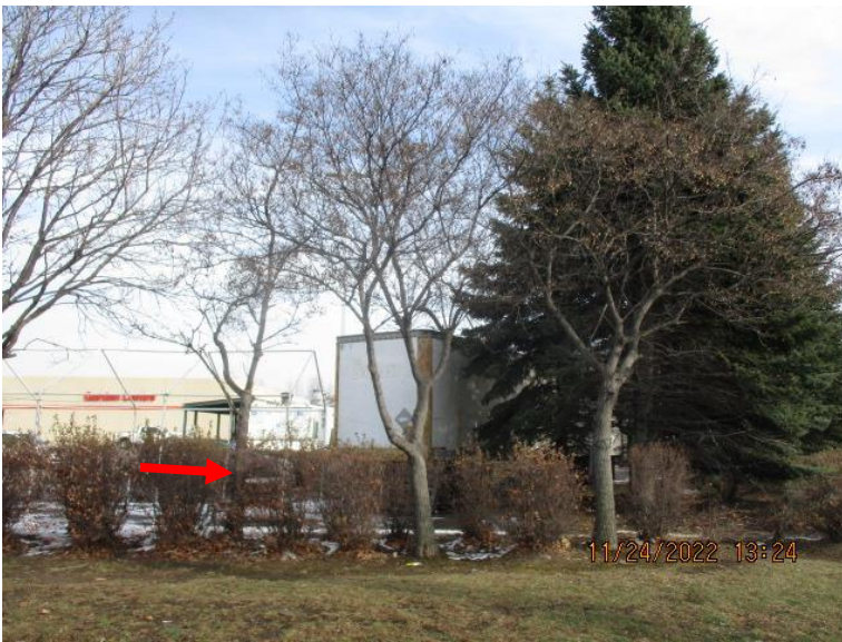
Tree 42 – Amur Maple