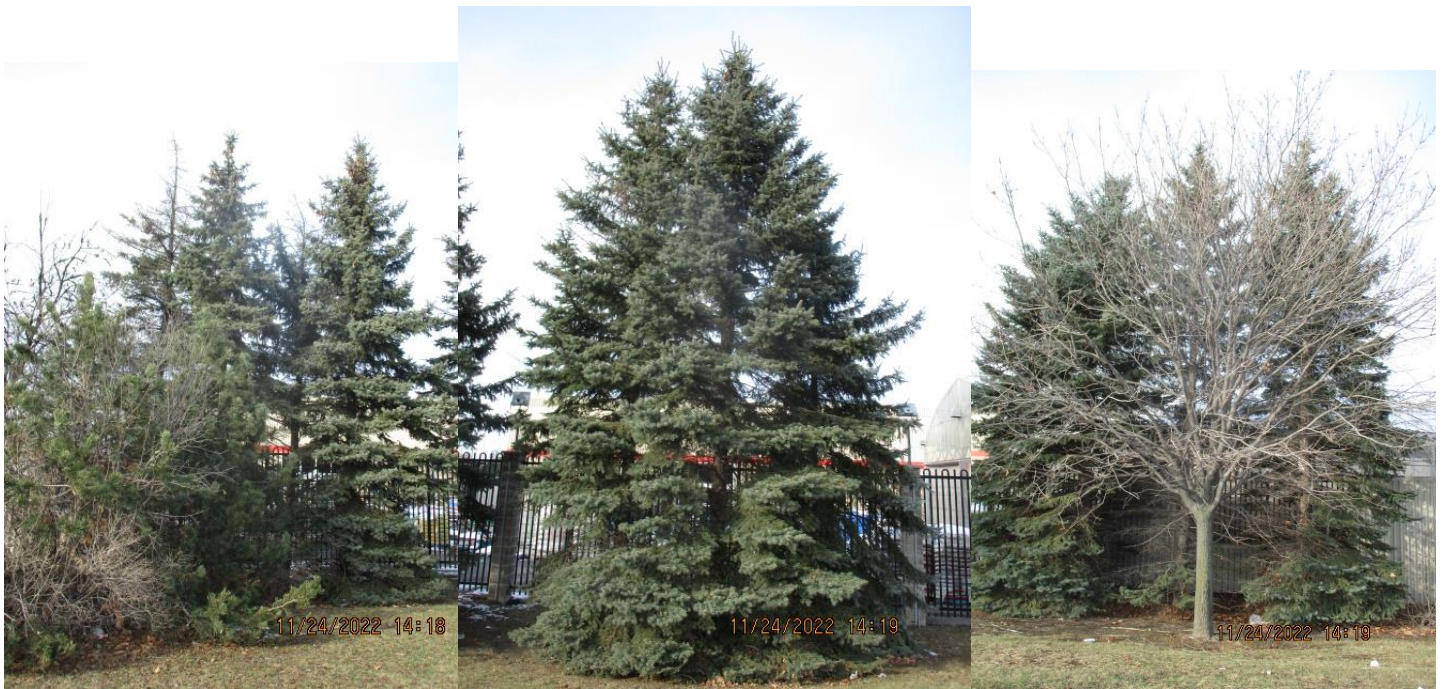
Trees 68 to 71 – Colorado Spruce