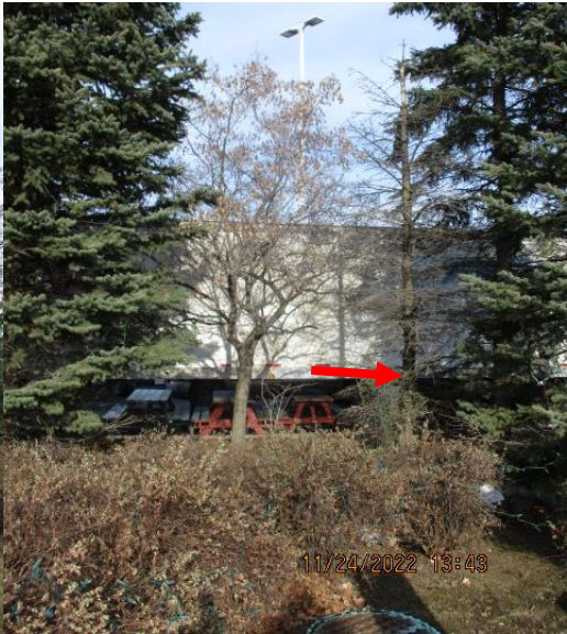
Tree 50 – dead Spruce