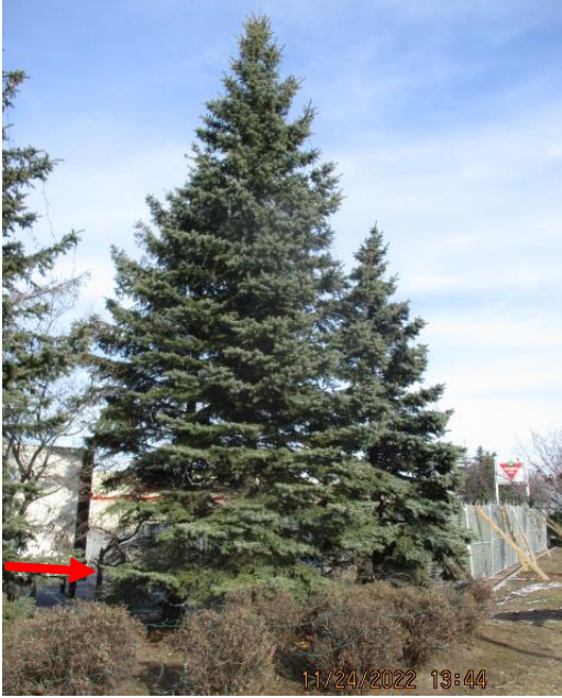
Tree 54 – Amur Maple