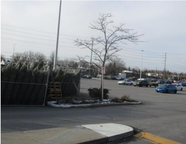
Tree 65 – Honeylocust