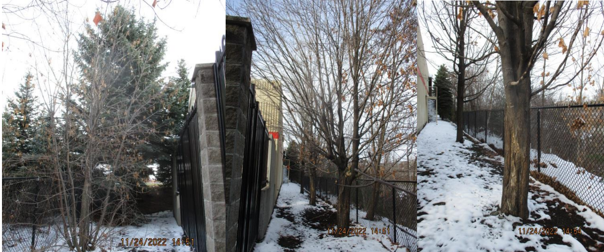
Tree 88 – Green Ash with 87 to south