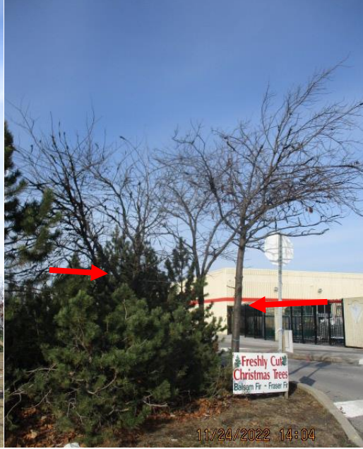
Trees 62(left) and 63 (right) – Schubert Cherry