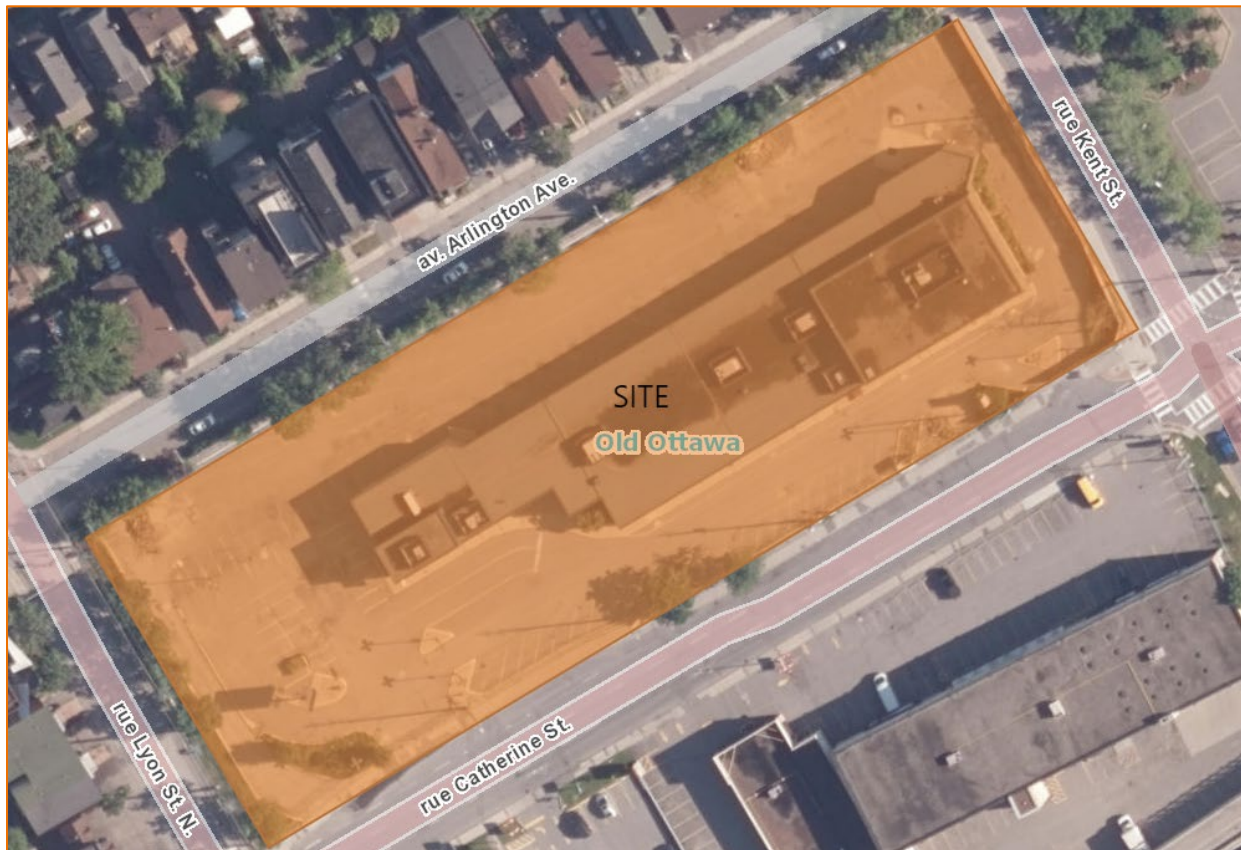
Figure 1.1: Key Plan of Site

The site is 1.0 ha in area and is situated along the north side of Catherine Street, the south side of Arlington Avenue, the west side of Kent Street, and the east side of Lyon Street North. The site is currently zoned GM [1875] S271 and consists of the former Greyhound bus terminal that has now been demolished. The site is bounded by Catherine Street to the south, Kent Street to the east, Lyon Street North to the west, and Arlington Avenue to the north, as shown in Figure 1.1 below.