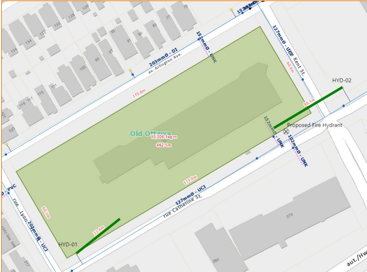
Figure 3.1: Fire Hydrant Coverage Sketch

along Catherine Street alone. See Appendix B.5 for fire hydrant coverage table calculations and NFPA Table 18.5.4.3.