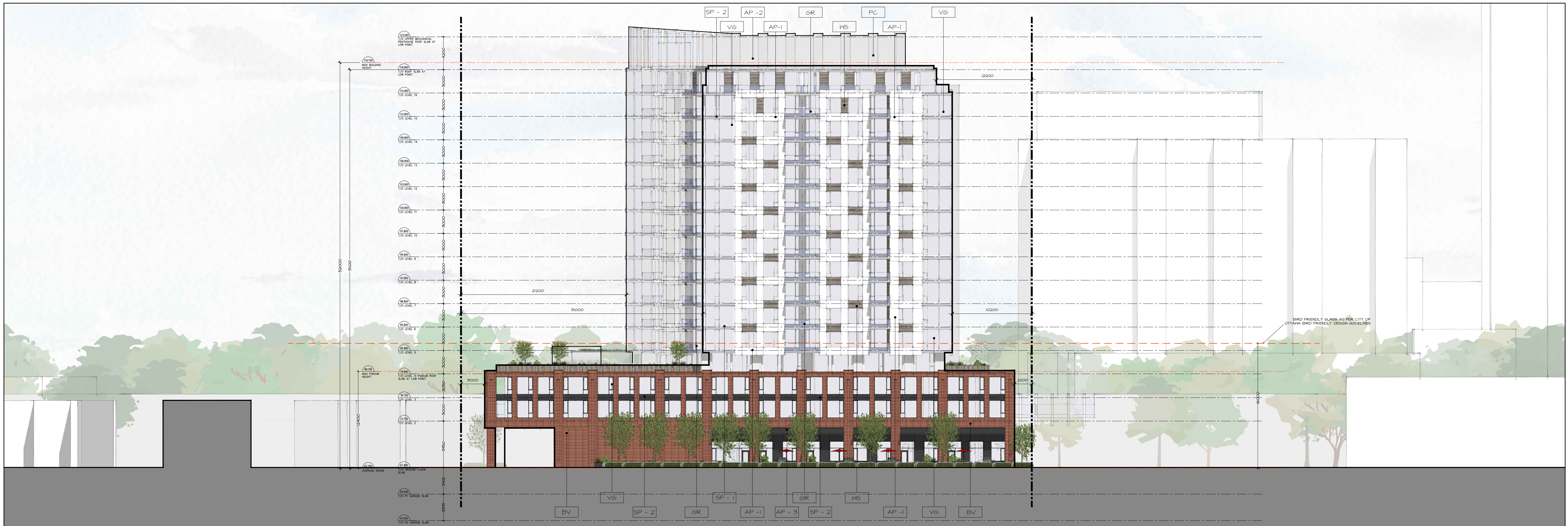
1 SOUTH ELEVATION A3.00 1 : 250