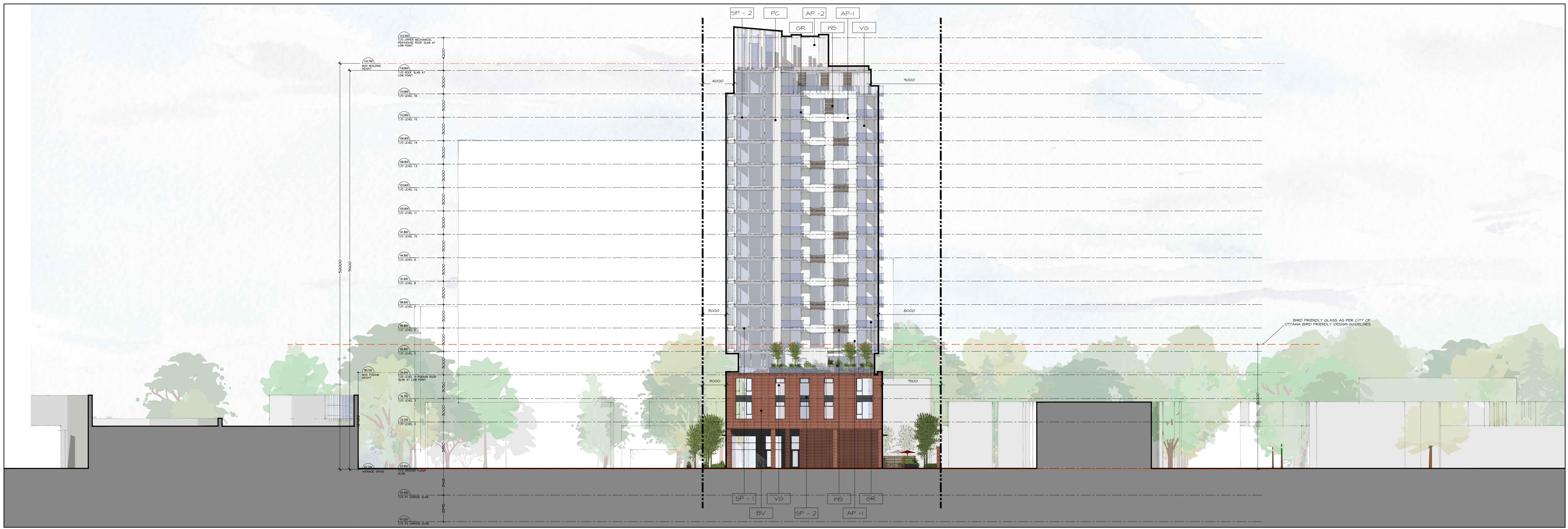
2 WEST ELEVATION A3.01 1:250