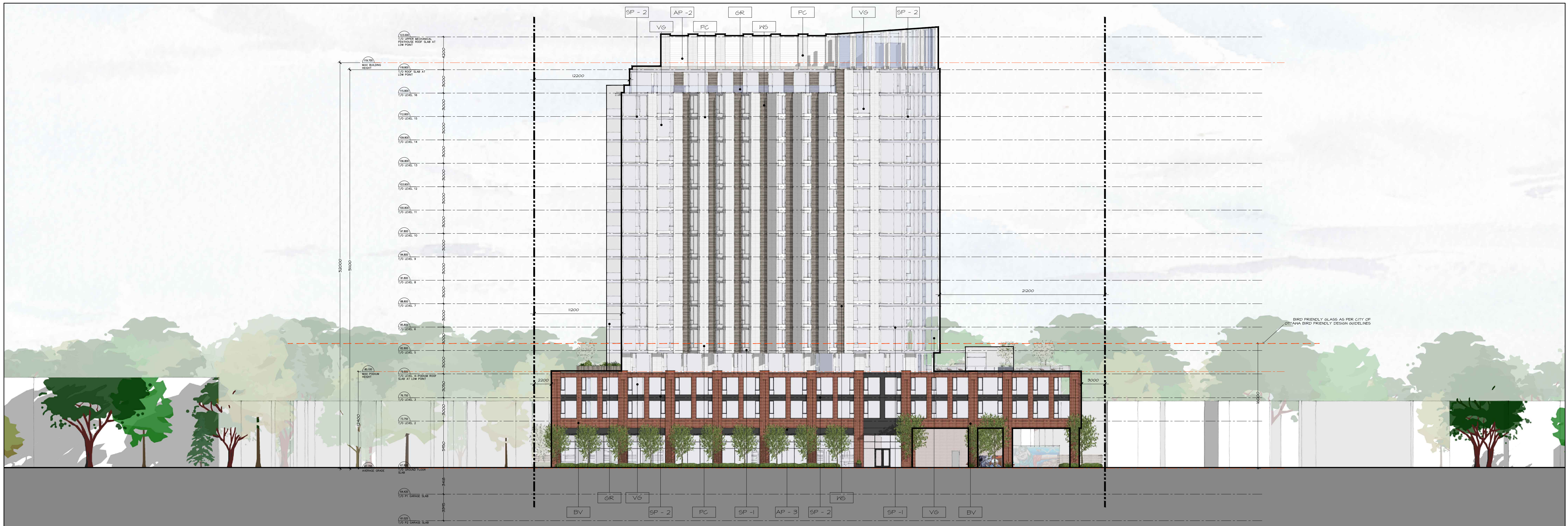
1 NORTH ELEVATION A3.01 1:250