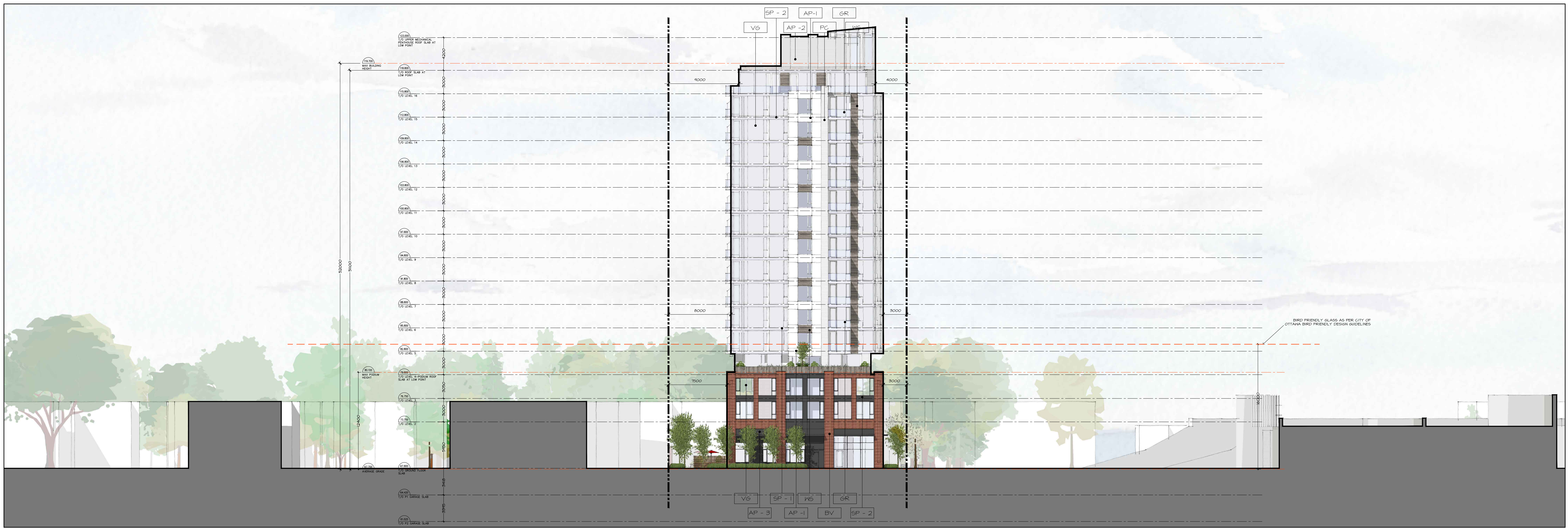
2 EAST ELEVATION A3.00 1 : 250