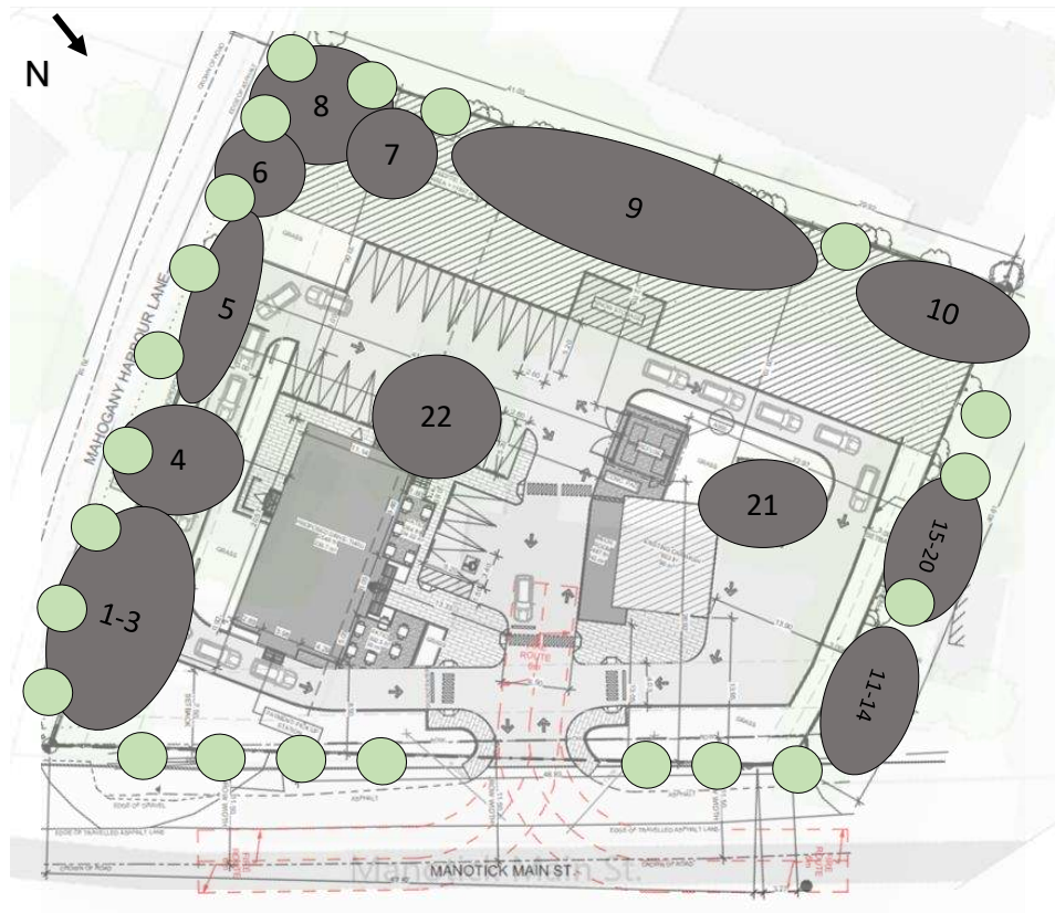
Map #2: Overlay of development plans onto area map.

Trees to be planted Trees or clusters to trees to be removed