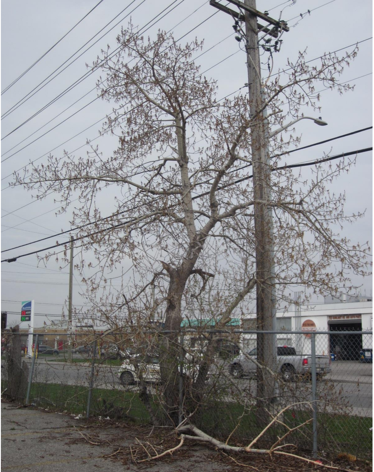
Picture 4. Tree #12, poplar tree shared with City of Ottawa property adjacent to 1531 St. Laurent Boulevard