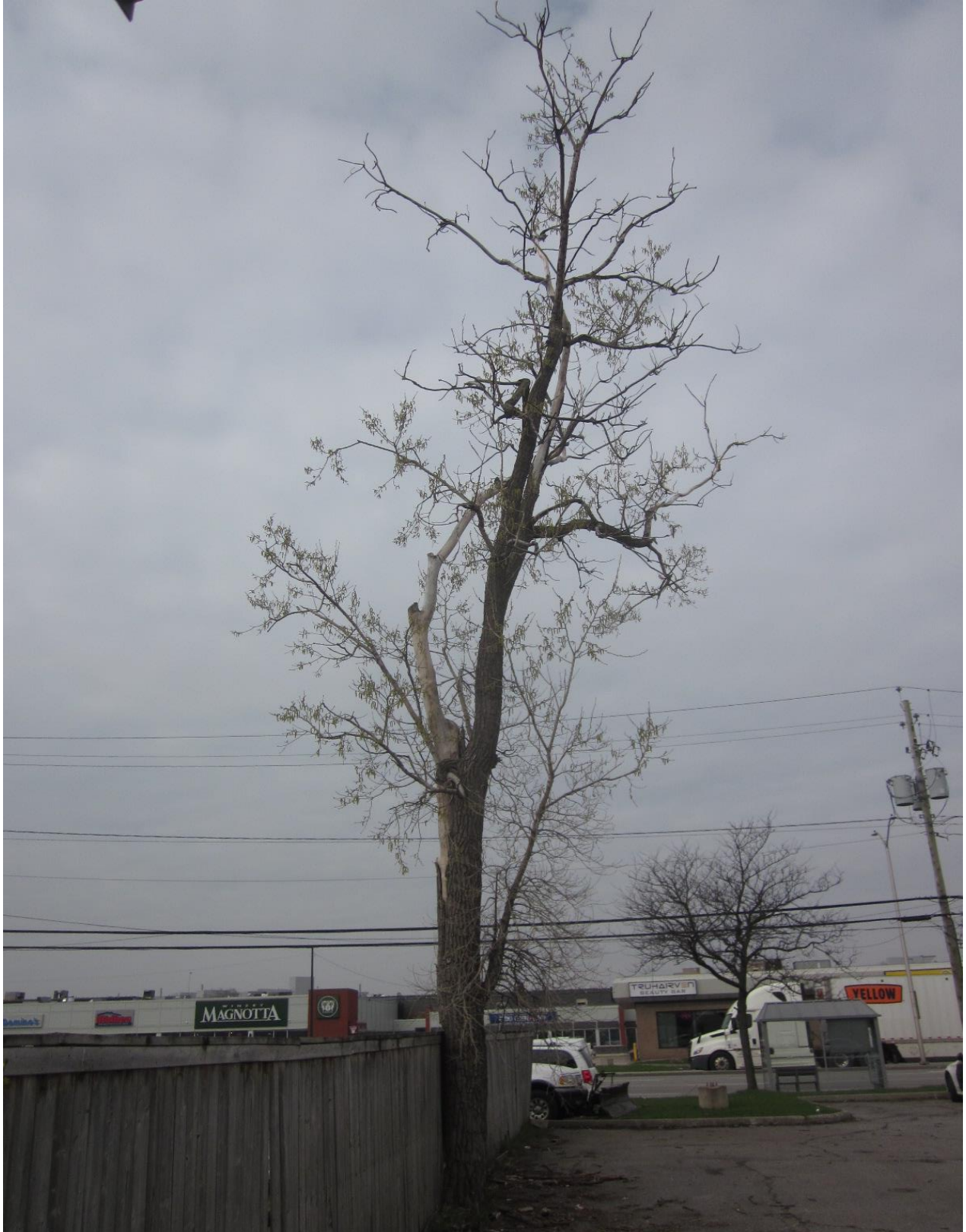
Picture 1. Tree #1, cottonwood shared with 1531 St. Laurent Boulevard