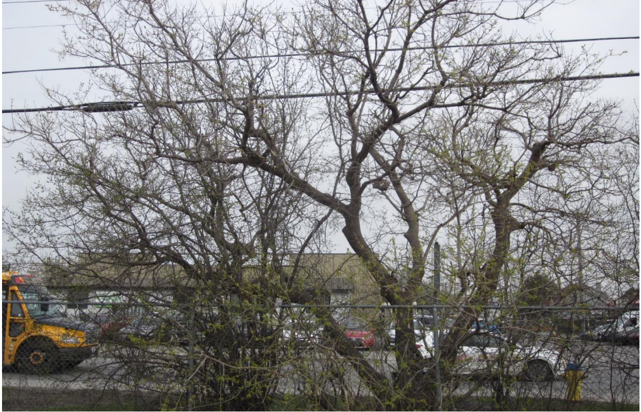
Picture 5. Tree #13, Manitoba maple on City of Ottawa property adjacent to 1531 St. Laurent Boulevard