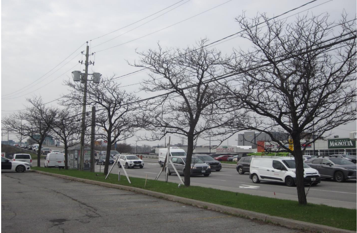
Picture 2. Trees #2-6, honey-locusts located on City of Ottawa property adjacent to 1531 St. Laurent Boulevard