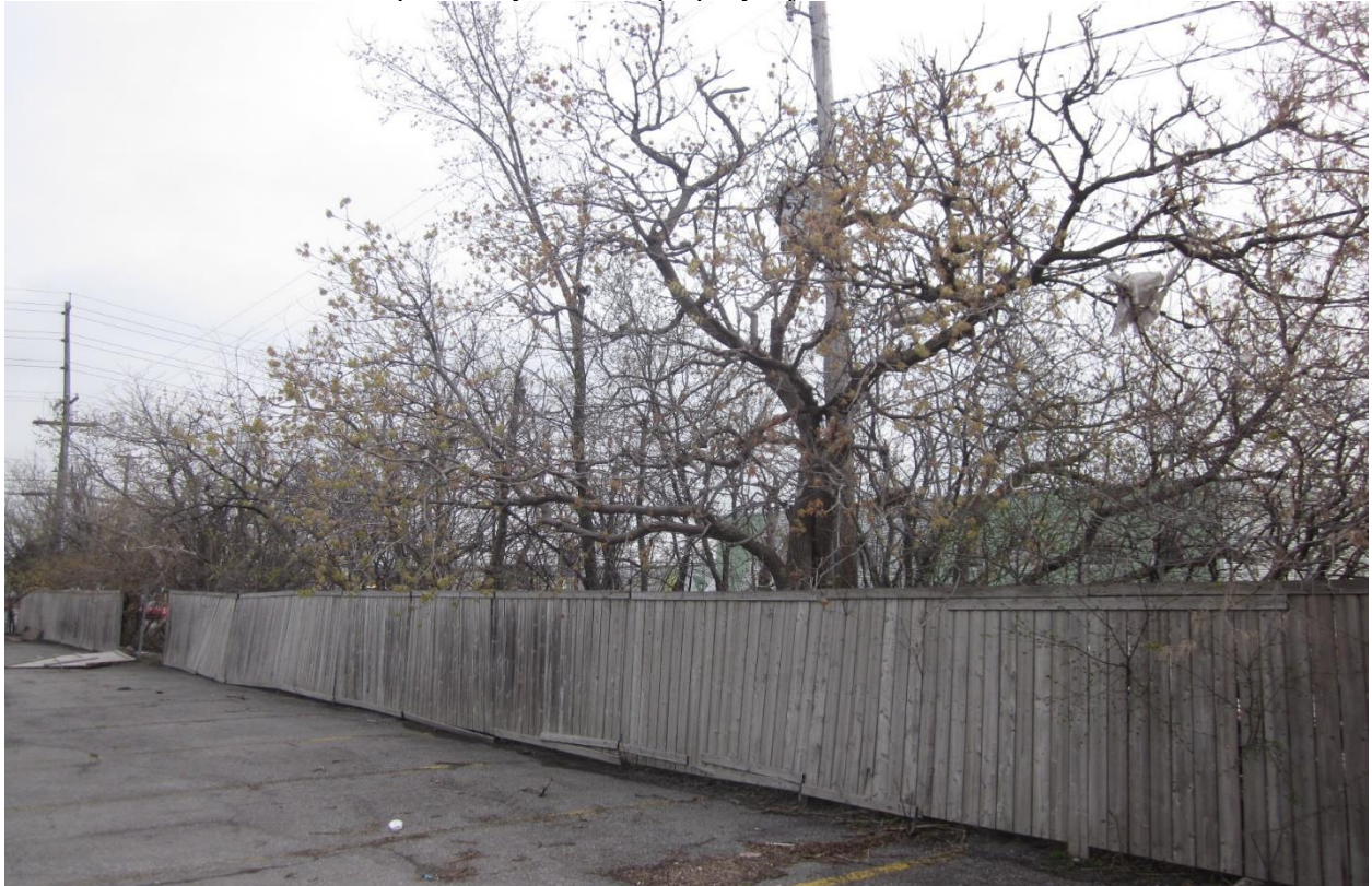
Picture 6. Tree grouping #14, Manitoba maple and white elm on City of Ottawa property adjacent to 1531 St. Laurent Boulevard