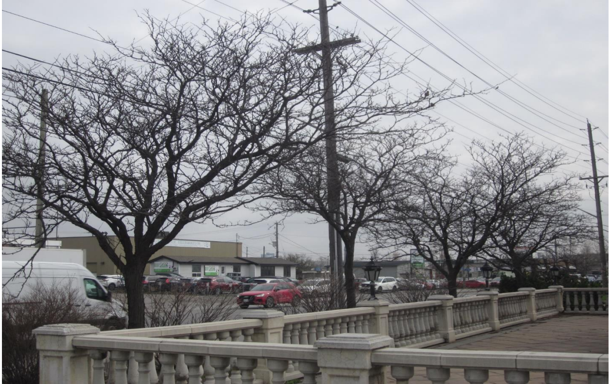
Picture 3. Trees #7-10, honey-locusts located on City of Ottawa property adjacent to 1531 St. Laurent Boulevard