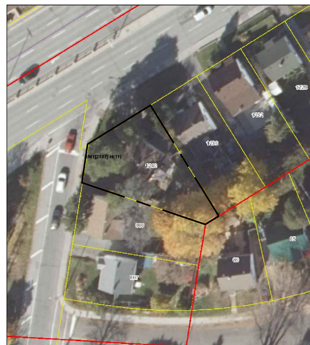
KEY PLAN TOPOGRAPHIC PLAN OF SURVEY OF LOT 3 REGISTERED PLAN 267570 CITY OF OTTAWA SURVEYED BY ANNIS, O'SULLIVAN, VOLLEBEKK LTD. DATED FEBRUARY 01, 2021