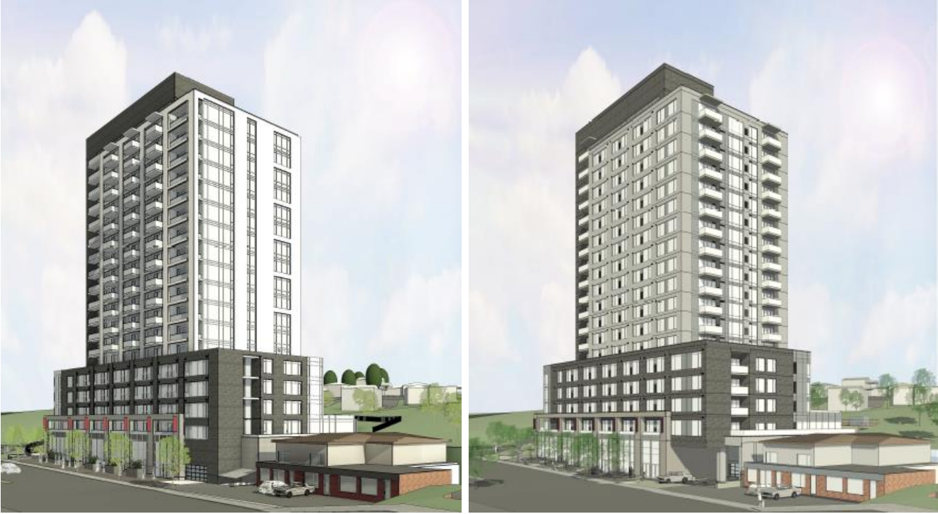
Figure 4: View Looking Southeast from across St. Joseph Boulevard, with the original design (left) and revised design (right)