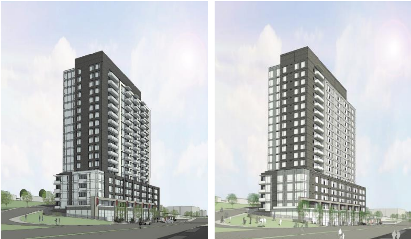
Figure 3: View Looking Southwest from across St. Joseph Boulevard, with the original design (left) and revised design (right)