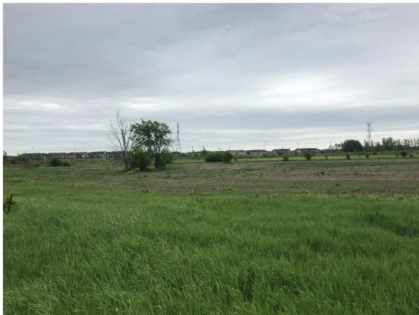
Photograph No. 2

View of the Site from the south property line, looking north.