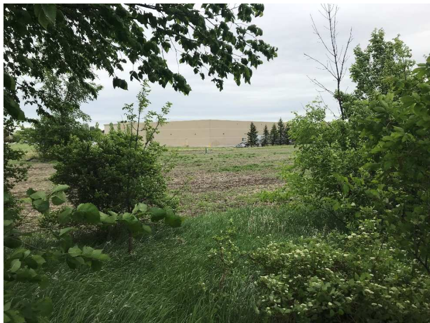
Photograph No. 6

View of the adjacent property to the east.