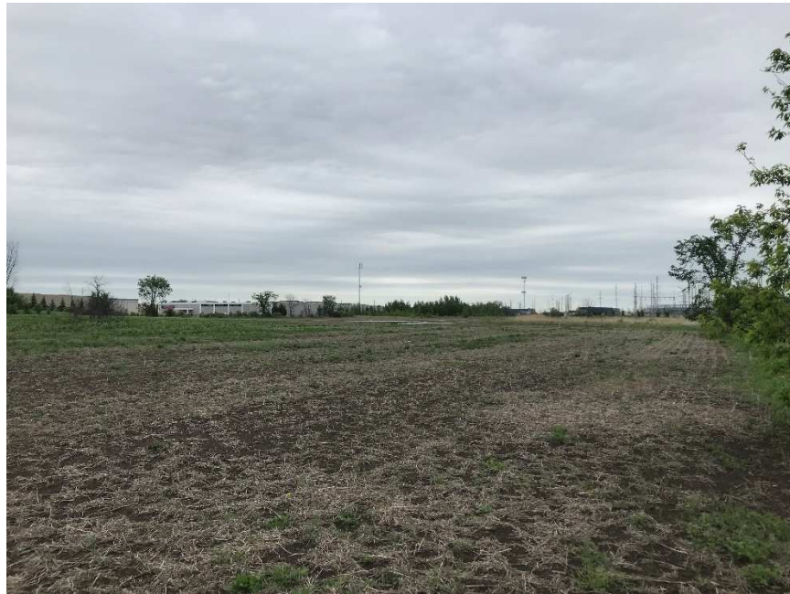
Photograph No. 5

View of the adjacent property to the east.