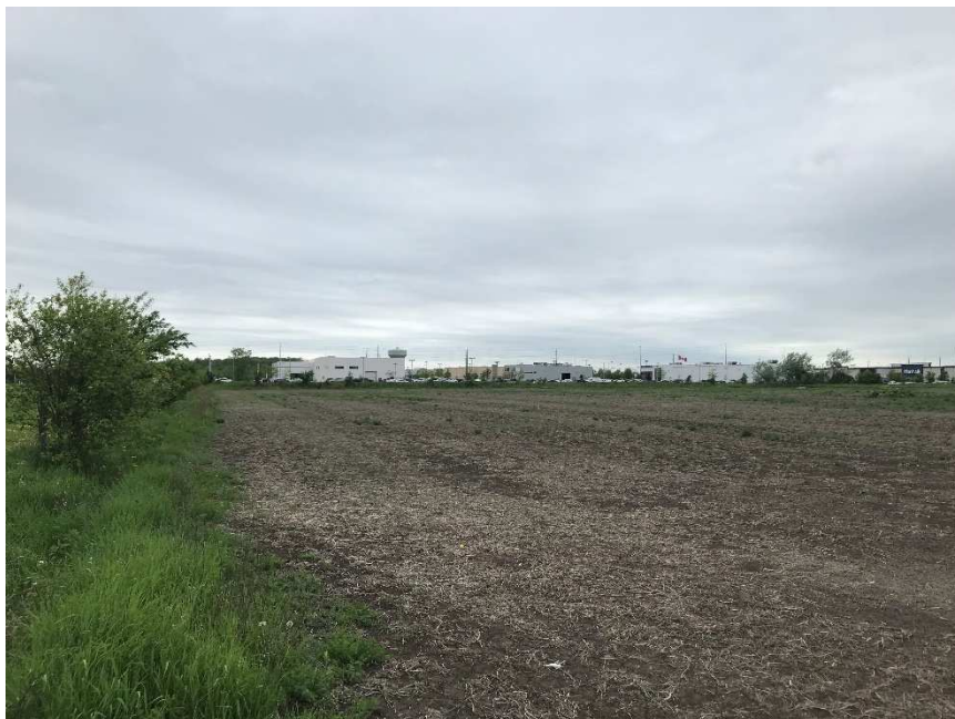
Photograph No. 4

View of the adjacent property to the south.