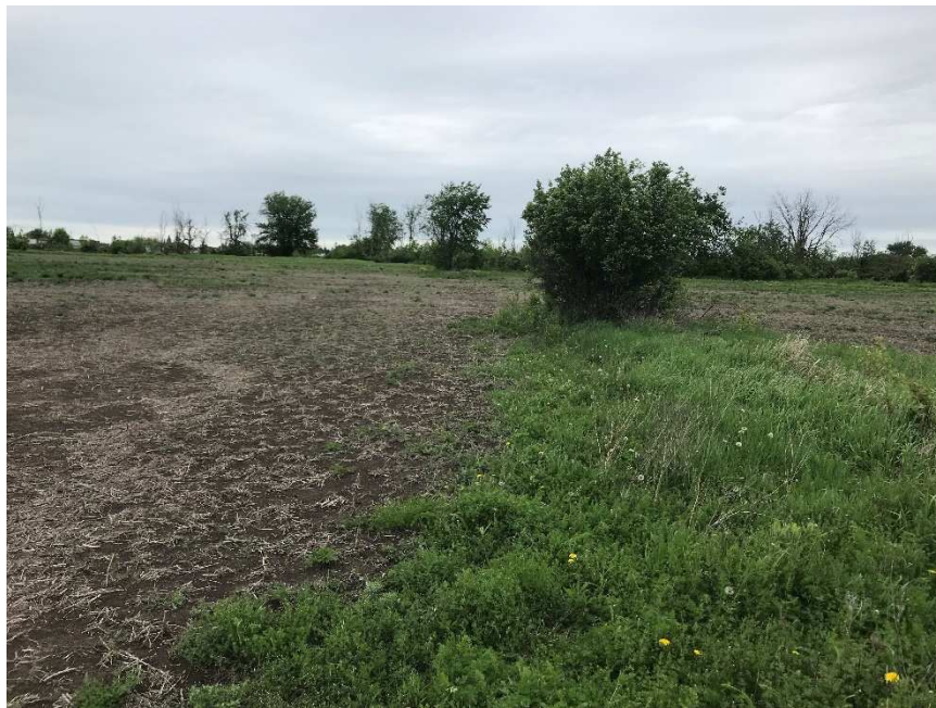
Photograph No. 1

View of the Site from the south property line, looking north.