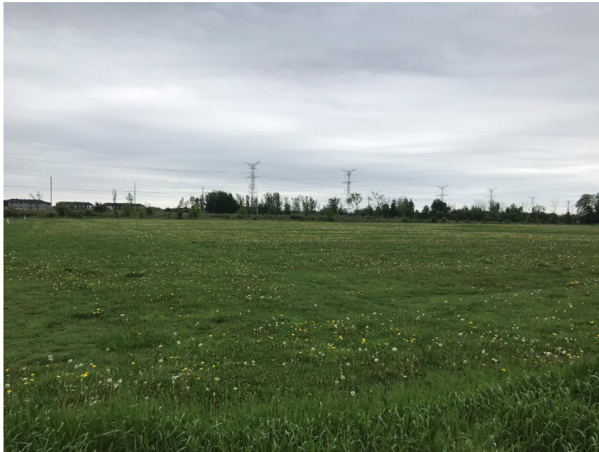
Photograph No. 3

View of the adjacent property to the south.